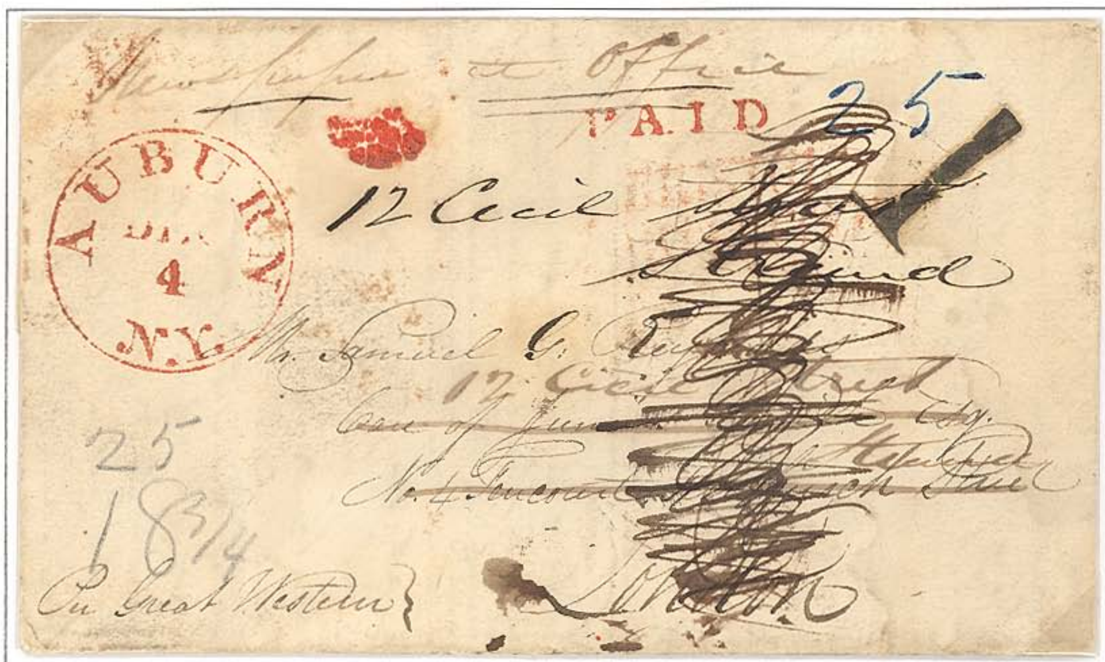
Folded Letter: Auburn, New York to London, 4 December 1840

Ship: Great Western Company: Great Western Steam Ship Company Depart: New York, 9 December 1840 Arrive: Bristol, 23 December 1840 Voyage: 17th Return