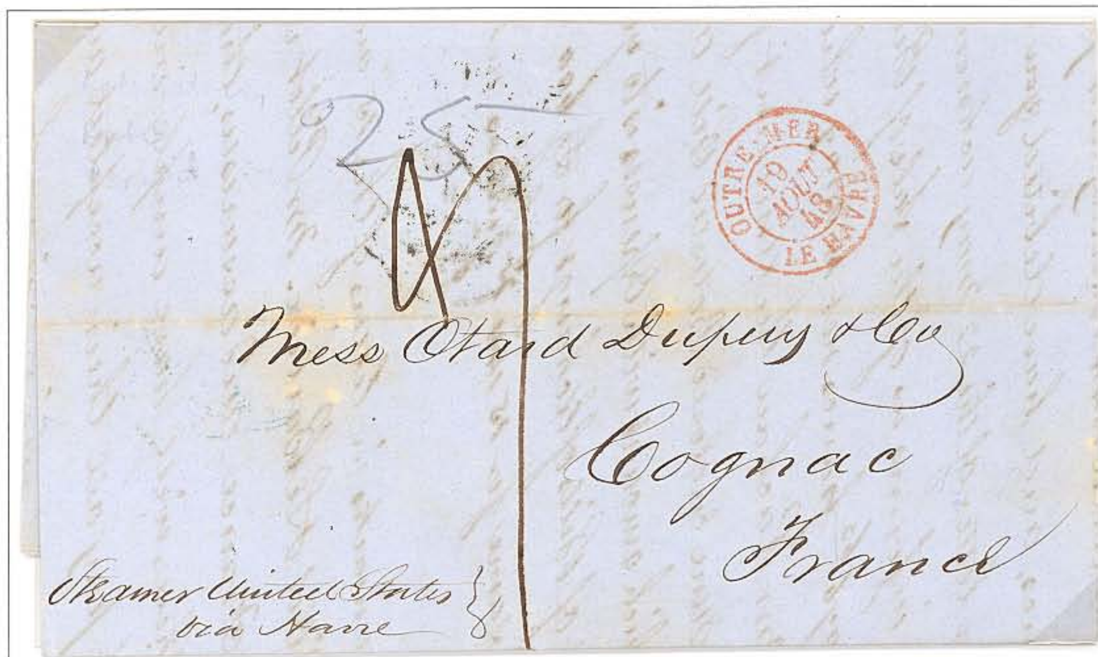
Folded Letter: New York to Cognac, France, 1 August 1848

Ship: United States Company: Black Ball Line Steamship Depart: New York, 5 August 1848 Arrive: Havre, 19 August 1848 Voyage: 3rd Rate: 25¢ prepaid for single rate 9 decimes postage due in Cognac