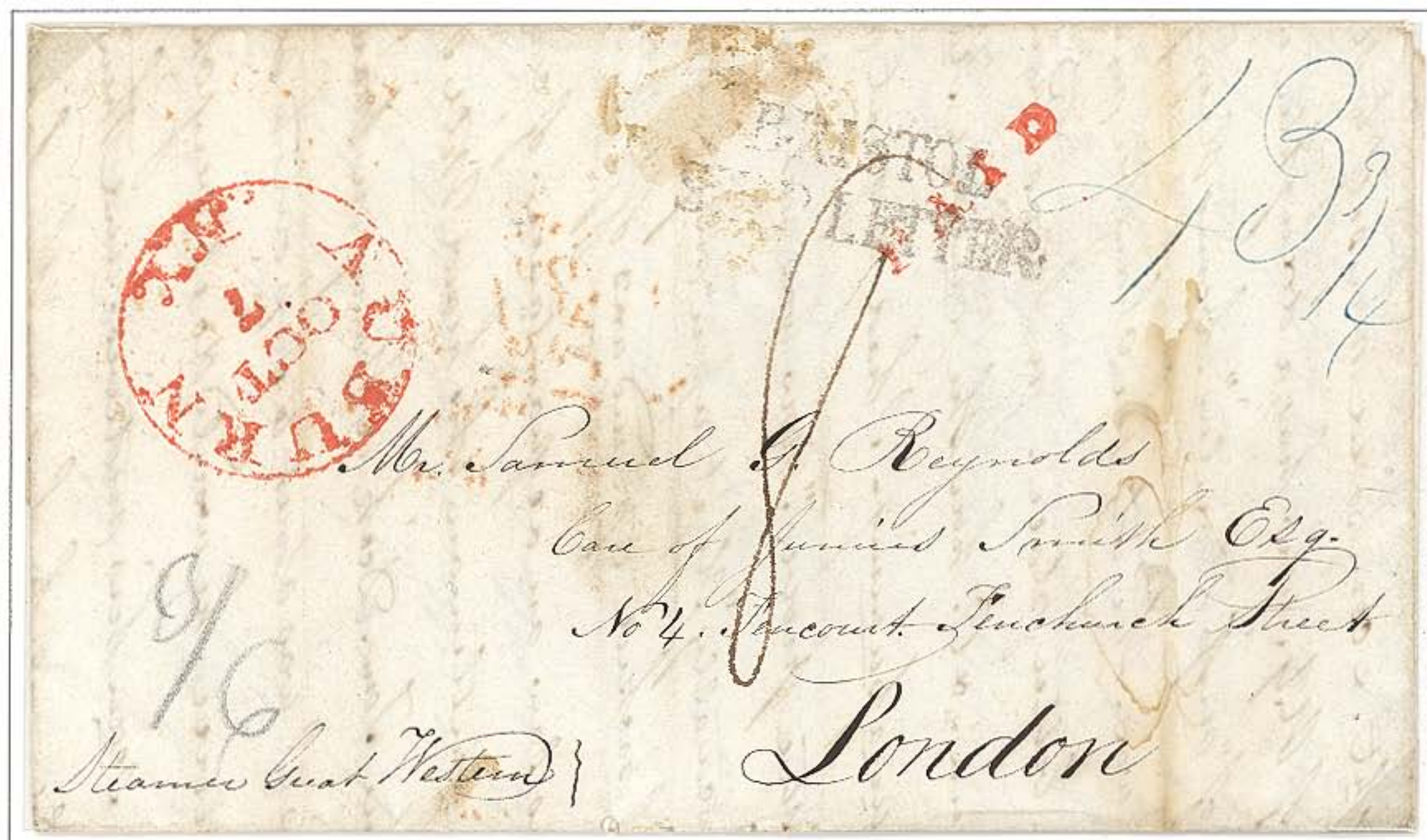
Folded Letter: Auburn, New York, to London, 7 October 1840

Ship: Great Western Company: Great Western Steam Ship Company Depart: New York, 10 October 1840 Arrive: Bristol, 24 October 1840 Voyage: 16th Return Rate: 43 3 / 4 ¢ prepaid for single rate 8d postage due in London