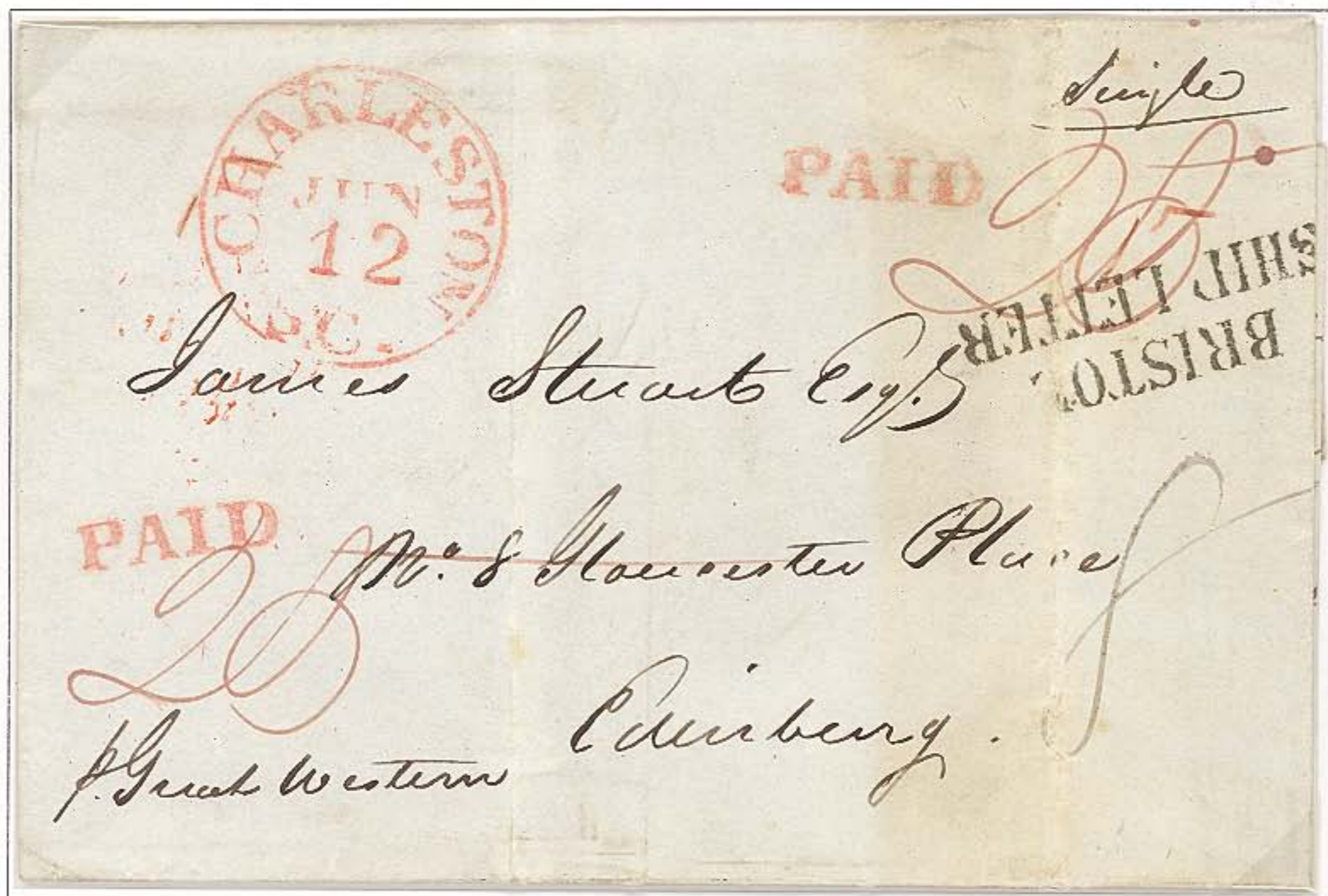
Folded Letter: Charleston, South Carolina to Edinburgh, Scotland, 11 June 1842

Ship: Great Western Company: Great Western Steam Ship Company Depart: New York, 16 June 1842 Arrive: Bristol, 29 June 1842 Voyage: 24th Return Rate: 50¢ prepaid for single rate 8d postage due in Edinburgh