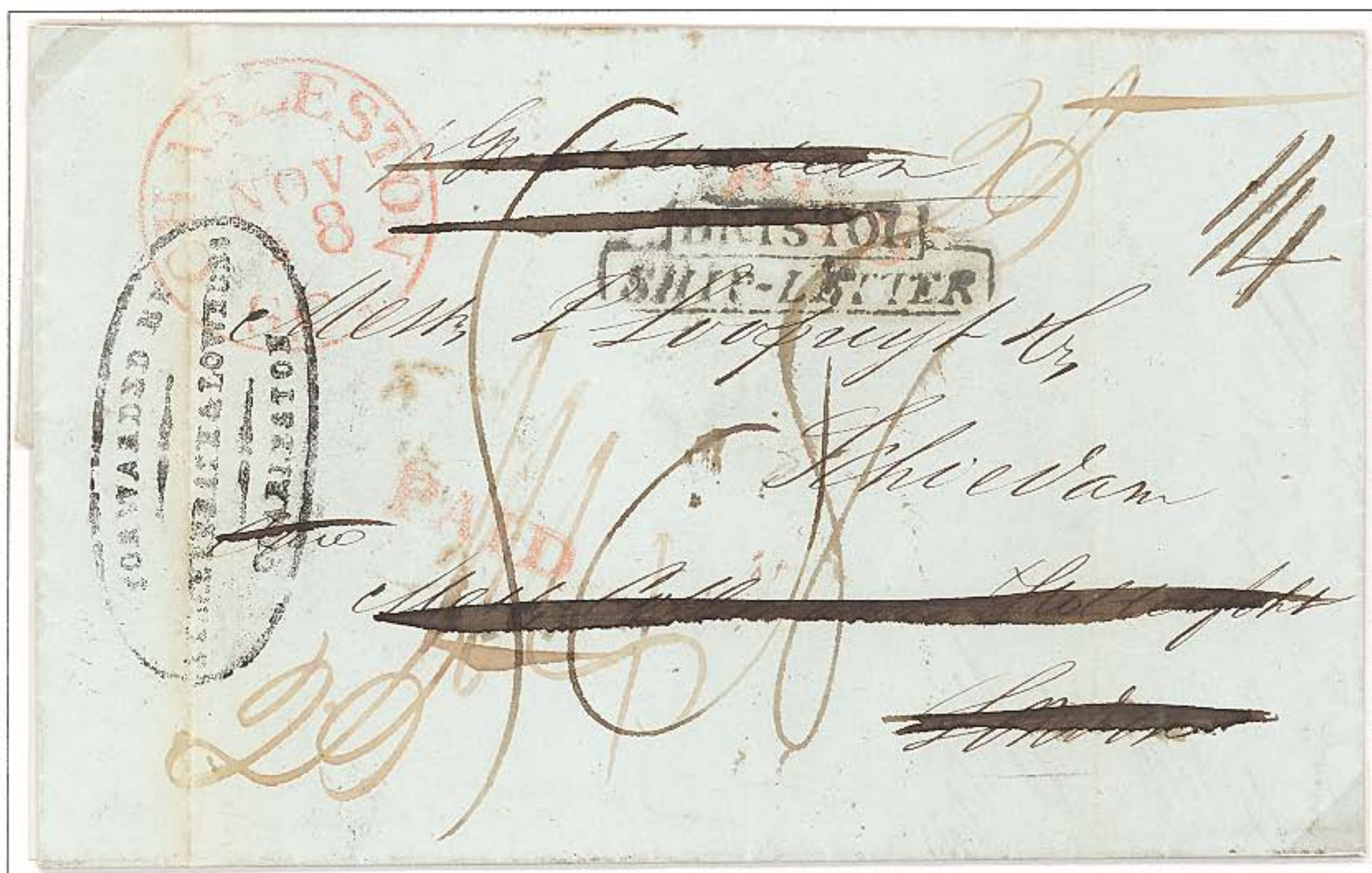
Folded Letter: Charleston, South Carolina to Schiedam, Holland, 18 November 1841

Ship: Great Western Company: Great Western Steam Ship Company Depart: New York, 23 November 1841 Arrive: Bristol, 6 December 1841 Voyage: 22nd Return Rate: 50¢ prepaid for single rate 8d postage due in London 50 Cents Postage due in Scheidam