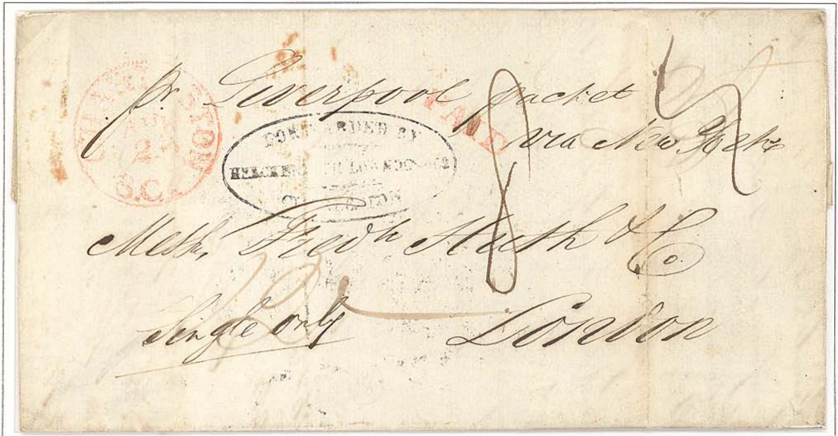
Folded Letter Outer Sheet: Charleston, South Carolina to London, 20 April 1843