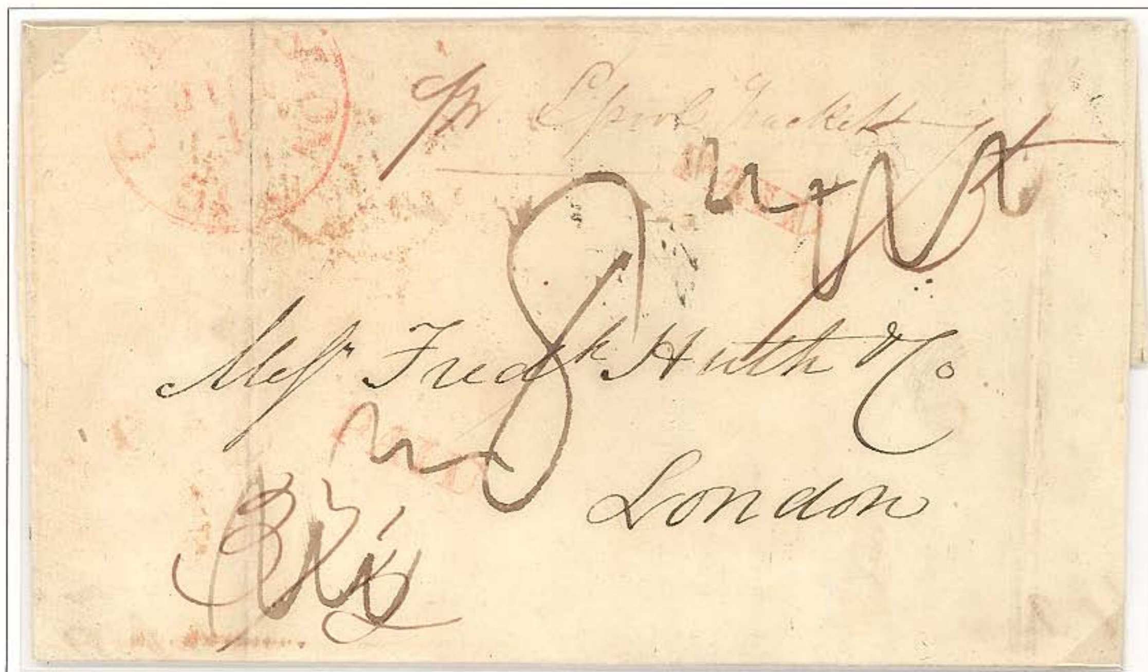
Folded Letter: Charleston, South Carolina to London, 4 June 1842