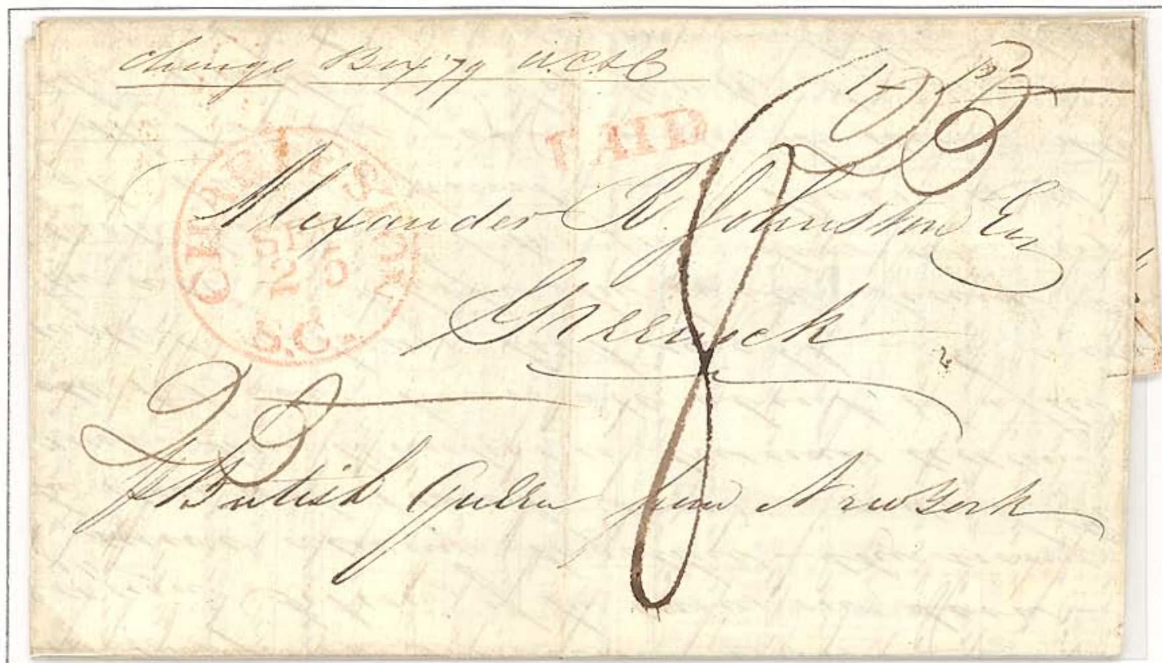
Folded Letter: Charleston, South Carolina to Greenock, Scotland, 25 September 1840

Ship: British Queen Company: British & American Steam Navigation Company Depart: New York, 1 October 1840 Arrive: Portsmouth, 17 October 1840 Voyage: 7th Return Rate: 50¢ prepaid for single rate 8d postage due in London