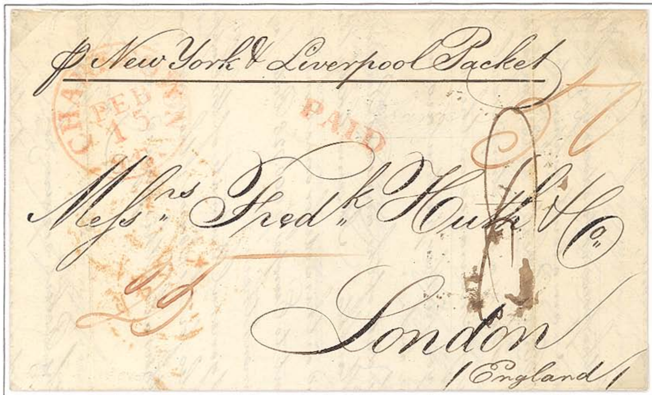
Folded Letter: Charleston, South Carolina to London, 15 February 1844