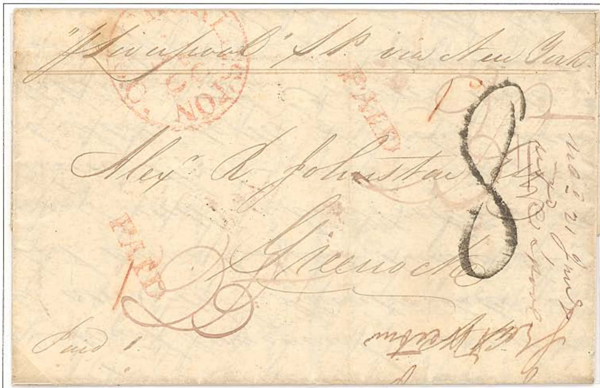
Folded Letter: Charleston, South Carolina to Greenock, Scotland, 10 December 1839

Ship: Liverpool Company: Transatlantic Steam Ship Company Depart: New York, 15 December 1839 Arrive: Liverpool, 11 January 1840 Voyage: 7th Return Rate: 50¢ prepaid for single rate 8d postage due in Greenock