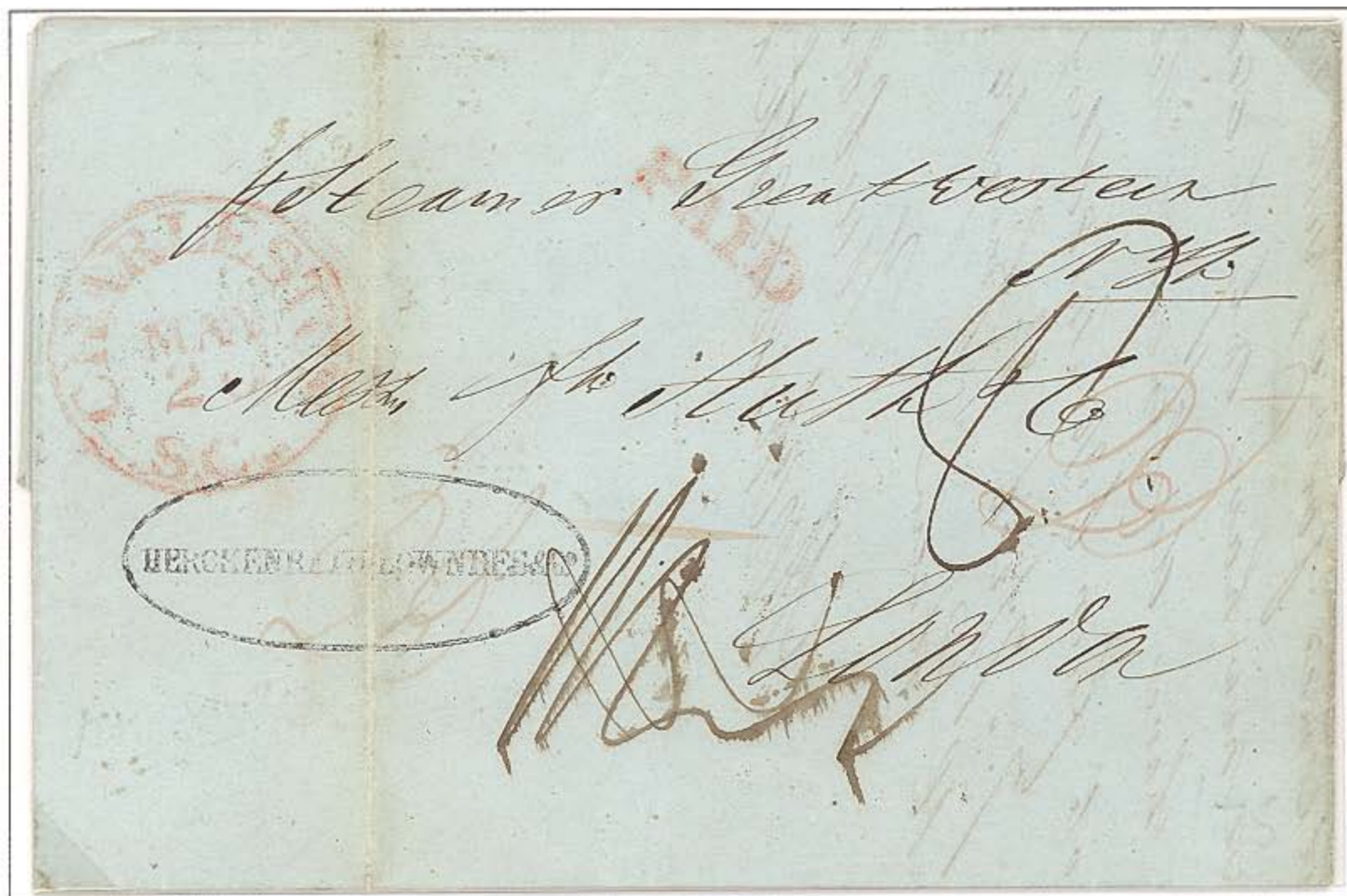
Folded Letter: Charleston, South Carolina to London, 20 May 1843

Ship: Great Western Company: Great Western Steam Ship Company Depart: New York, 25 May 1843 Arrive: Liverpool, 8 June 1843 Voyage: 29th Return Rate: 50¢ prepaid for single rate 8d postage due in London