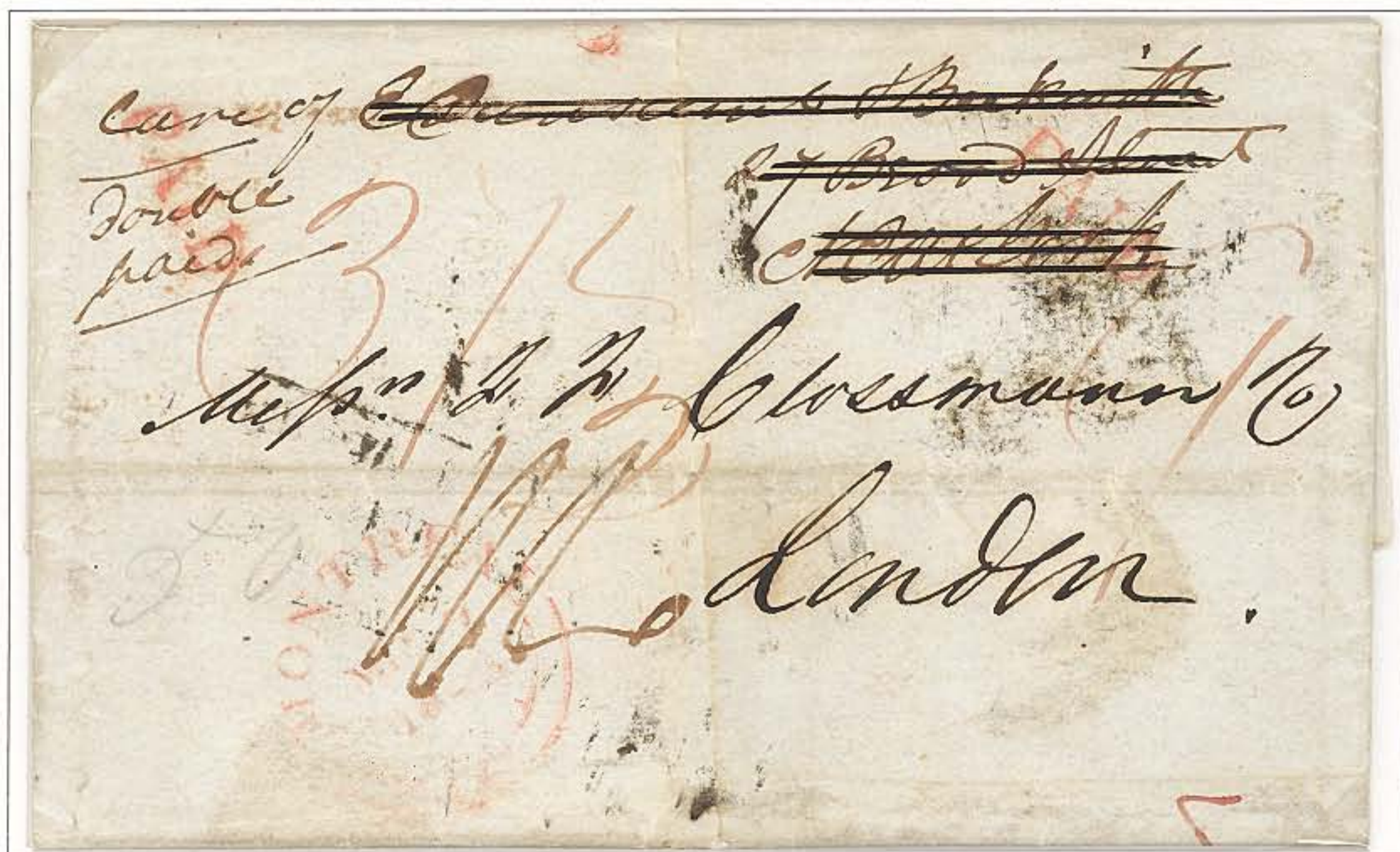
Folded Letter: Montreal, Lower Canada to London, 7 March 1843