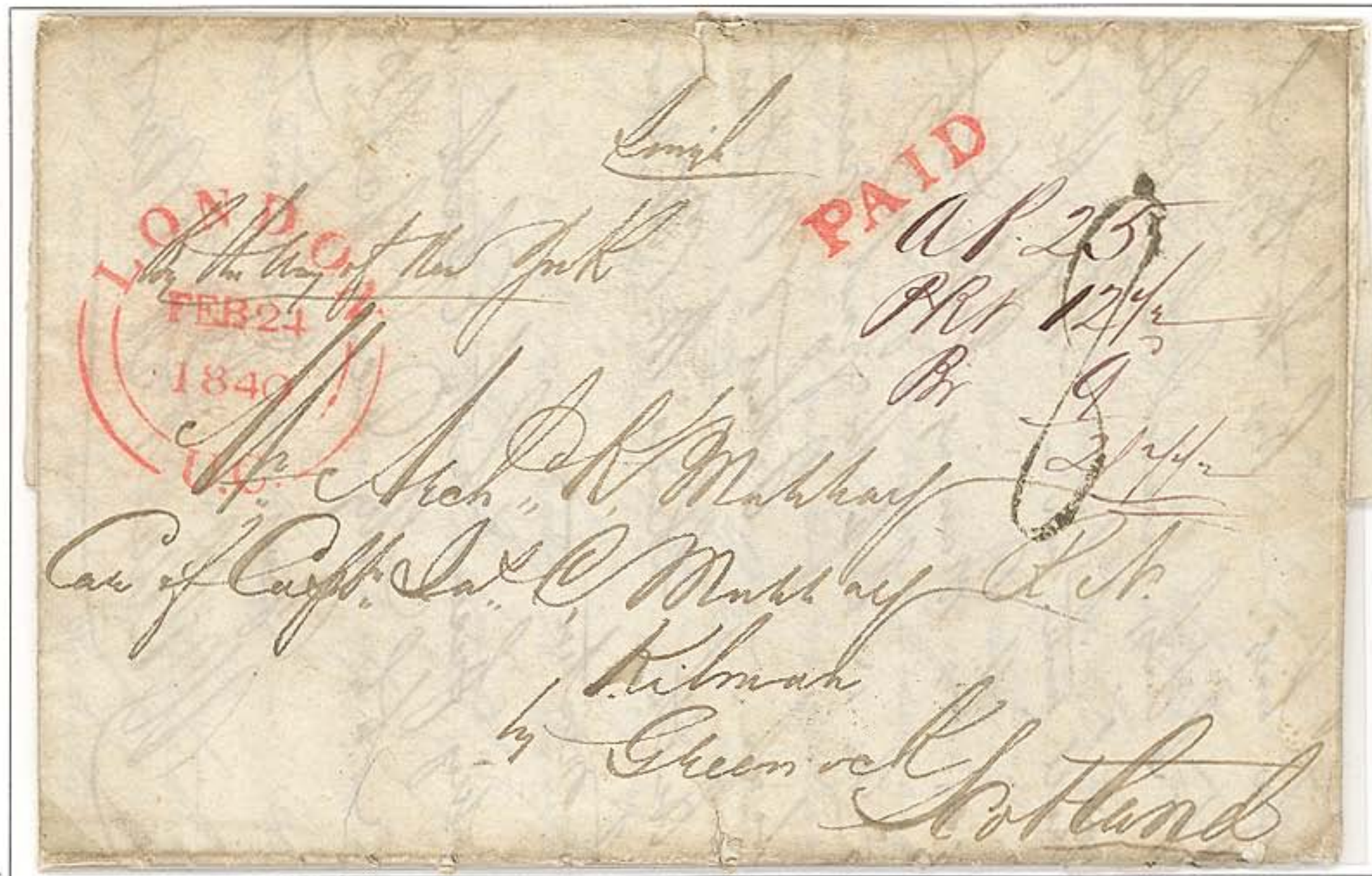
Folded Letter: London, Upper Canada to Kilman, Scotland, 23 February 1840