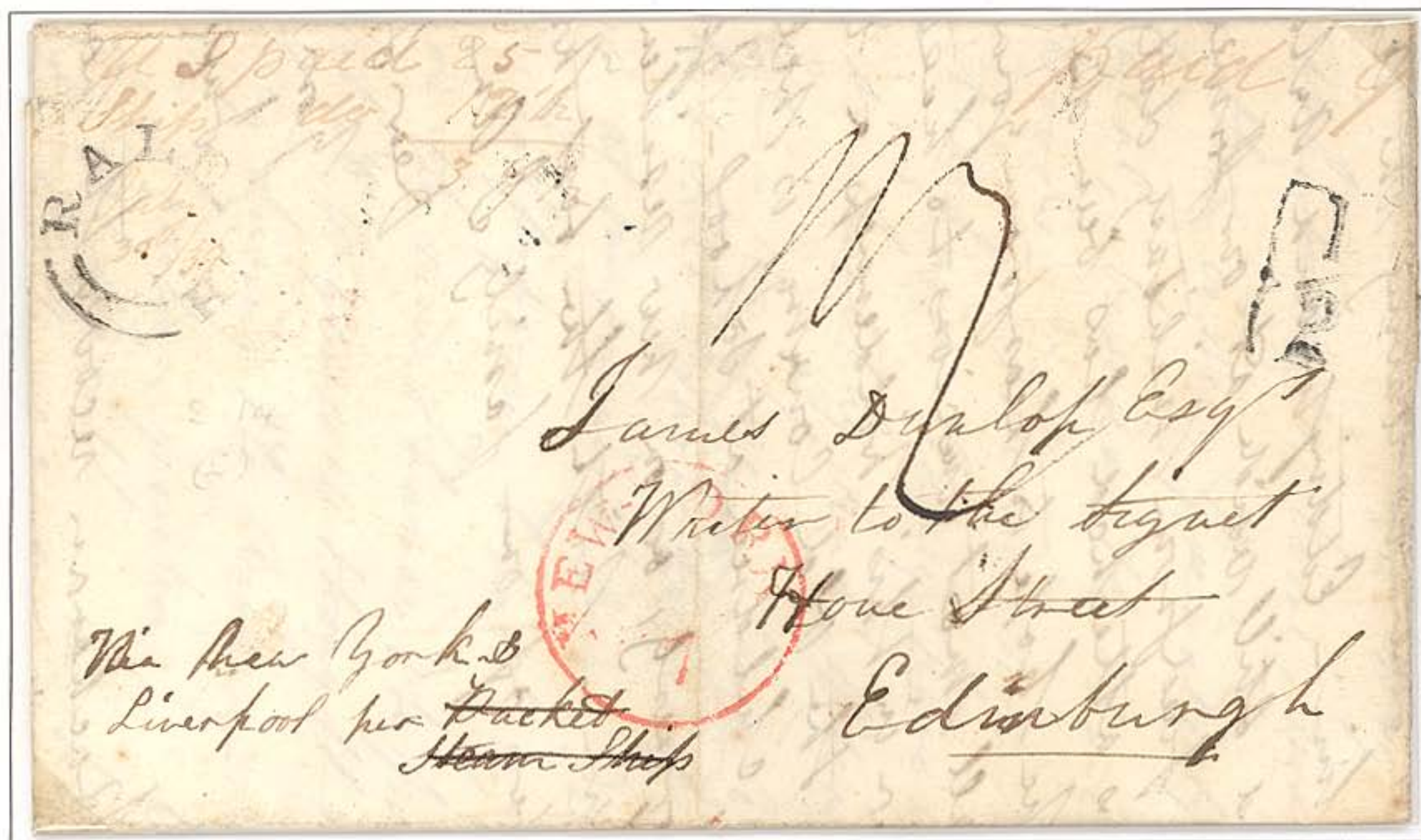
Folded Letter: Chatham, Upper Canada to Edinburgh, Scotland, 27 July 1839