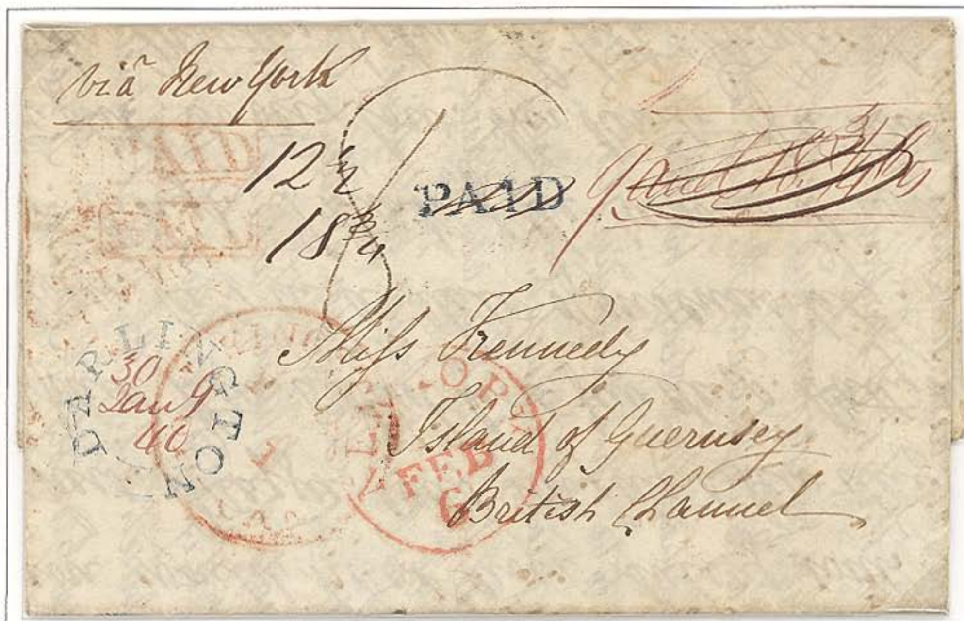
Folded Letter: Darlington, Upper Canada to Guernsey, Channel Island, 29 January 1840

Ship: George Washington Company: Swallowtail Line Depart: New York, 7 February 1840 Arrive: Liverpool, 10 March 1840 Rate: 9dcy + 31¼¢ prepaid for single rate 8d postage due in Guernsey