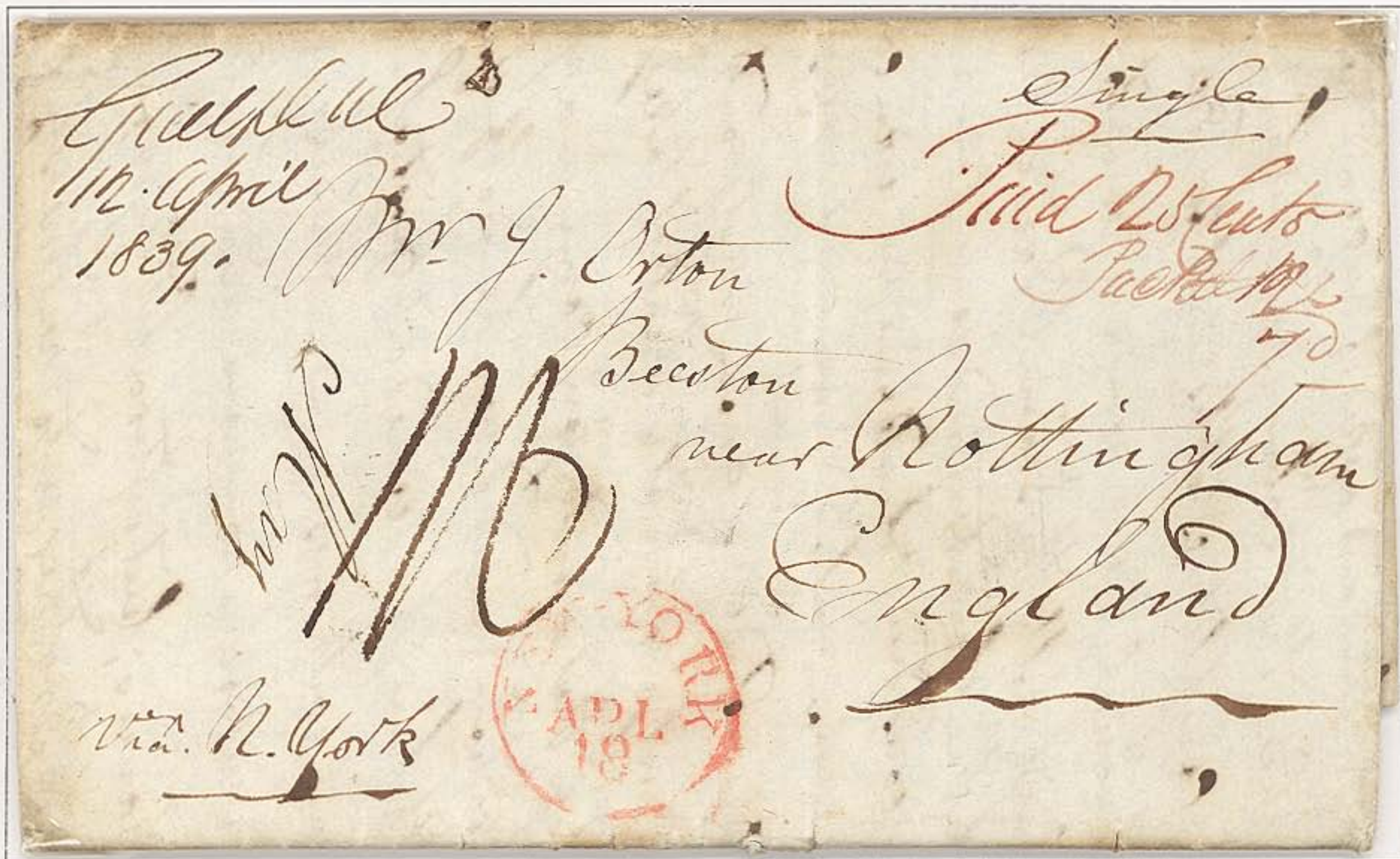
Folded Letter: Guelph, Upper Canada to Beeston near Nottingham, England, 12 April 1839