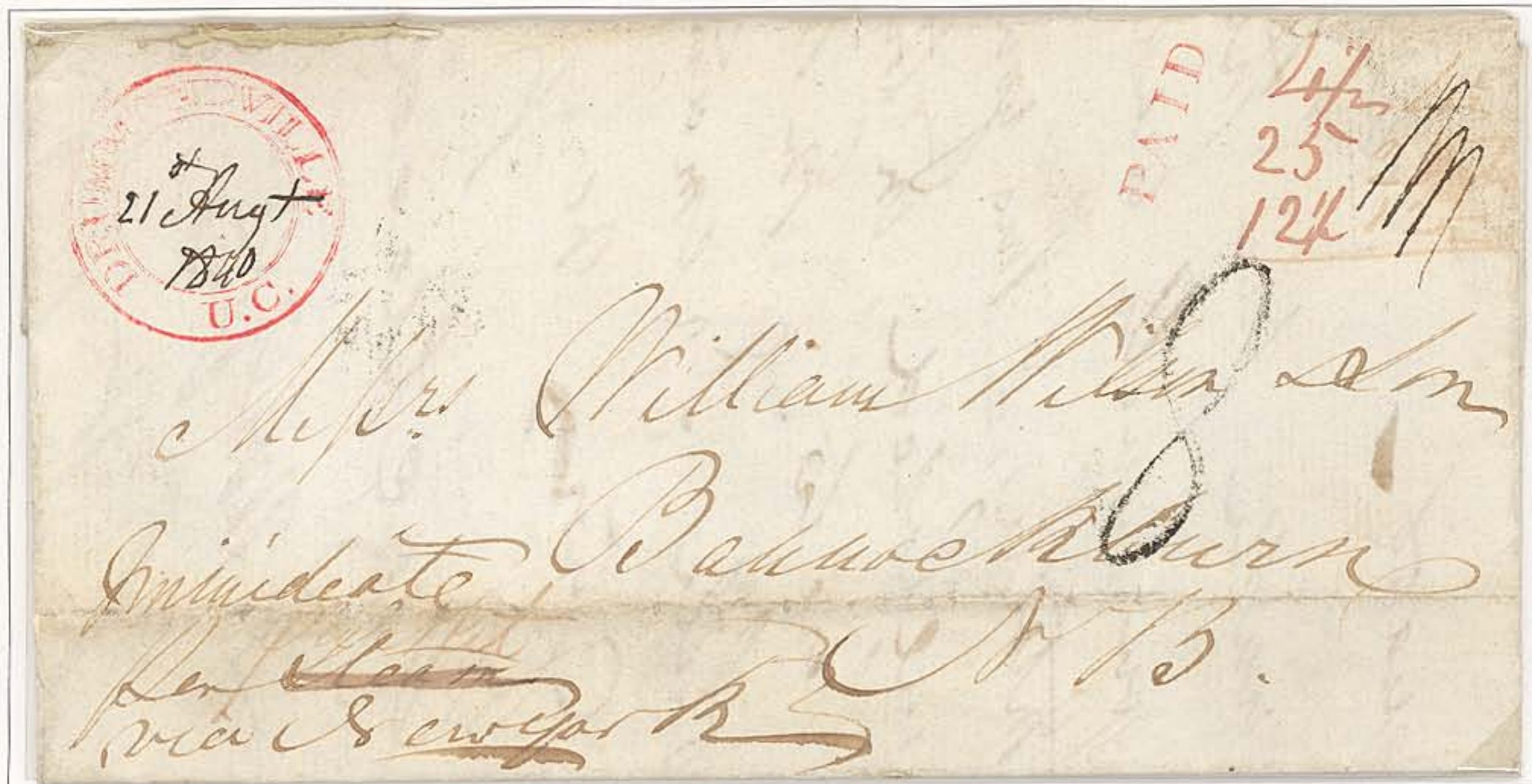
Folded Letter: Drummondville, Upper Canada to Bannockburn, Scotland, 16 August 1840