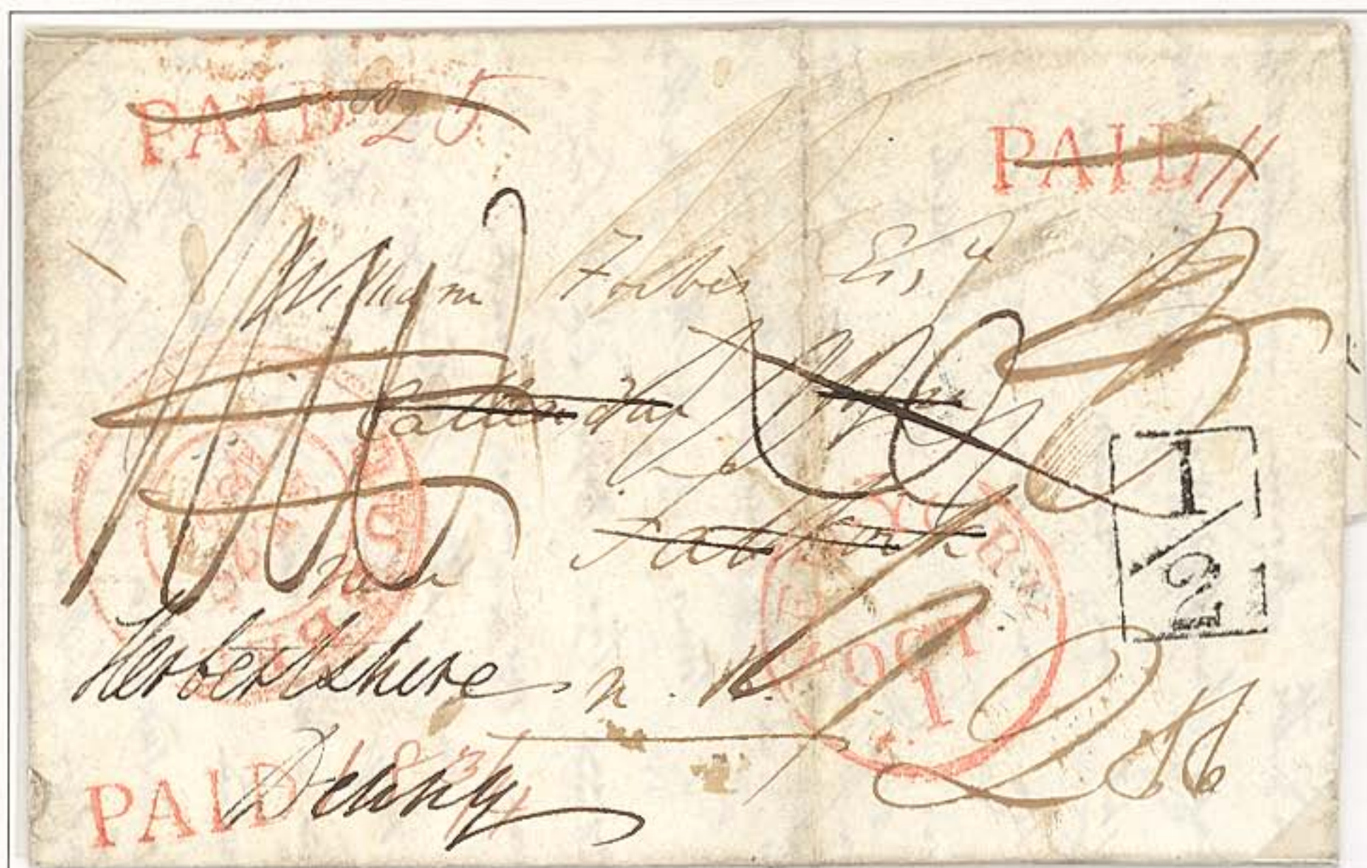
Folded Letter: Quebec, Lower Canada to Falkirk, Scotland, 23 September 1839

Ship: British Queen Company: British & American Steam Navigation Company Depart: New York, 1 October 1839 Arrive: Portsmouth, 15 October 1839 Voyage: 3rd Return Rate: 11dcy + 43 3 / 4 ¢ prepaid for single rate 1s10d postage due in Falkirk