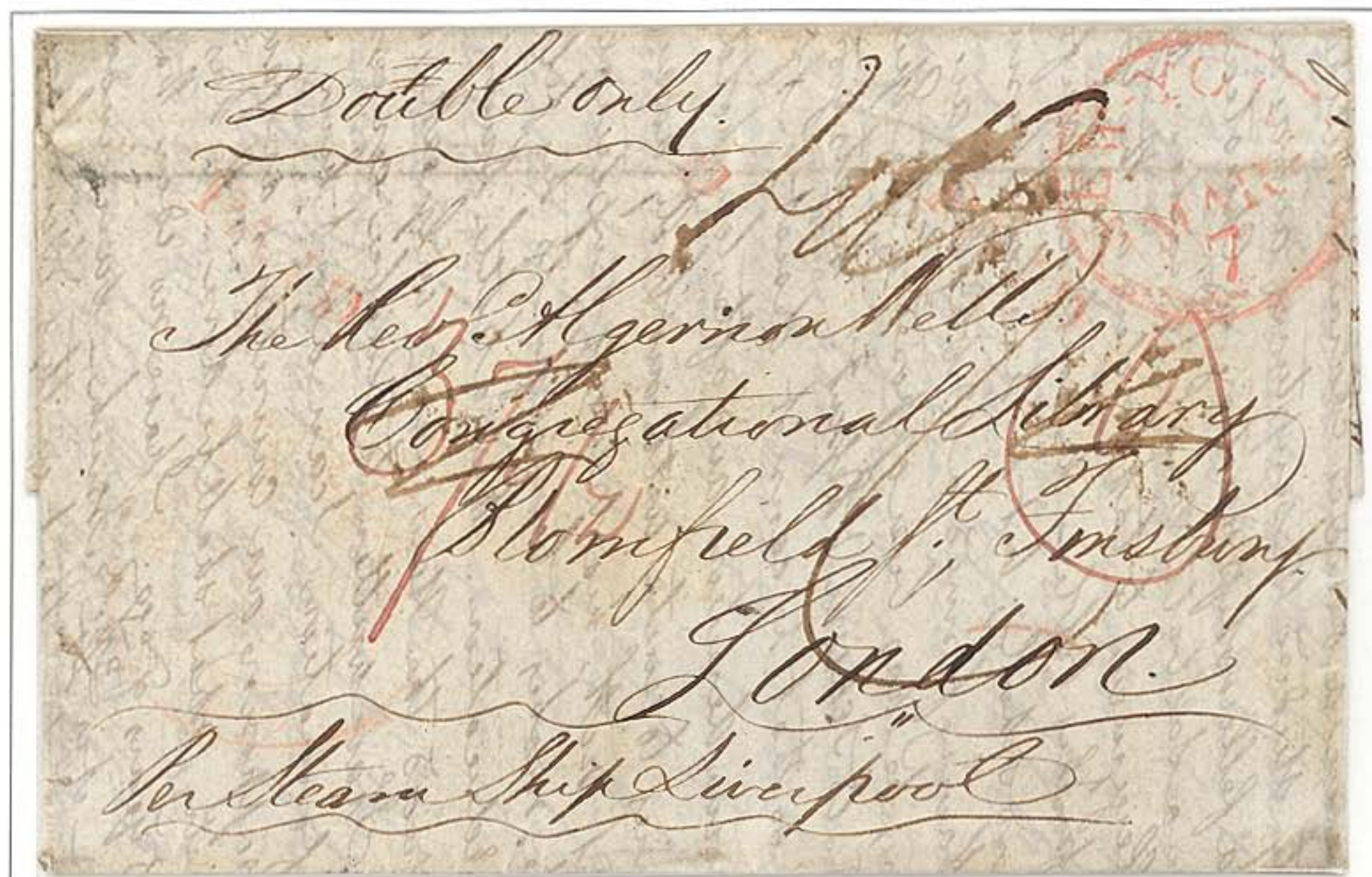
Folded Letter: Montreal, Lower Canada to London, 27 February 1839