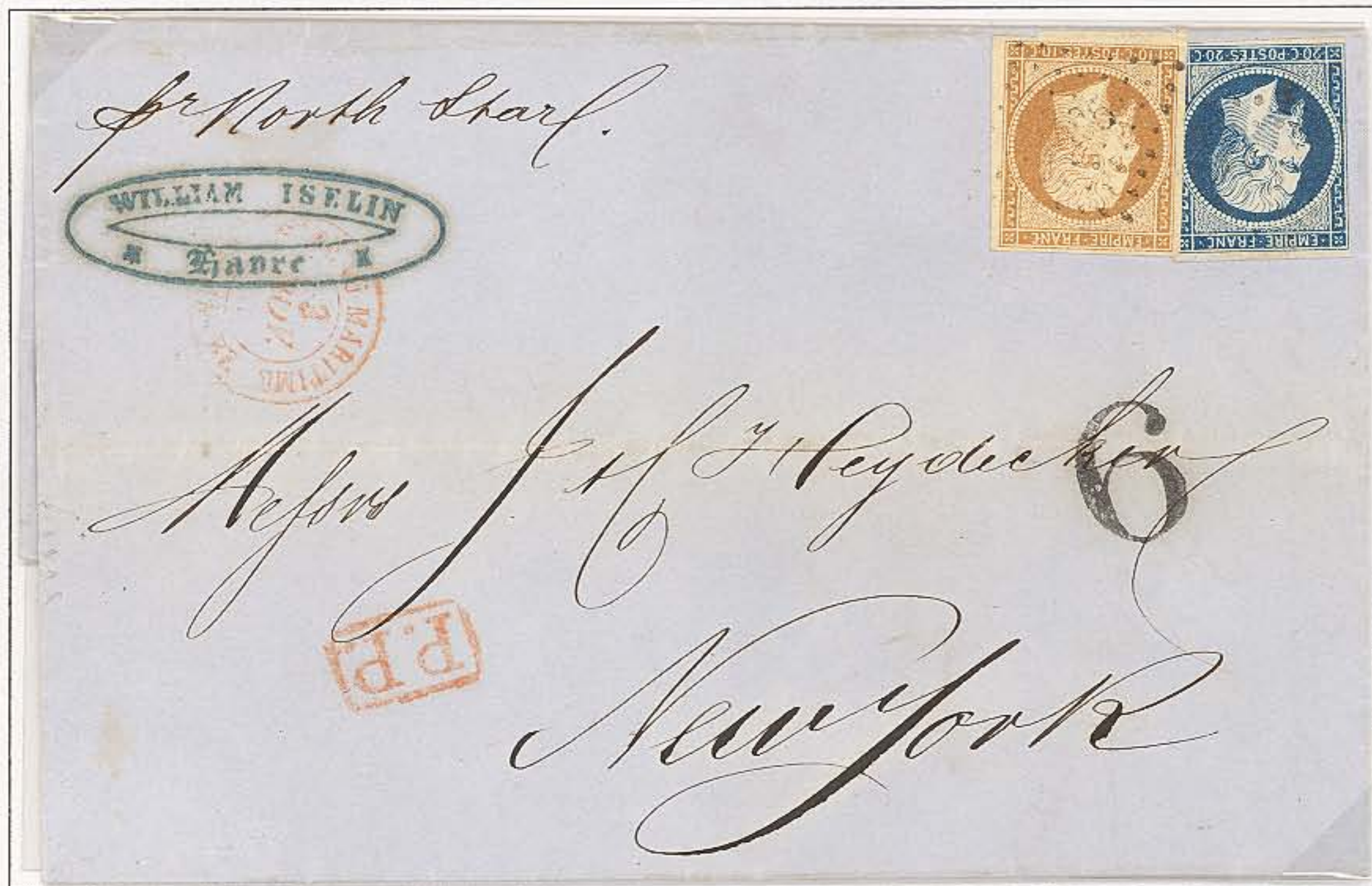
Folded Letter: Havre to New York, 2 November 1855