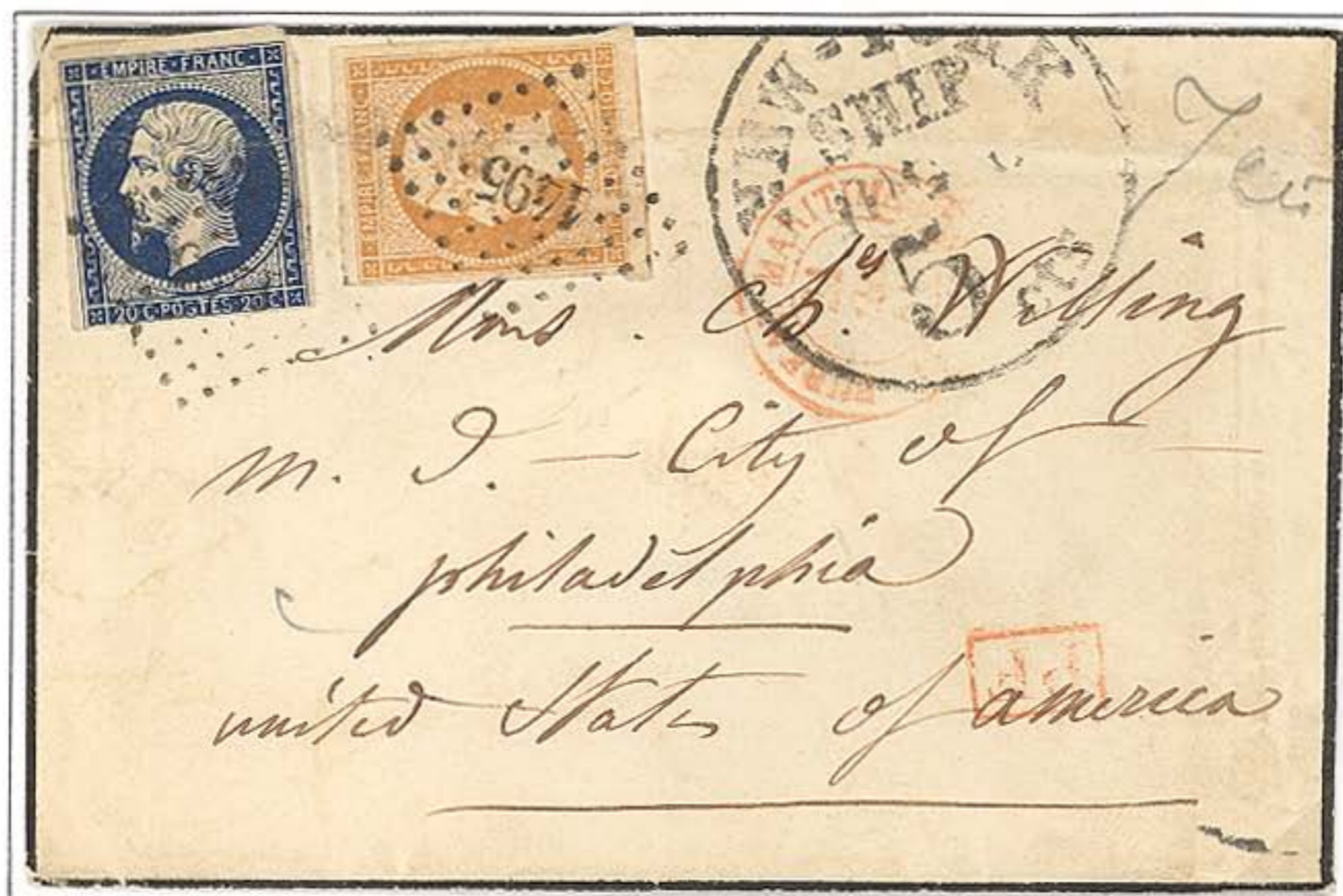
Envelope: Havre to Philadelphia, 21 July 1856