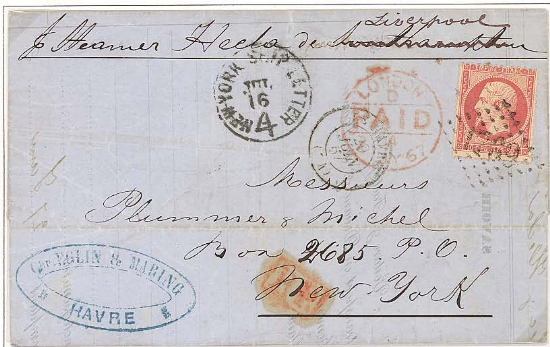
Folded Letter: Havre to New York, 29 June 1867

Ship: Hecla Company: British & North American Royal Mail Steam Packet Company (Cunard Line) Depart: Liverpool, 2 July 1867 Arrive: New York, 16 July 1867 Rate: 80 centimes prepaid for ship letter rate via G.B. 4¢ postage due in New York Notes: Because letter was endorsed for a non-contract steamship, the Cunard merchant steamship Hecla from Liverpool, it was not bagged in France for regular contract French mails, but sent to London in the open mails. New York marked letter for 4¢ postage due, the incoming ship letter rate to the port. Had letter not been endorsed for a non-contract steamship, the prepayment (80 centime 1862 adhesive, Scott No. 28) would have been sufficient to destination with no postage due.