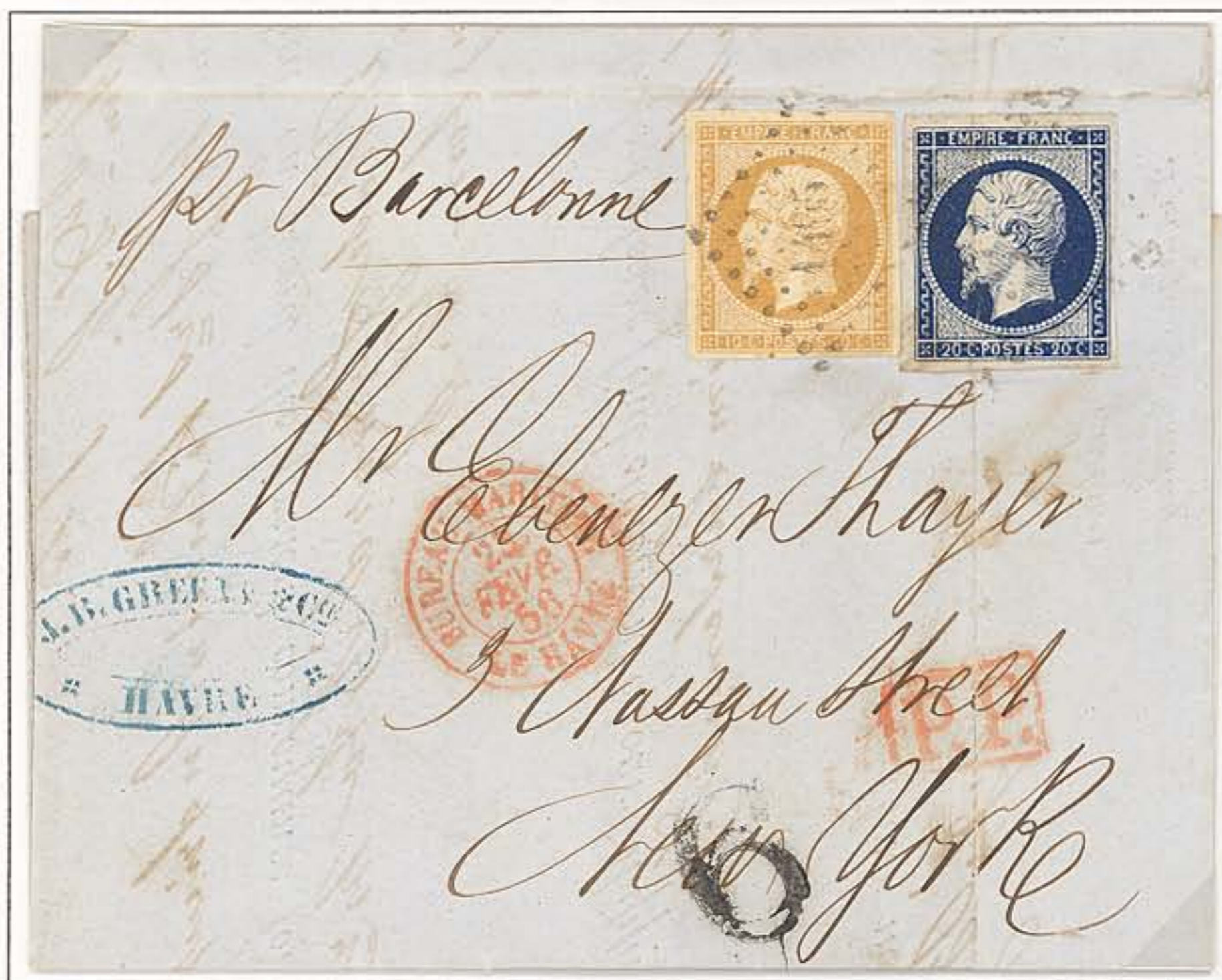
Folded Letter: Havre to New York, 23 February 1856