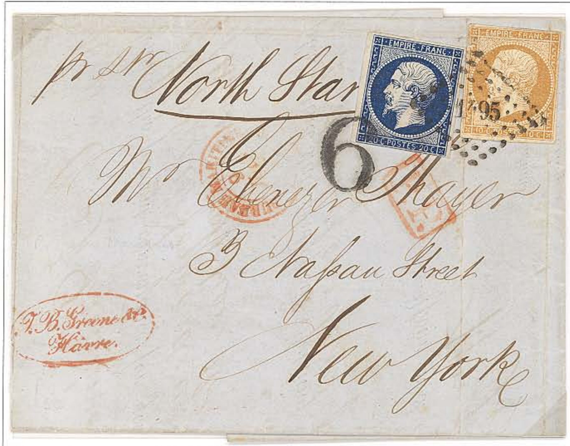
Folded Letter: Havre to New York, 9 June 1856