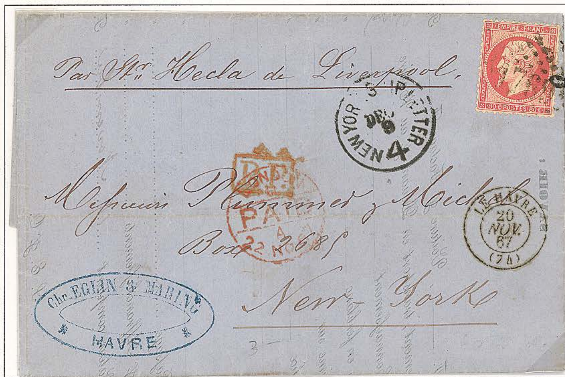
Folded Letter: Havre to New York, 20 November 1867