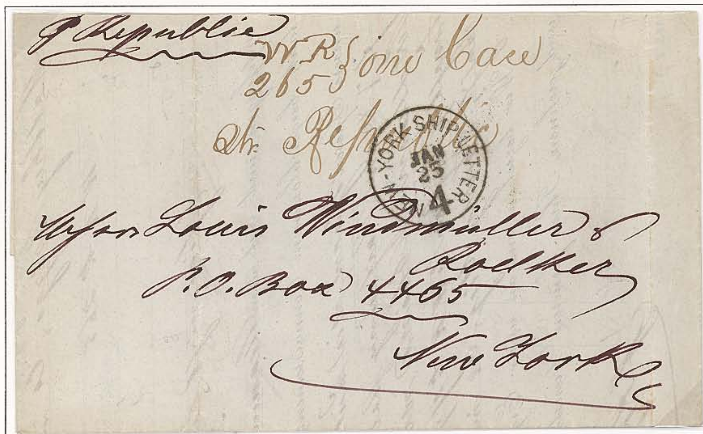
Folded Letter: Havre to New York, 10 January 1876