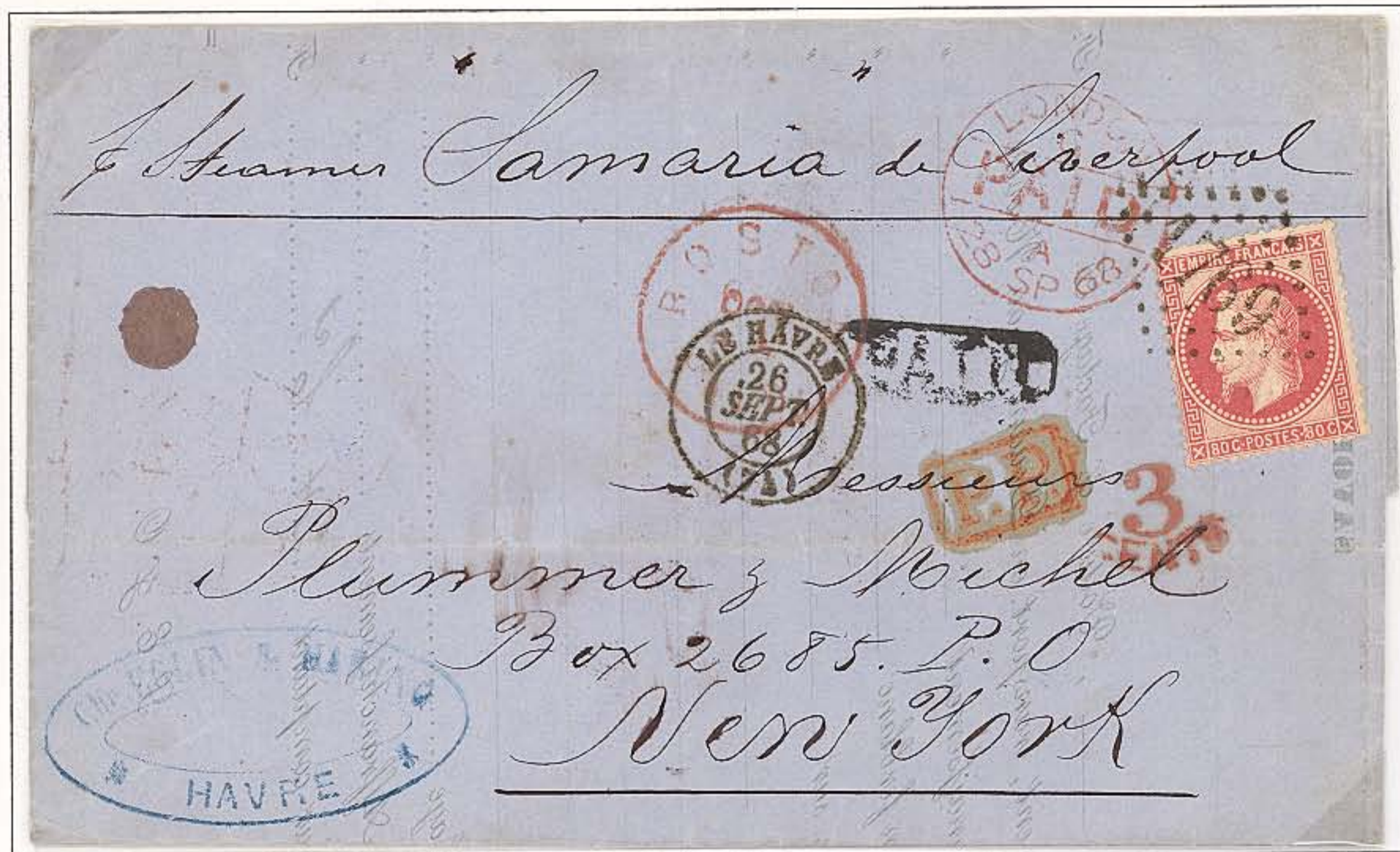
Folded Letter: Havre to New York, 25 September 1868