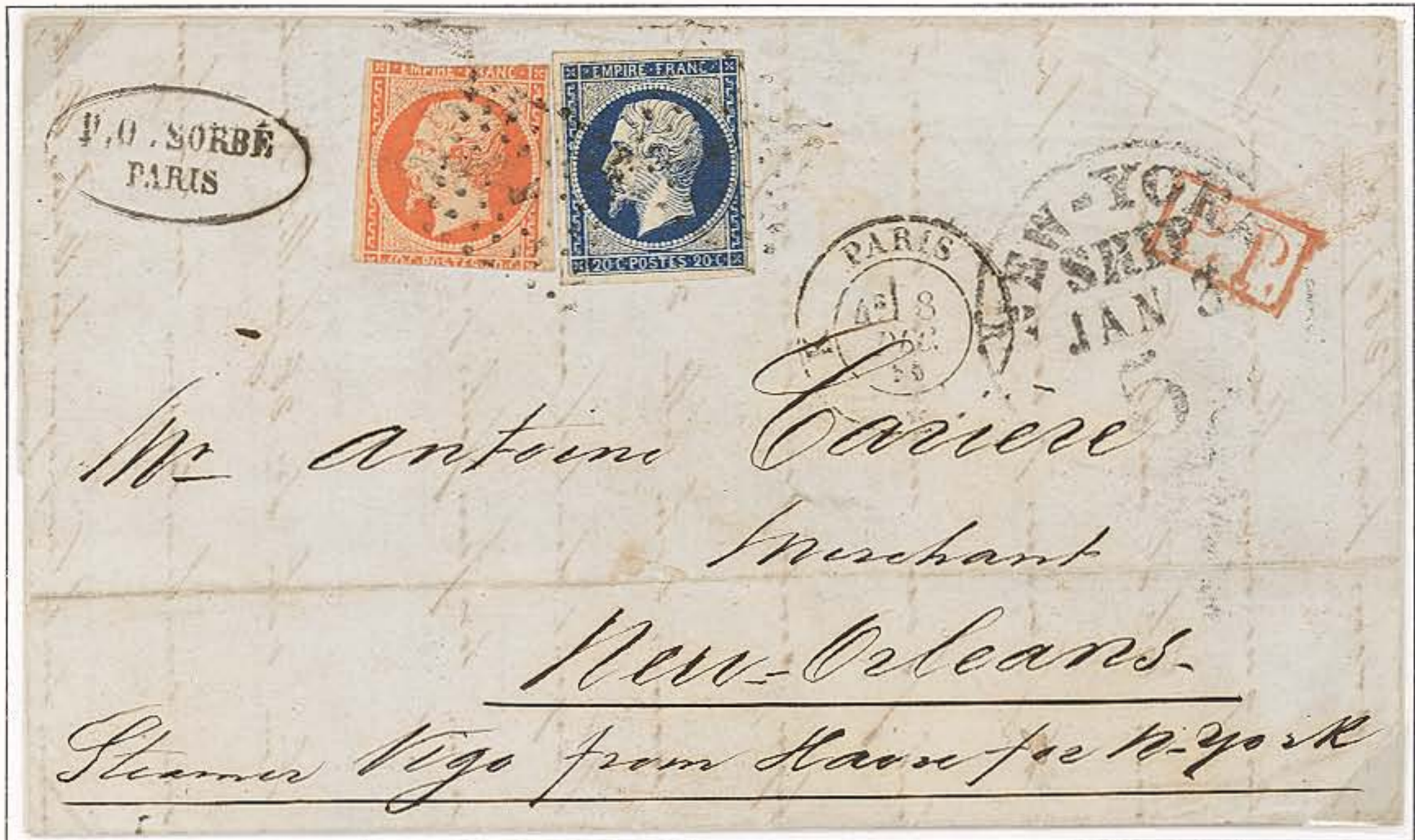
Folded Letter: Paris to New Orleans, 8 December 1856