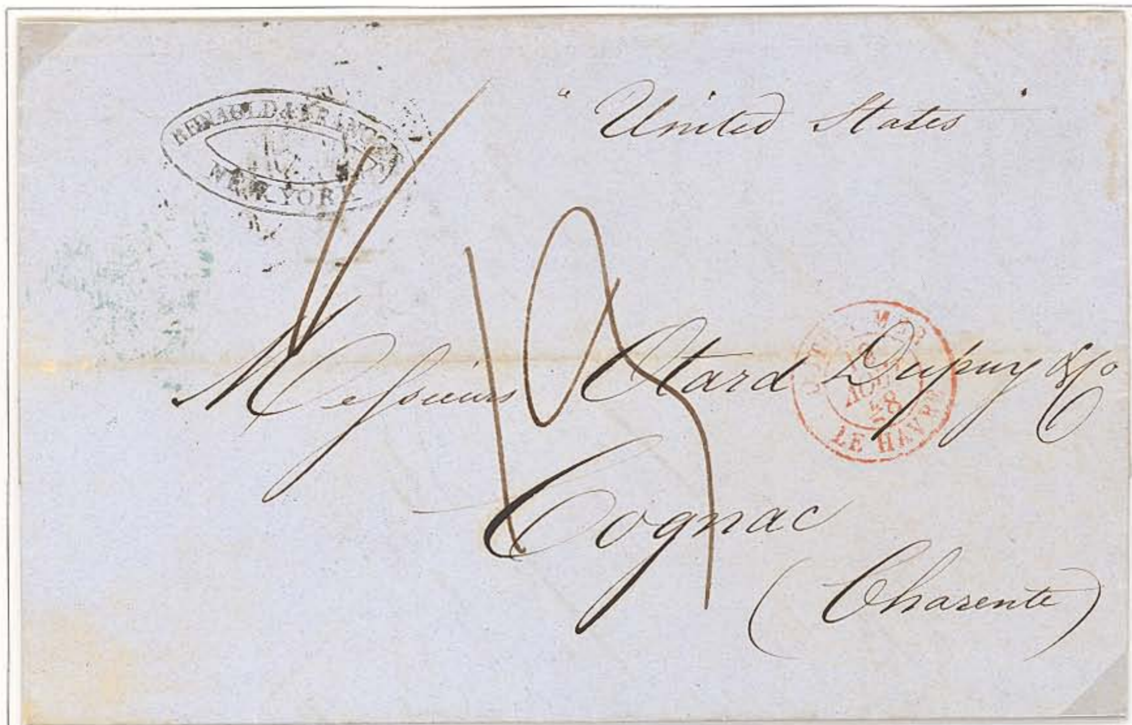
Folded Letter: New York to Cognac, France, 5 August 1848