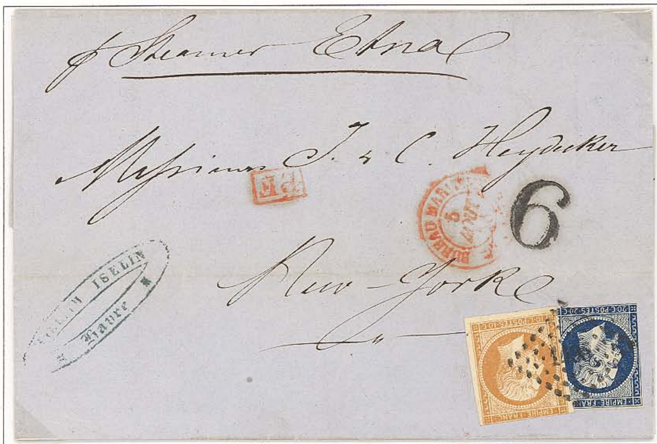
Folded Letter: Havre to New York, 5 August 1856