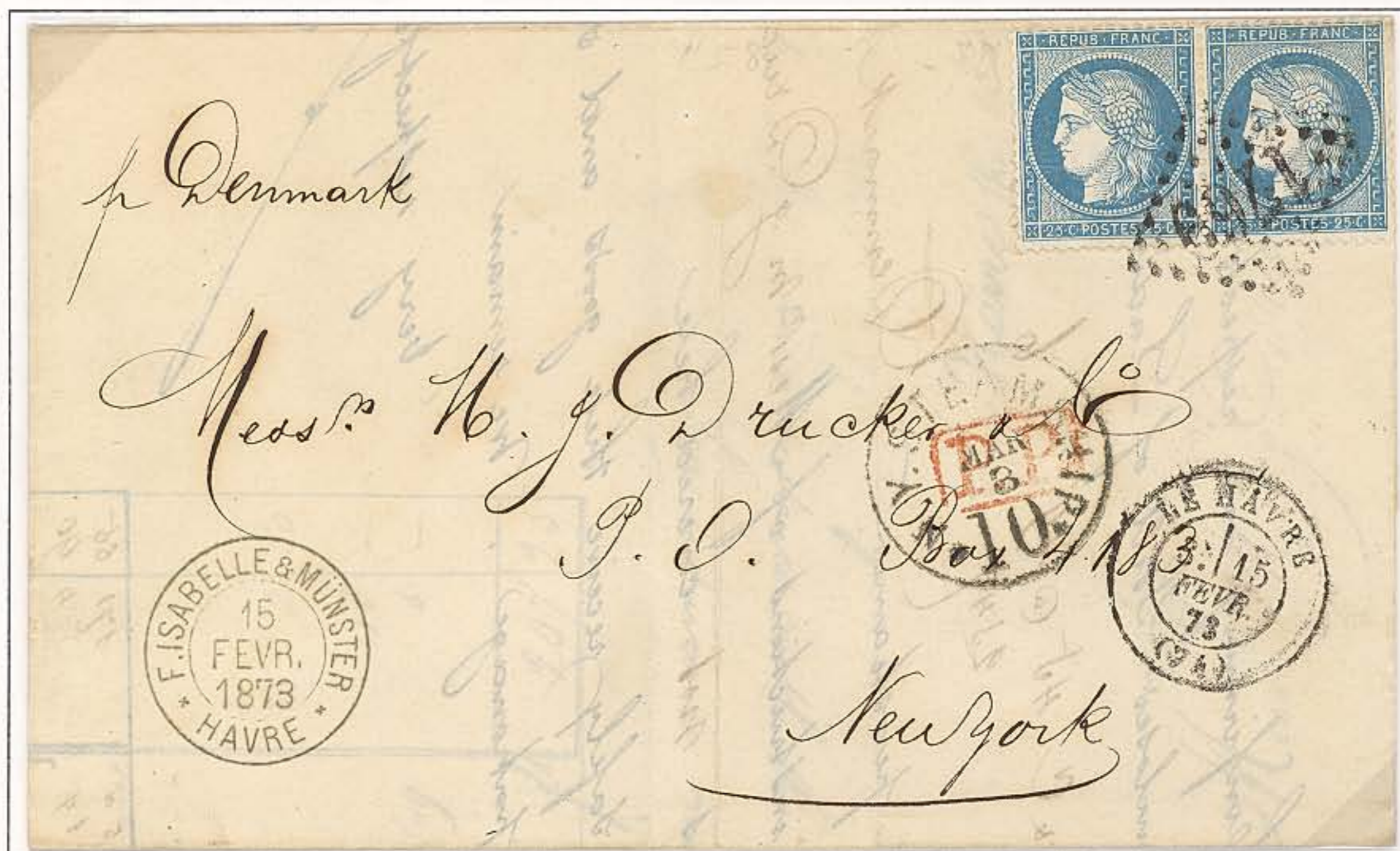
Folded Letter: Havre to New York, 15 February 1873