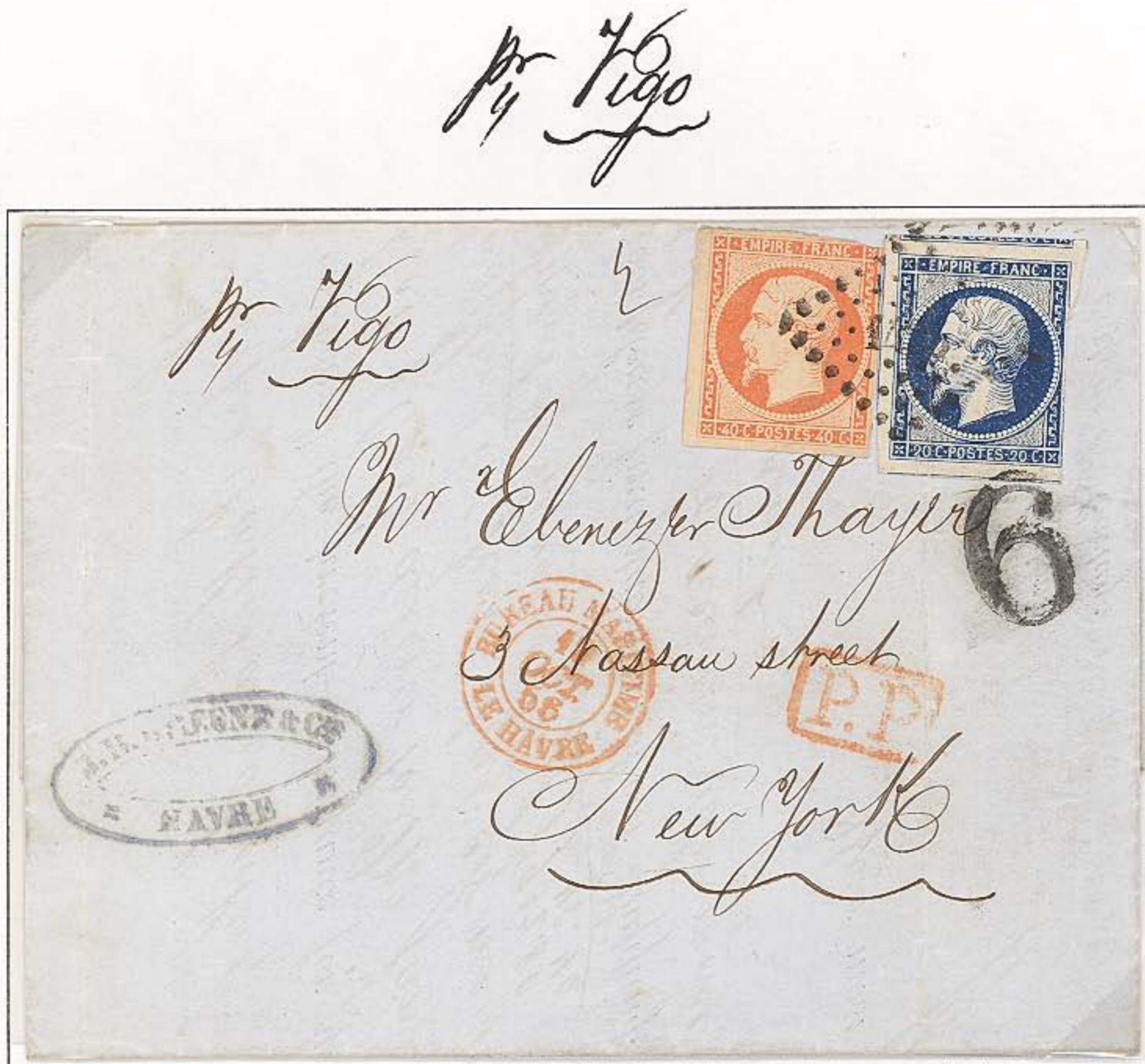
Folded Letter: Havre to New York, 19 October 1856