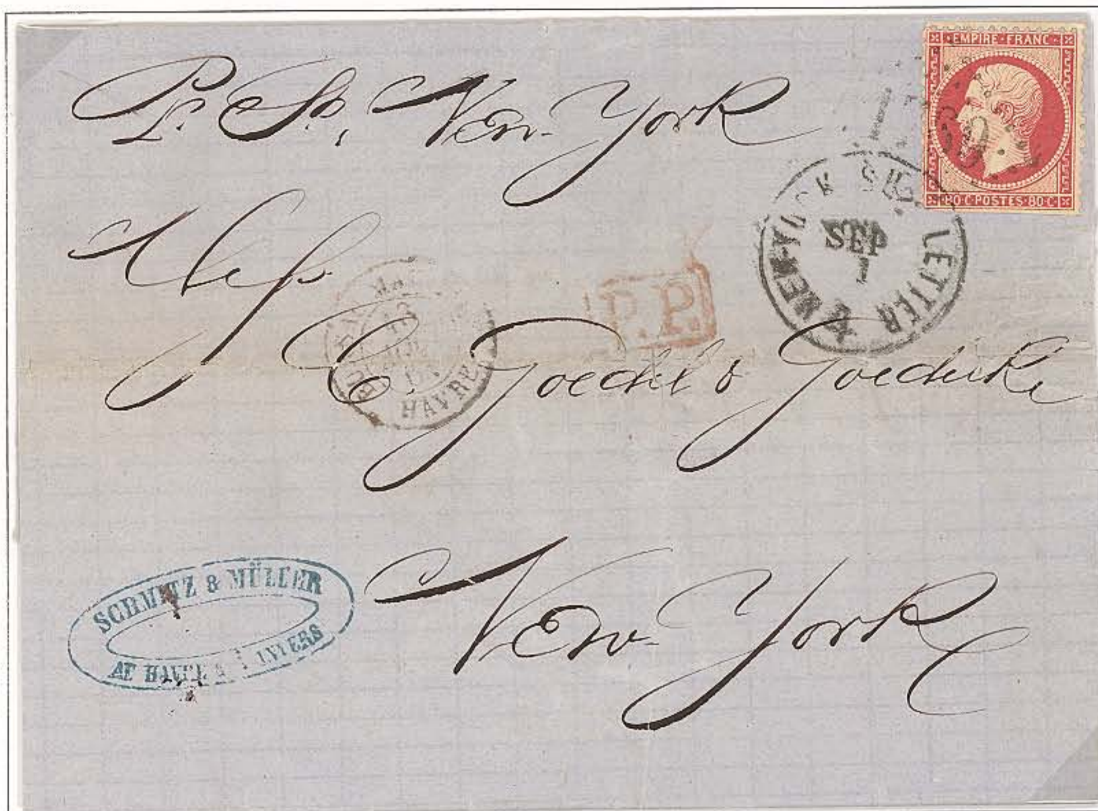
Folded Letter: Havre to New York, 18 August 1863