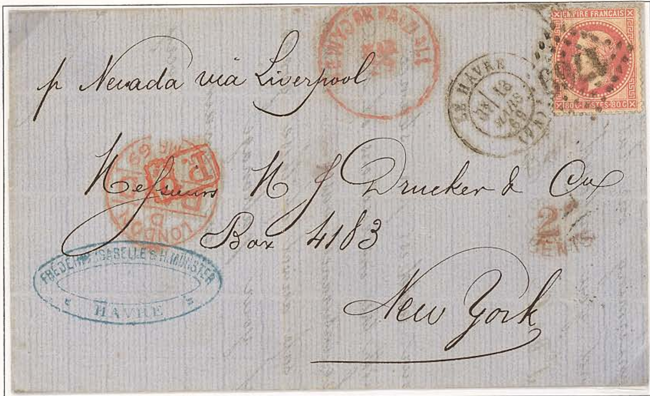
Folded Letter: Havre to New York, 13 March 1869