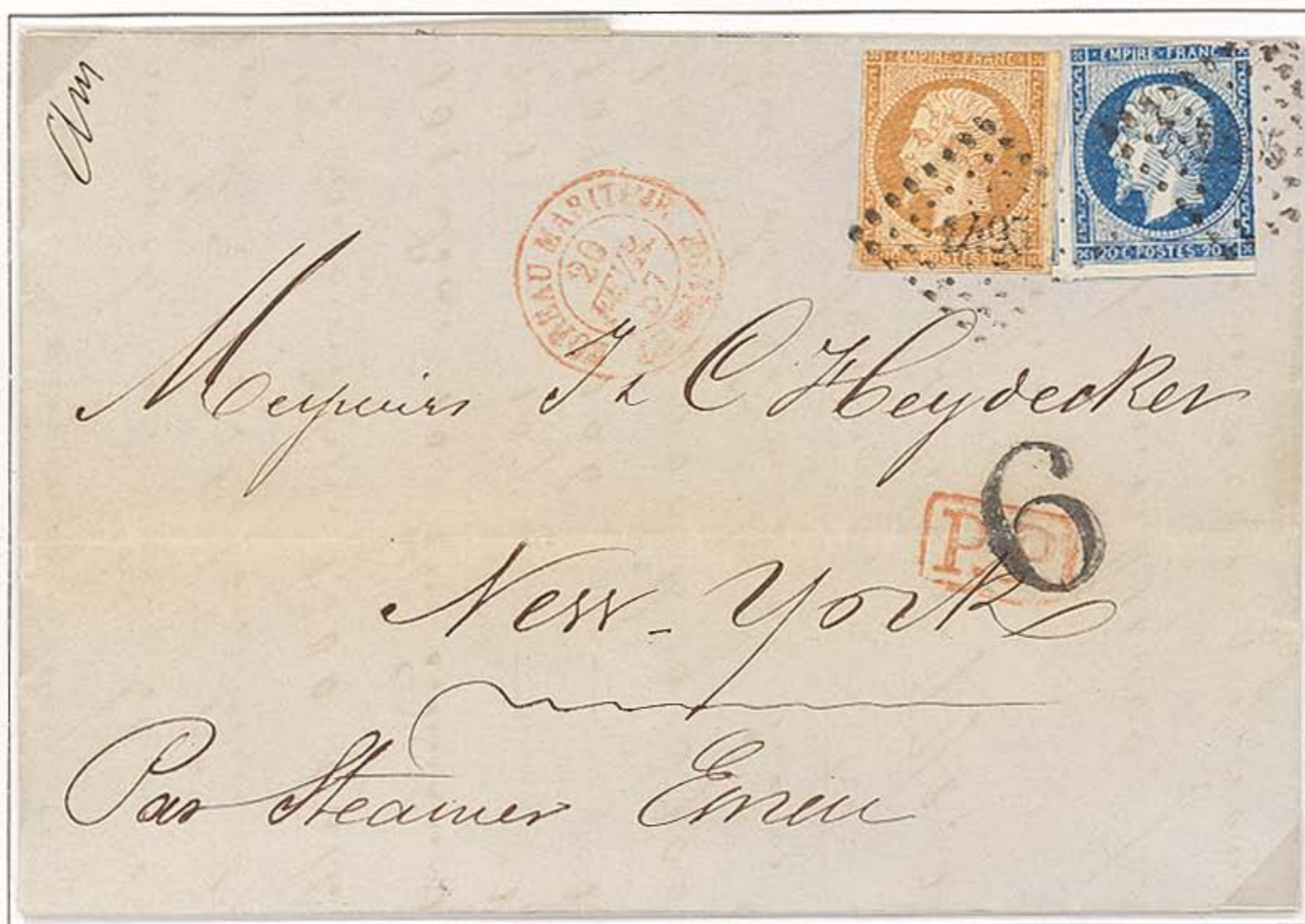
Folded Letter: Havre to New York, 20 February 1857