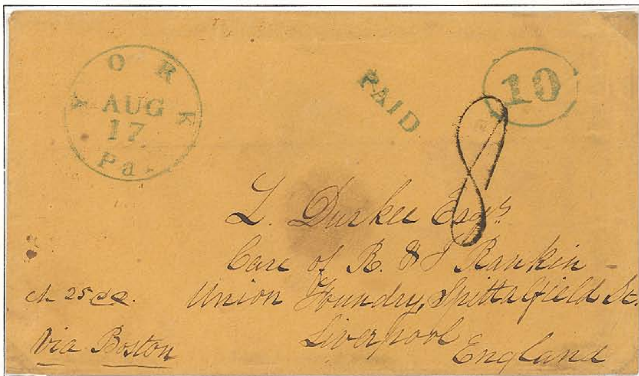
Envelope: York, Pennsylvania to Liverpool, 17 August 1848