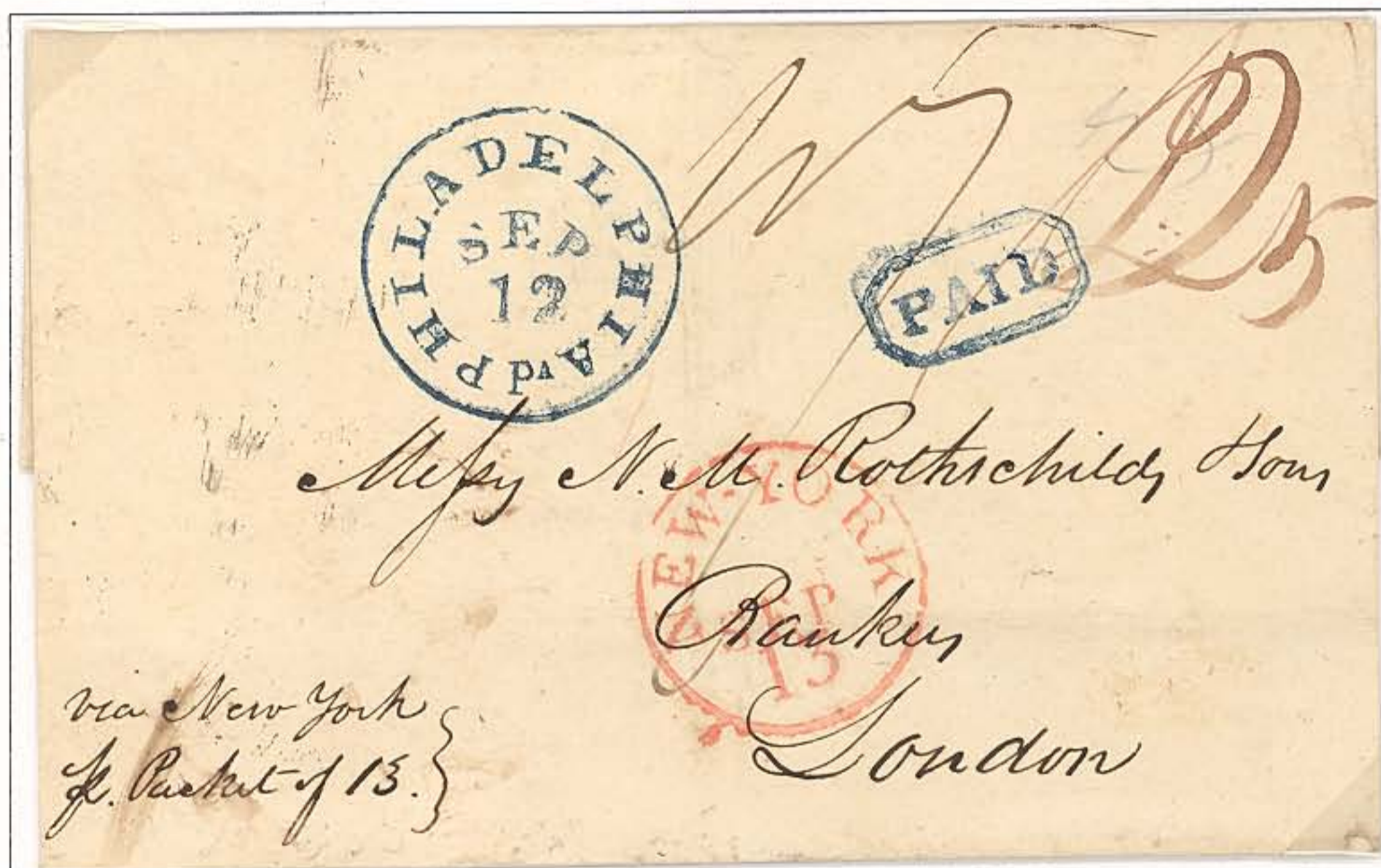
Folded Letter Outer Sheet: Philadelphia to London, 5 September 1838