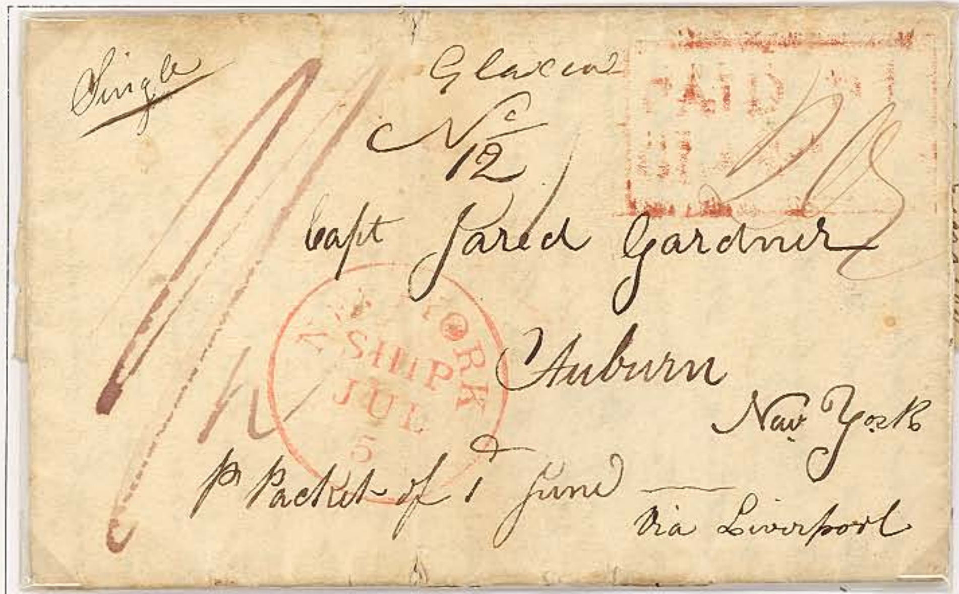
Folded Letter: Glasgow, Scotland to Auburn, New York, 22 May 1838

Ship: Oxford Company: Black Ball Line Depart: Liverpool, ~1 June 1838 Arrive: New York, 5 July 1838 Rate: 1s \frac{1}{2} d prepaid for single rate 20 \frac{3}{4} ¢ postage due at Auburn