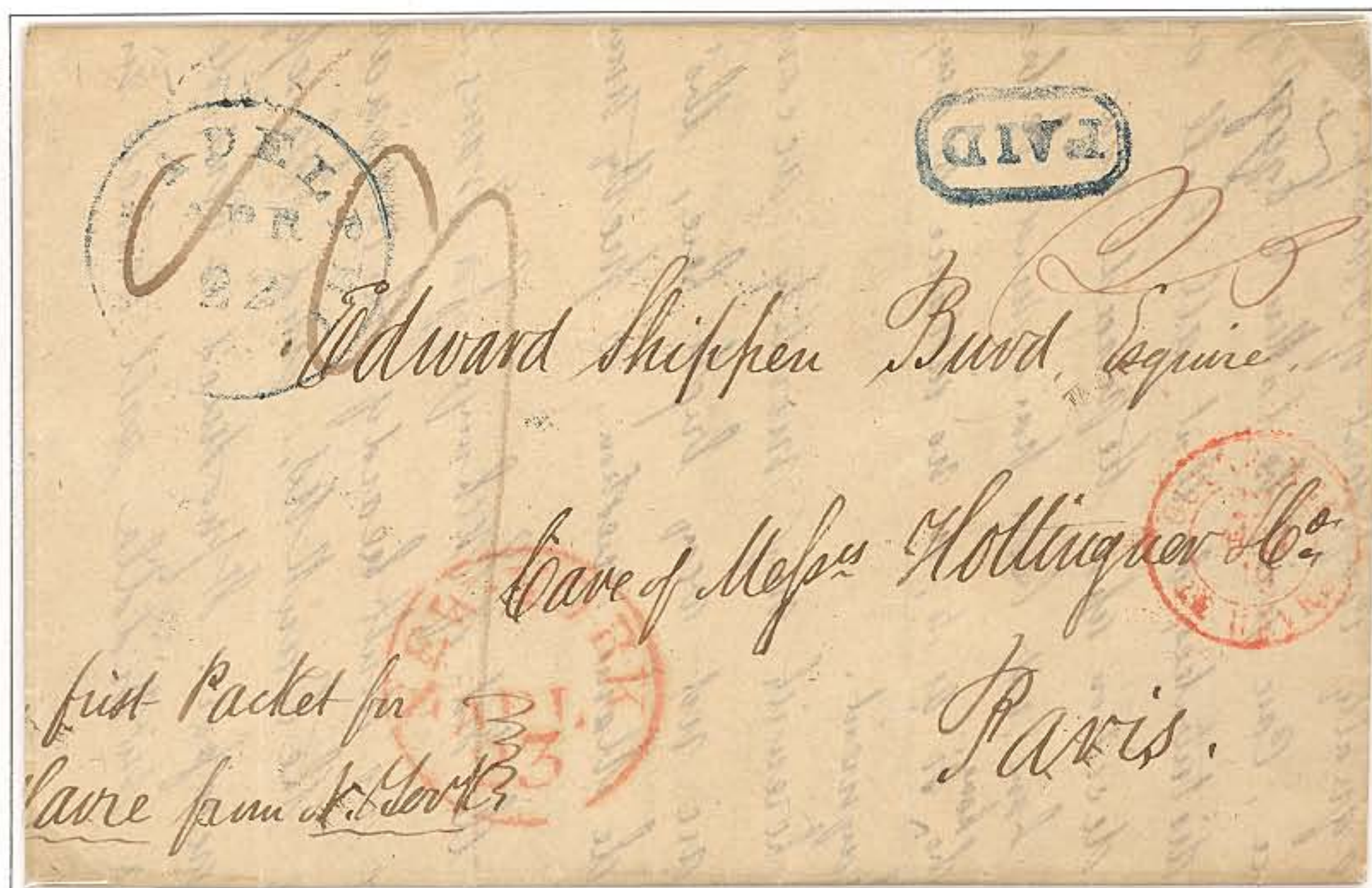
Folded Letter: Philadelphia to Paris, 21 April 1839