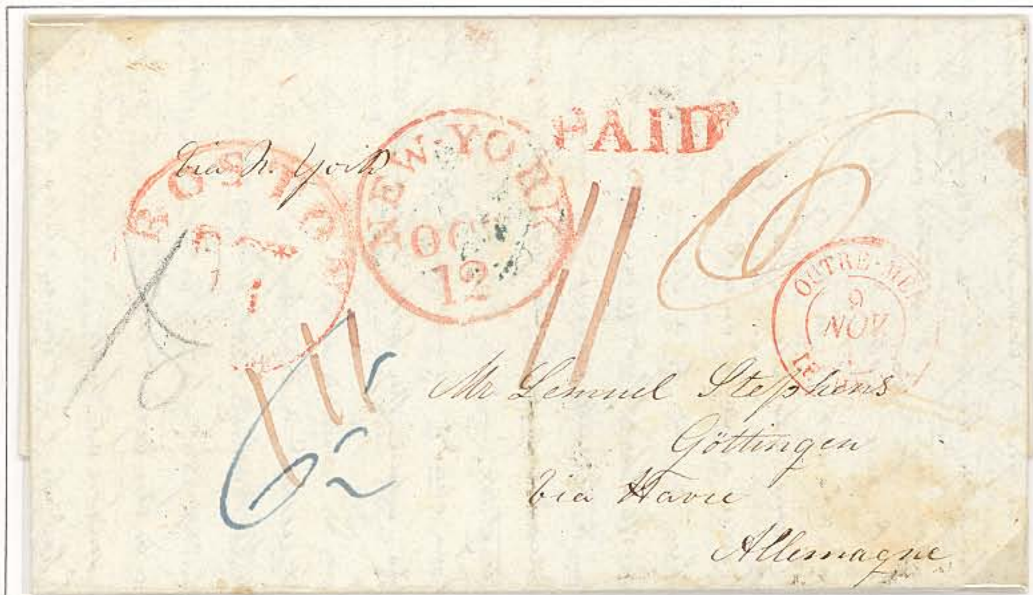
Folded Letter: Dorchester, Massachusetts to Göttingen, Hannover, 8 October 1841