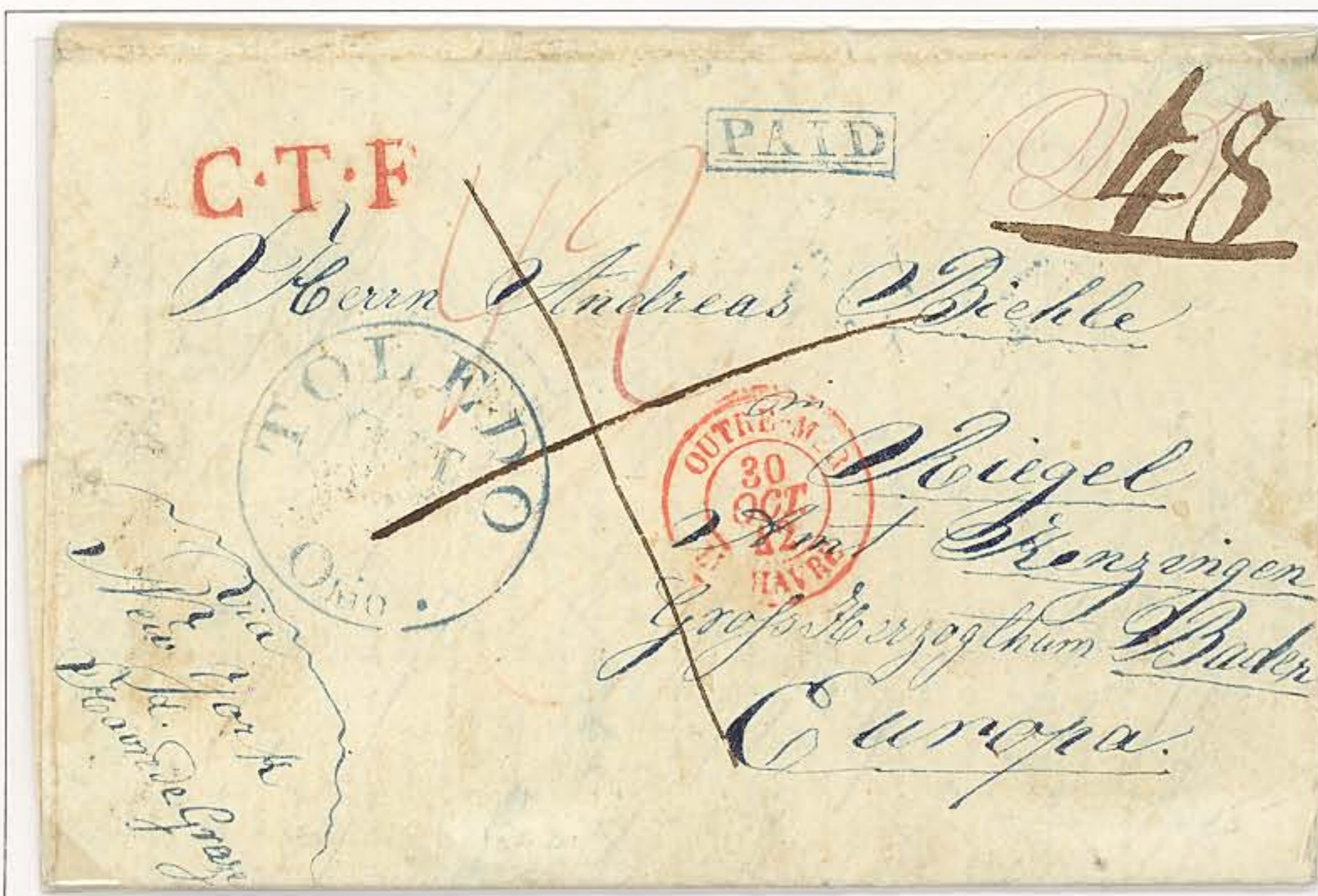
Folded Letter: Toledo, Ohio to Riegel, Baden, 1 October 1842