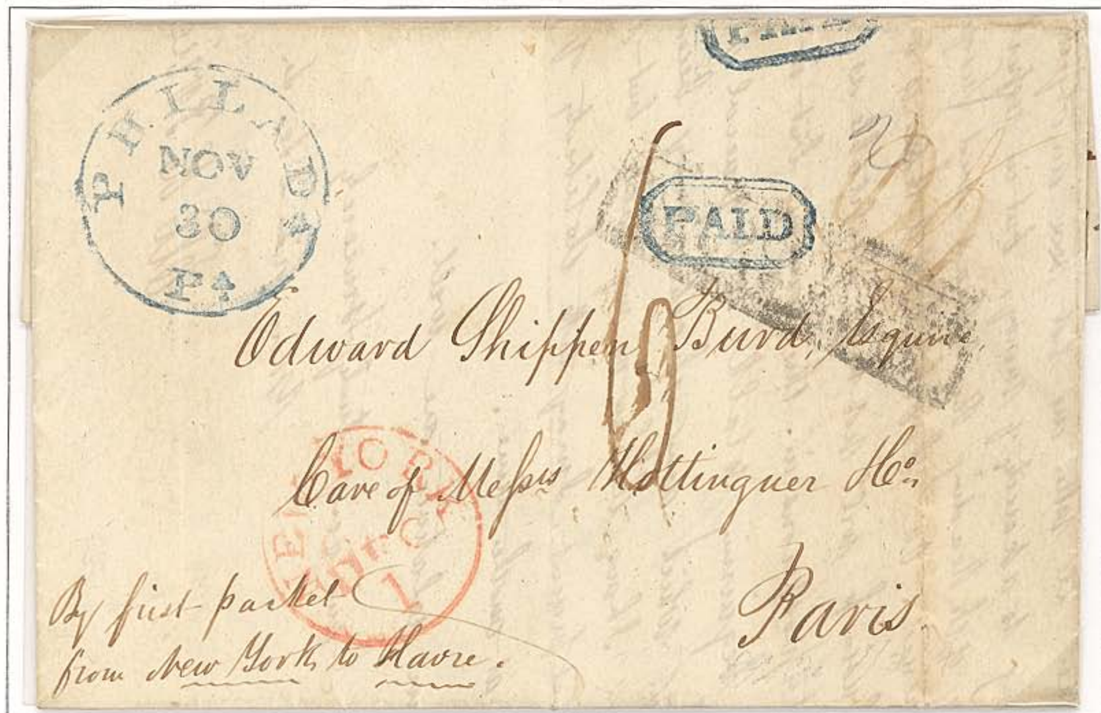
Folded Letter: Philadelphia to Paris, 30 November 1838