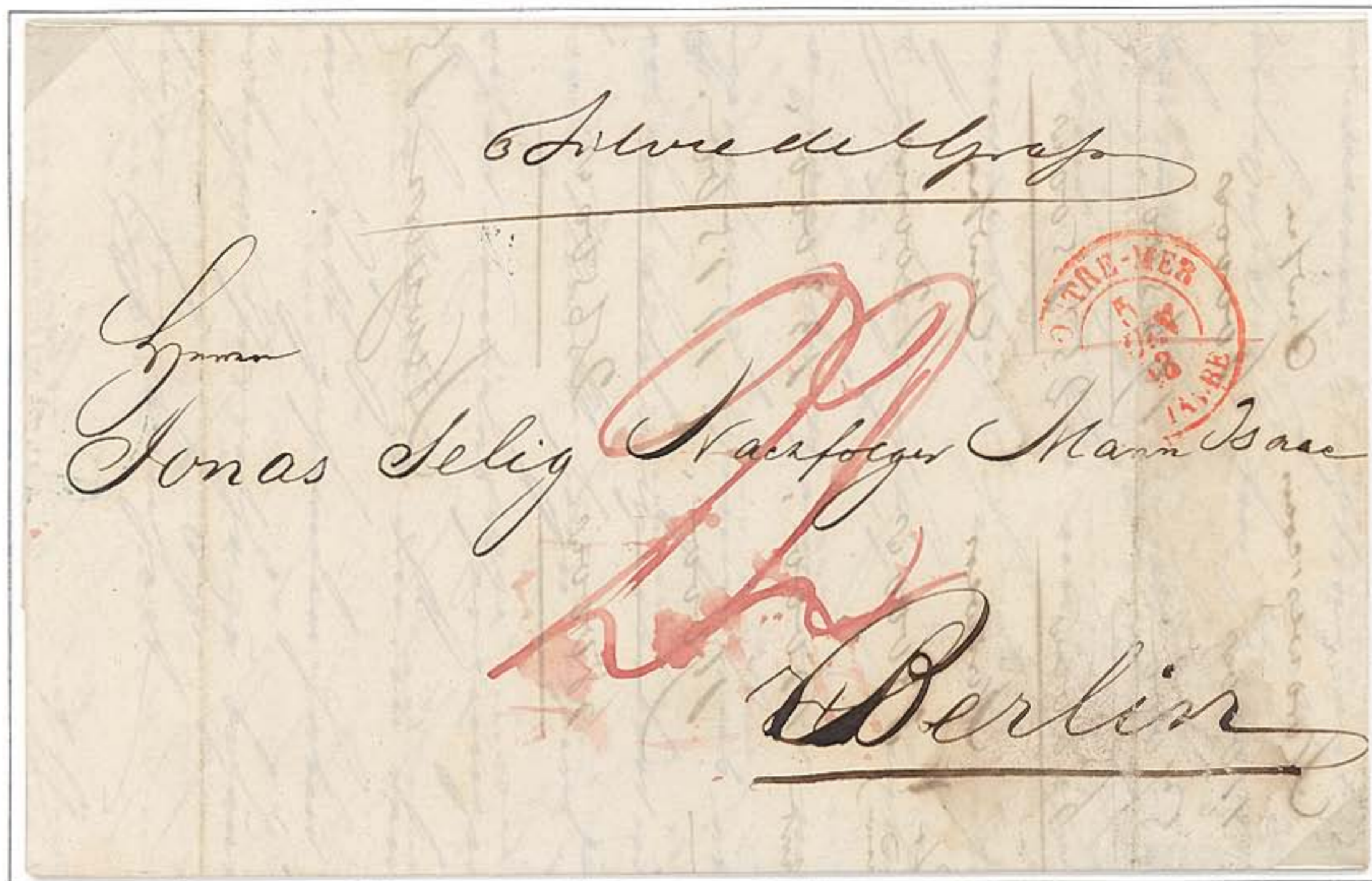
Folded Letter: New York to Berlin, Prussia, 15 May 1843