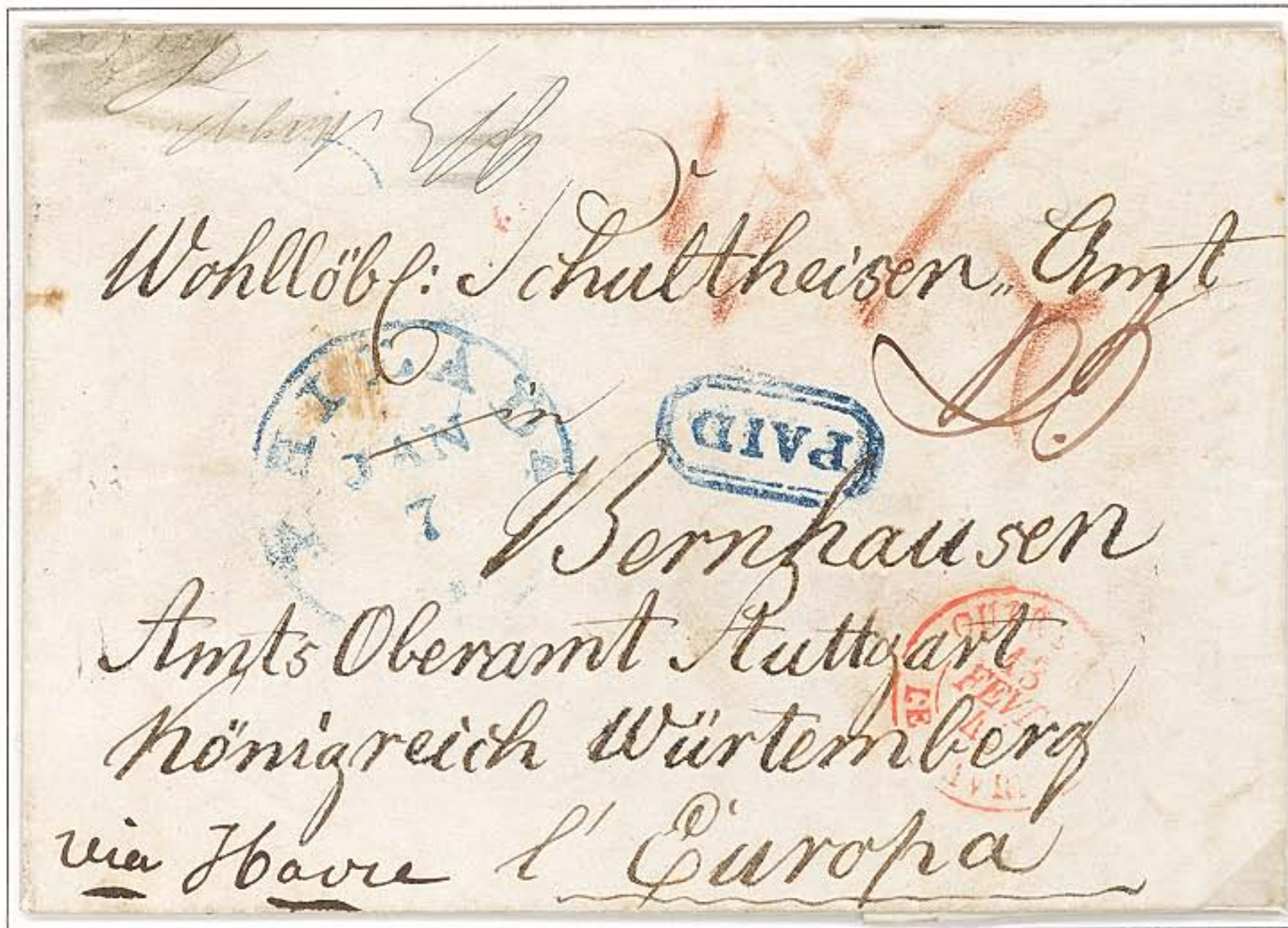
Folded Letter: Philadelphia to Bernhausen, Württemberg, 30 December 1840