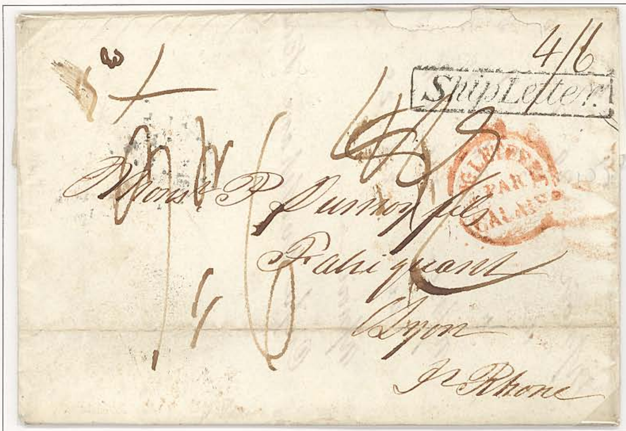
Folded Letter: New York to Lyon, 16 May 1838