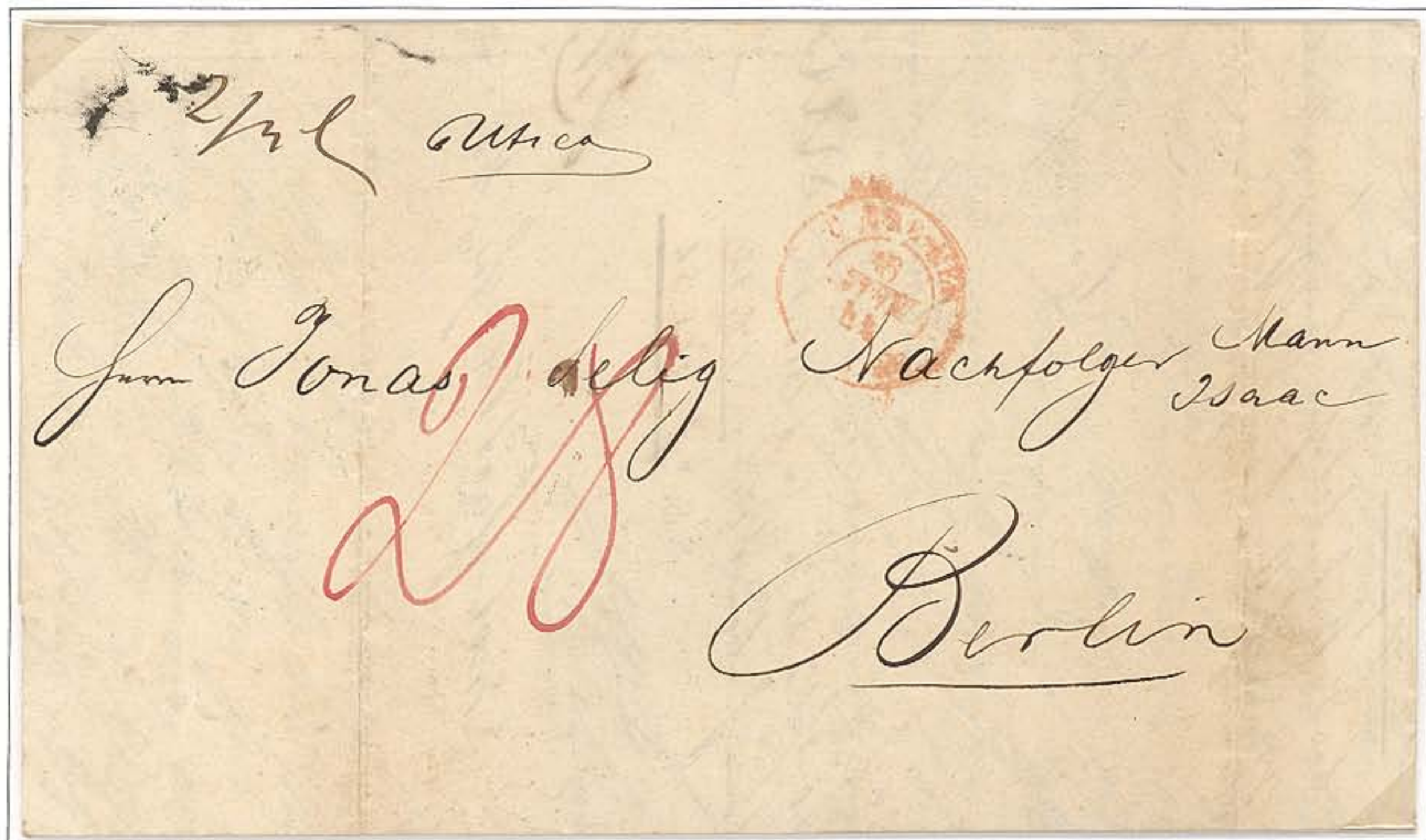
Folded Letter: New York to Berlin, Prussia, 2 May 1844