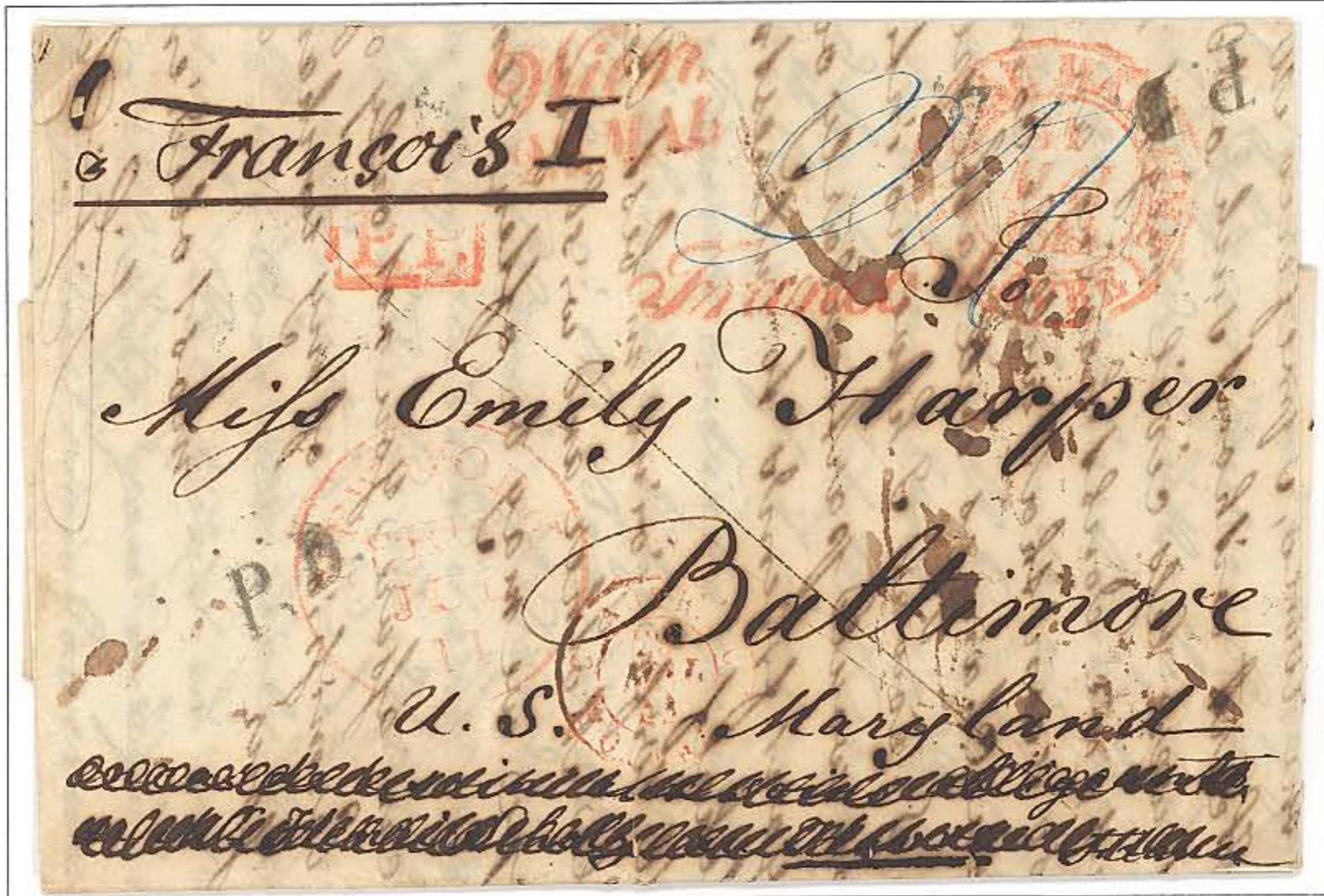
Folded Letter: Vienna, Austria, to Baltimore via Havre, 19 May 1844