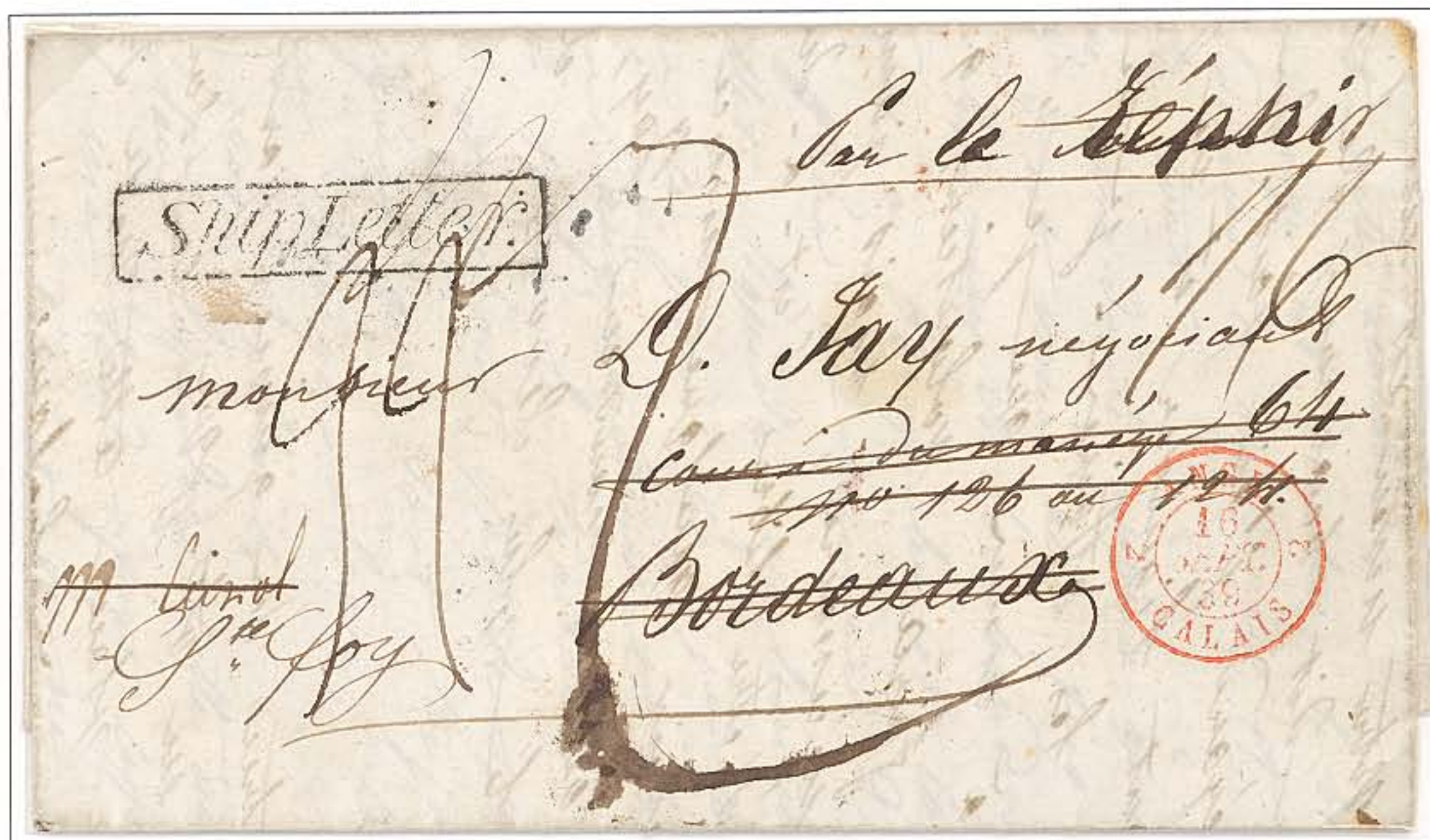
Folded Letter: St. Louis, Missouri to Bordeaux, 2 August 1839