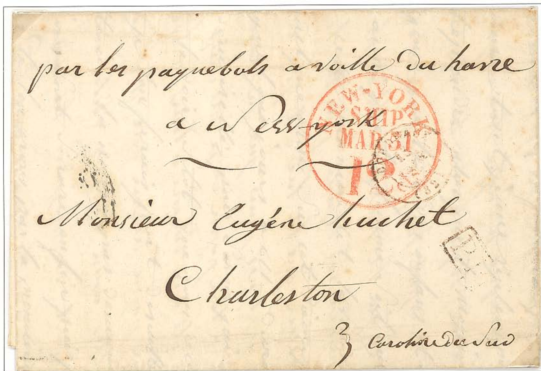
Folded Letter: Bordeaux, France, to Charleston, South Carolina, 13 February 1848