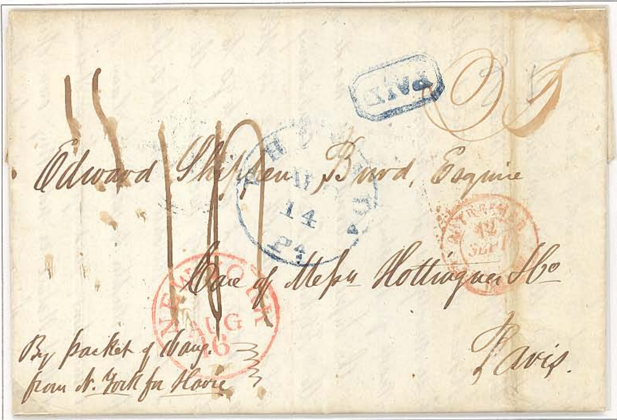
Folded Letter: Philadelphia to Paris, 12 August 1839

Ship: Ville de Lyon Company: Union Line of Havre Packets Depart: New York, 16 August 1839 Arrive: Havre, 12 September 1839 Rate: 25¢ prepaid for double rate 14 decimes postage due at Paris