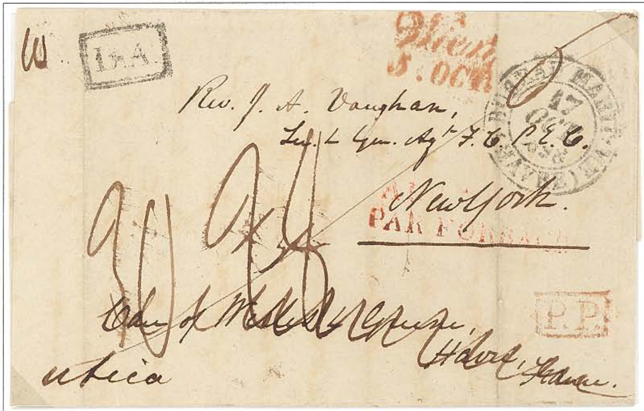
Folded Letter: Vienna, Austria, to New York via Havre, 4 October 1838