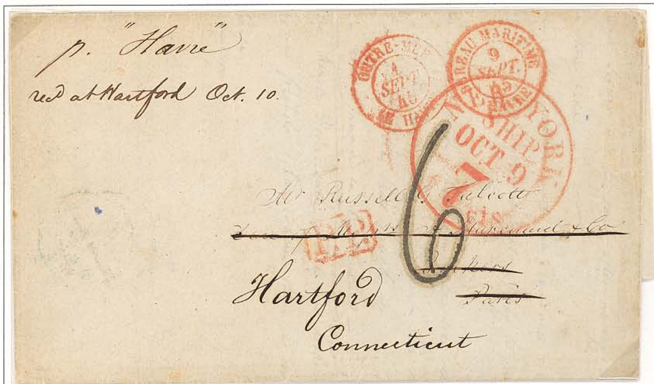
Folded Letter: Hartford, Connecticut to Paris, 6 August 1845