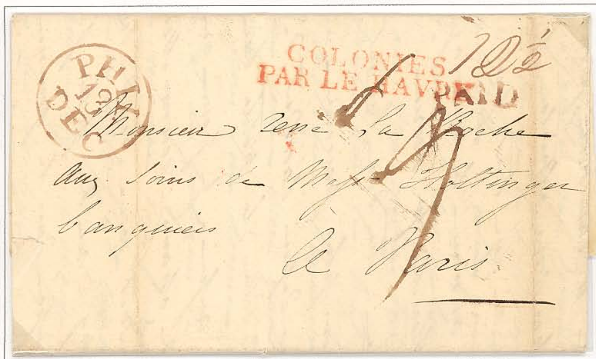
Folded Letter: Philadelphia to Paris, 11 December 1827