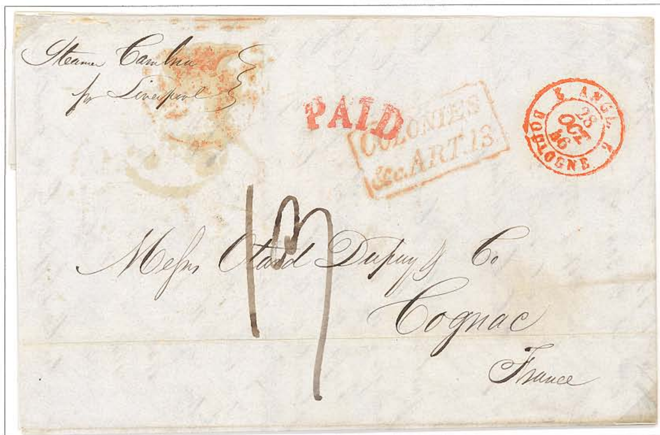
Folded Letter: New York to Cognac, France, 30 September 1846