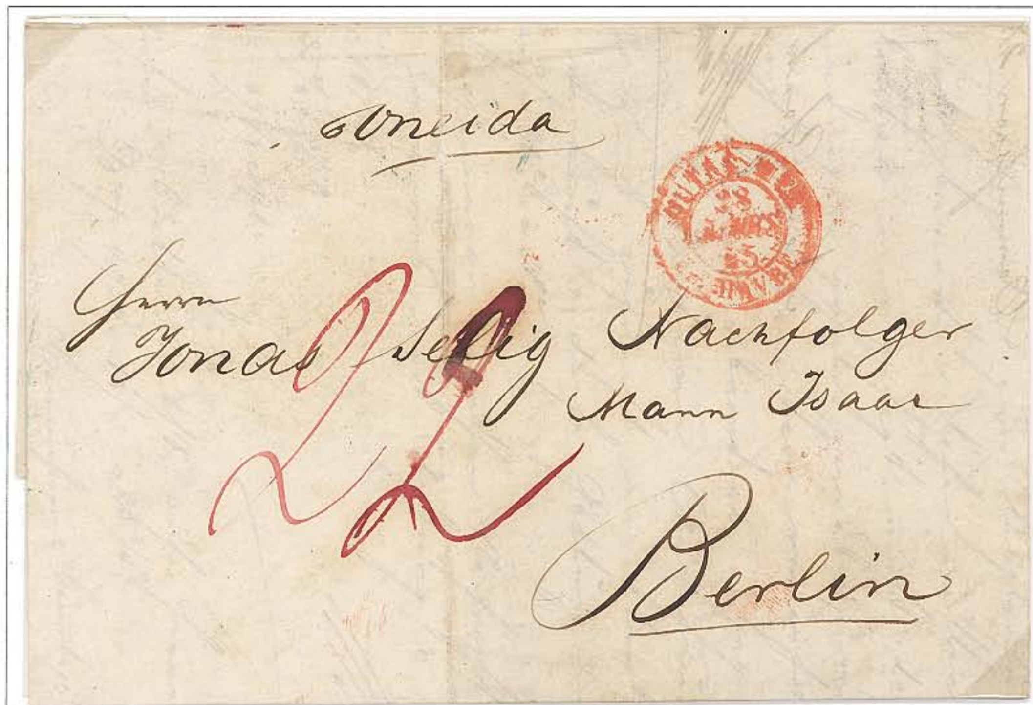
Folded Letter: New York to Berlin, Prussia, 28 February 1845