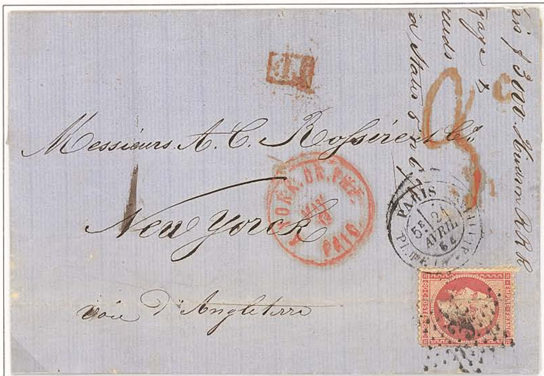
Folded Letter: Paris to New York, 20 April 1864

Ship: Scotia Company: British & North American Royal Mail Steam Packet Company (Cunard Line) Depart: Queenstown, 24 April 1864 Arrive: New York, 3 May 1864 Rate: 80 centimes prepaid for single treaty rate 3¢ French credit to U.S.