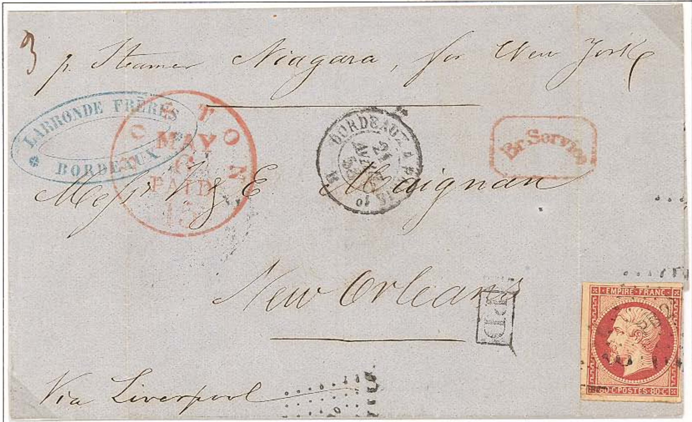
Folded Letter Outer Sheet: Bordeaux to New Orleans, 21 April 1858