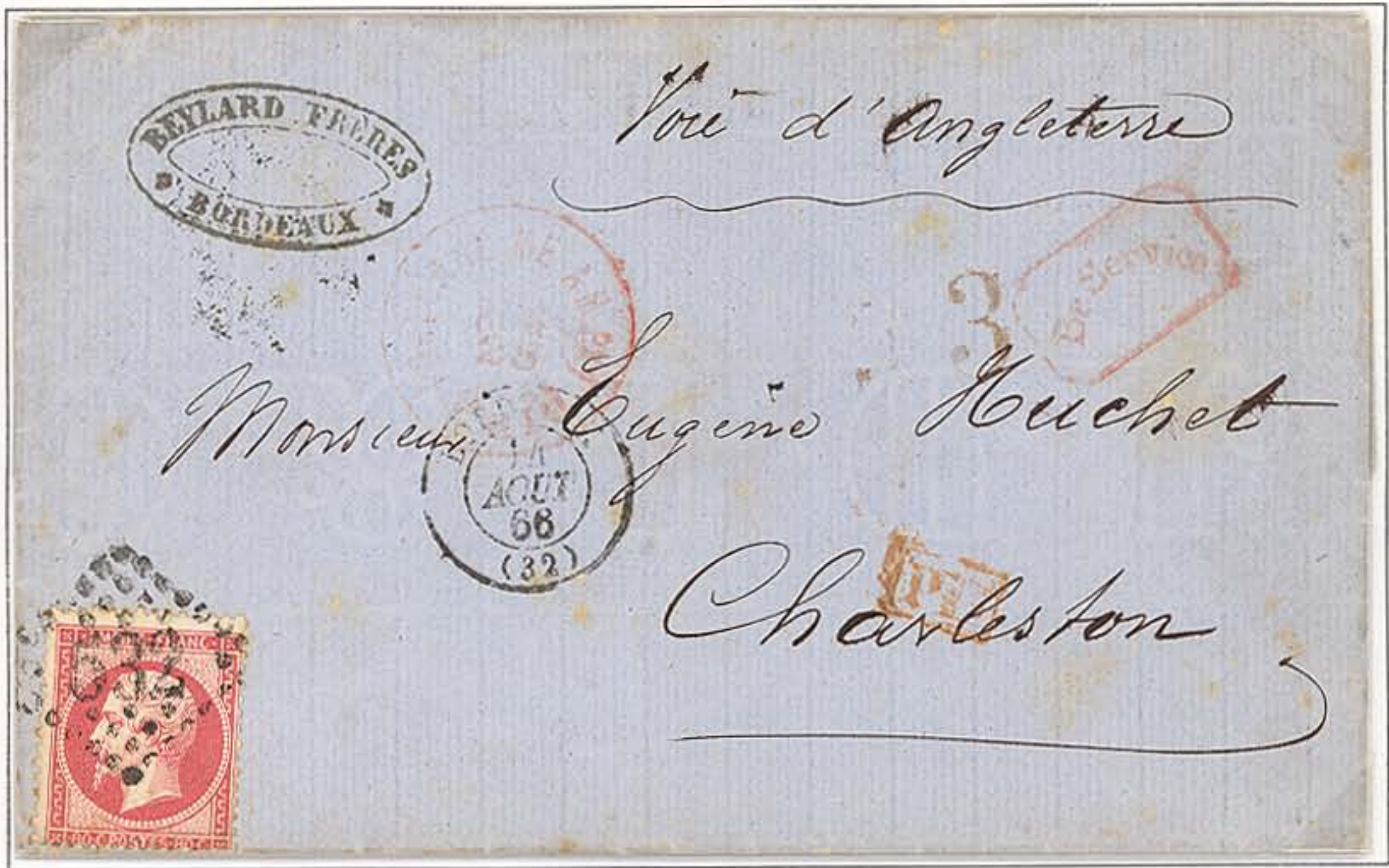
Folded Letter: Bordeaux to Charleston, South Carolina, 14 August 1866