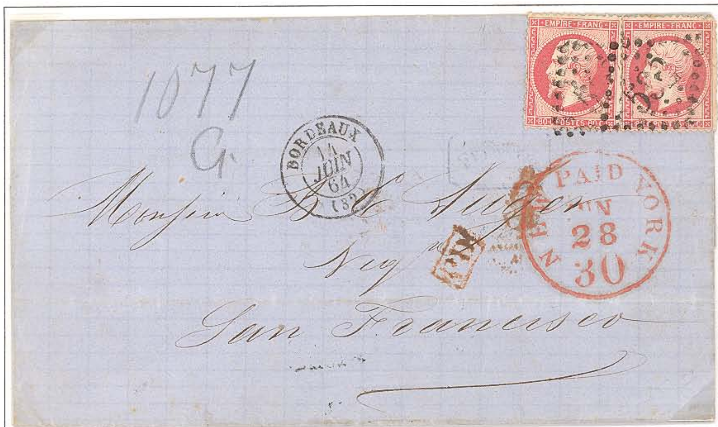
Folded Letter Outer Sheet: Bordeaux to San Francisco, 14 June 1864