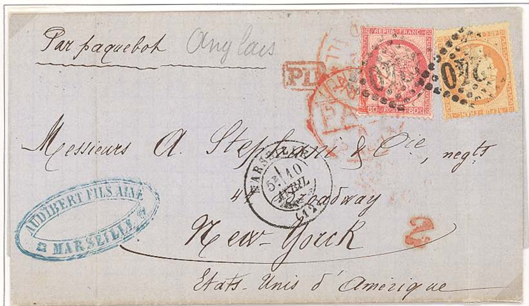
Folded Letter: Marseille to New York, 10 April 1873

Ship: Cuba Company: British & North American Royal Mail Steam Packet Company (Cunard Line) Depart: Queenstown, 13 April 1873 Arrive: New York, 22 April 1873 Rate: 120 centimes prepaid for open mail rate via G.B.