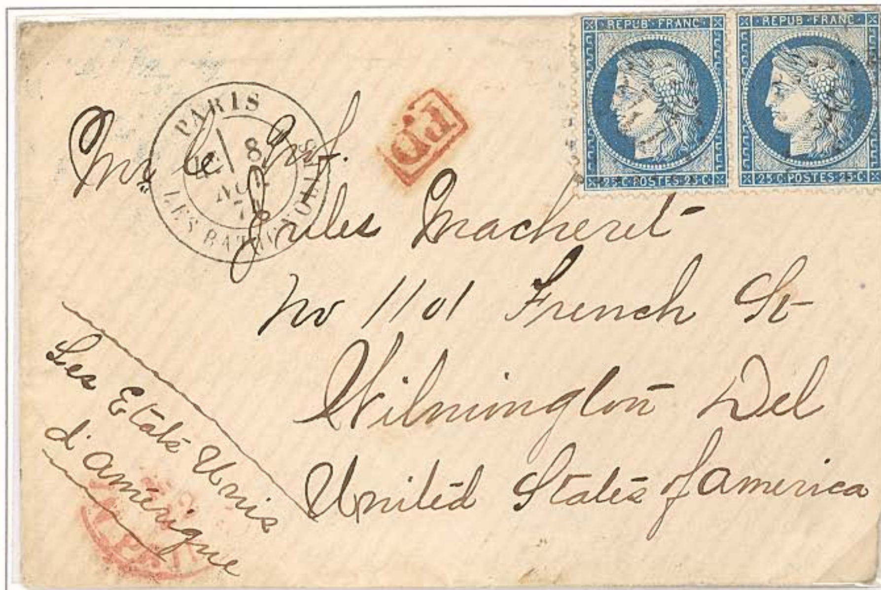
Envelope: Paris to Wilmington, Delaware, 8 November 1874