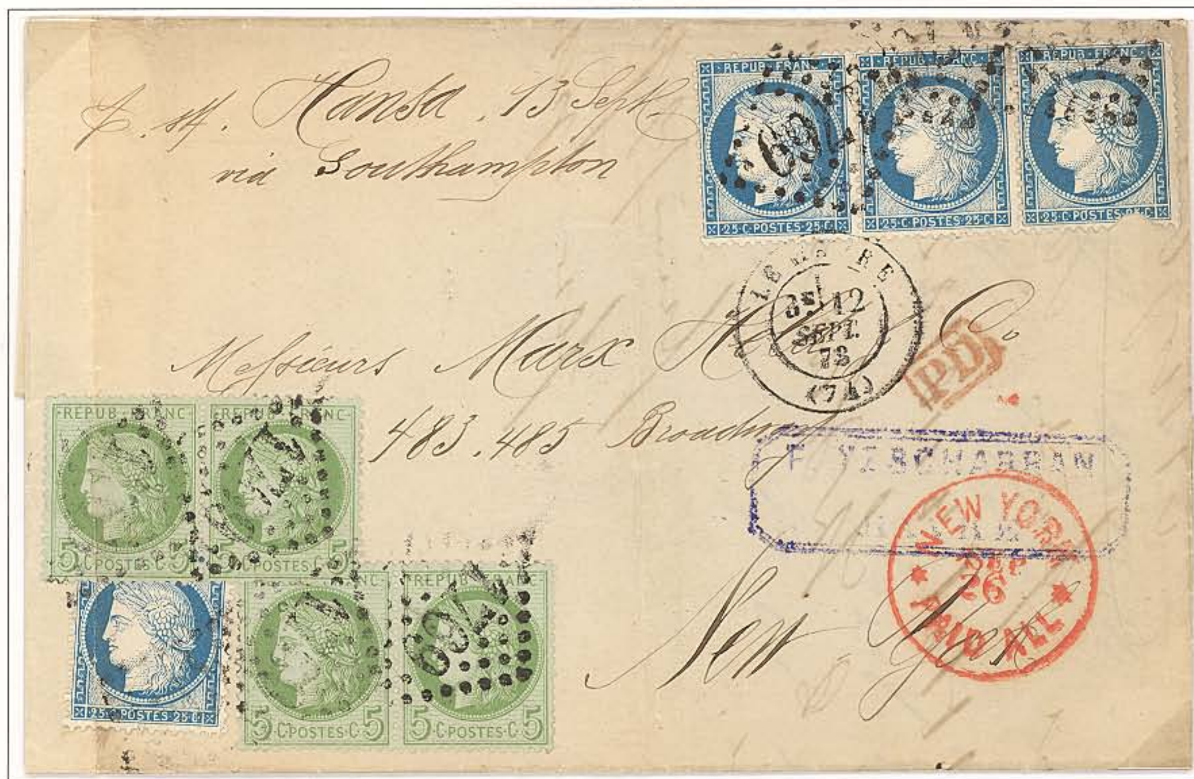
Folded Letter Outer Sheet: Havre to New York, 12 September 1873