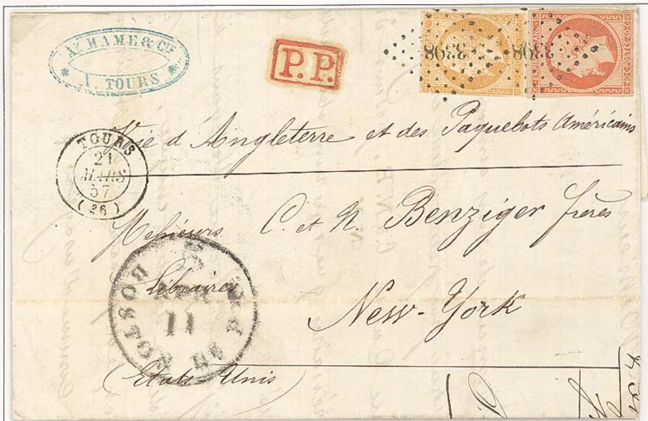
Folded Letter: Tours, France to New York, 20 March 1857