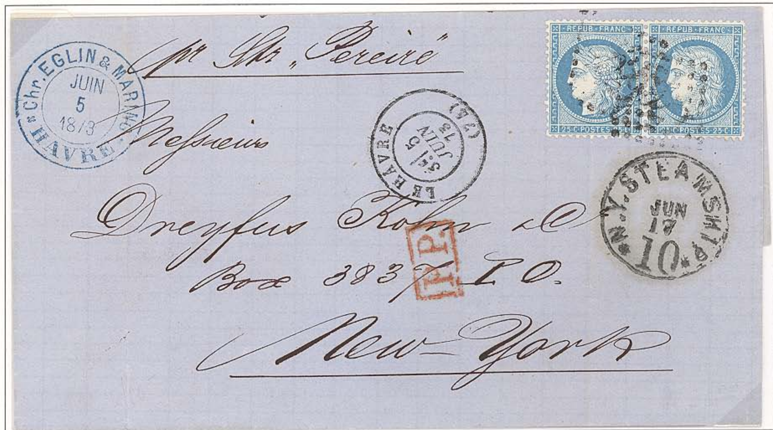
Folded Letter Outer Sheet: Havre to New York, 5 June 1873