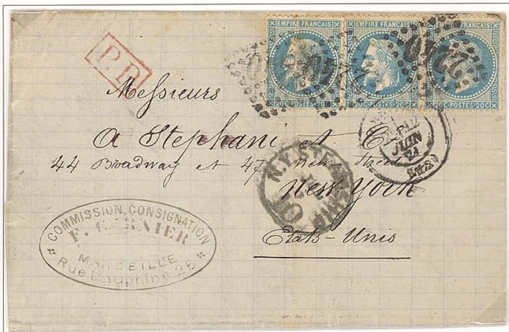
Folded Letter: Marseille to New York, 11 June 1871

Ship: Lafayette Company: Compagnie Générale Transatlantique (French Line H) Depart: Brest, 24 June 1871 Arrive: New York, 6 July 1871 Rate: 60 centimes prepaid for direct rate to U.S. 10¢ postage due in New York