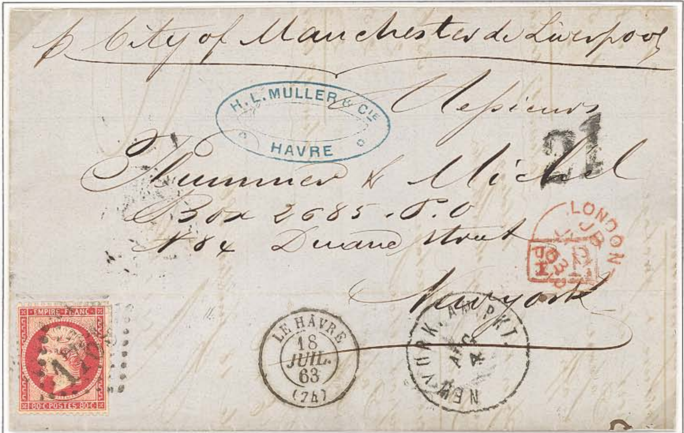
Folded Letter: Havre to New York, 18 July 1863