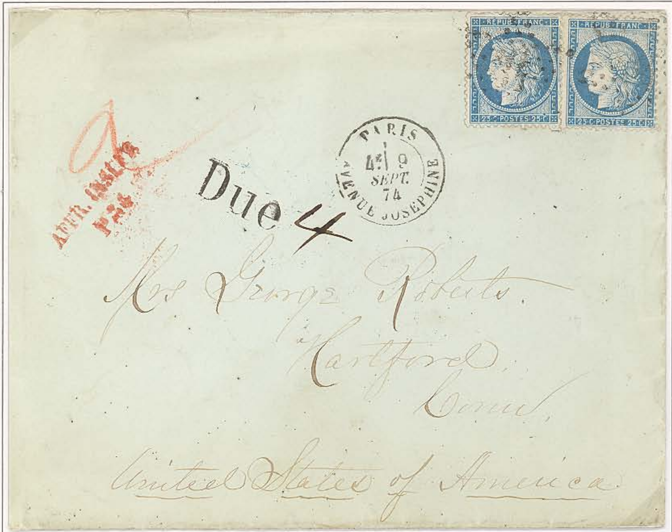
Envelope: Paris to Hartford, Connecticut, 9 September 1874