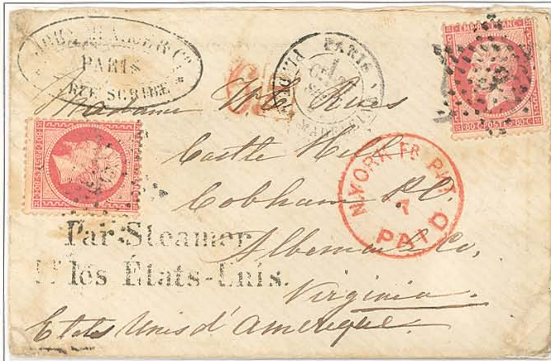
Envelope: Paris to Cobham, Virginia, 27 September 1867