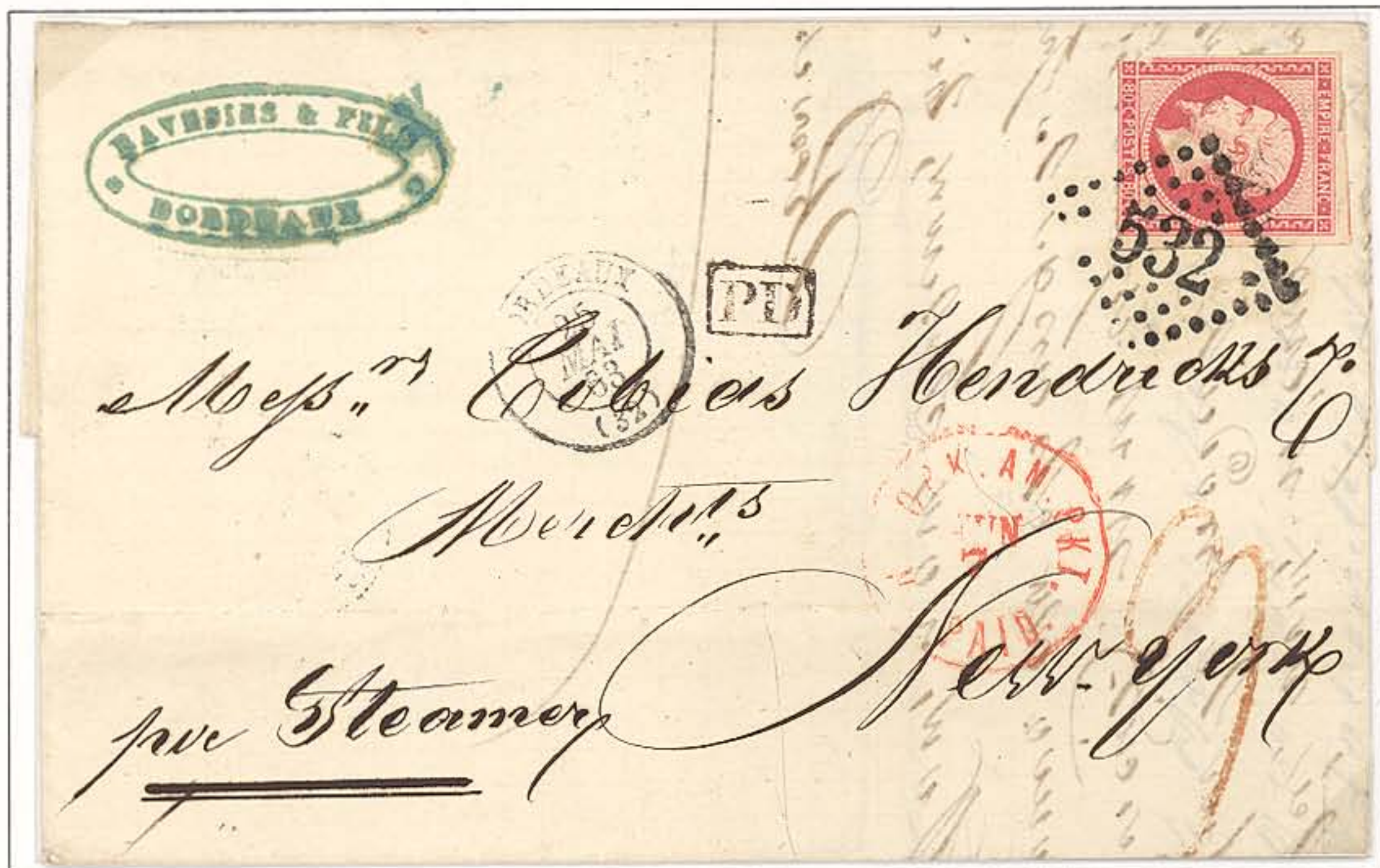
Folded Letter Outer Sheet: Bordeaux to New York, 25 May 1863