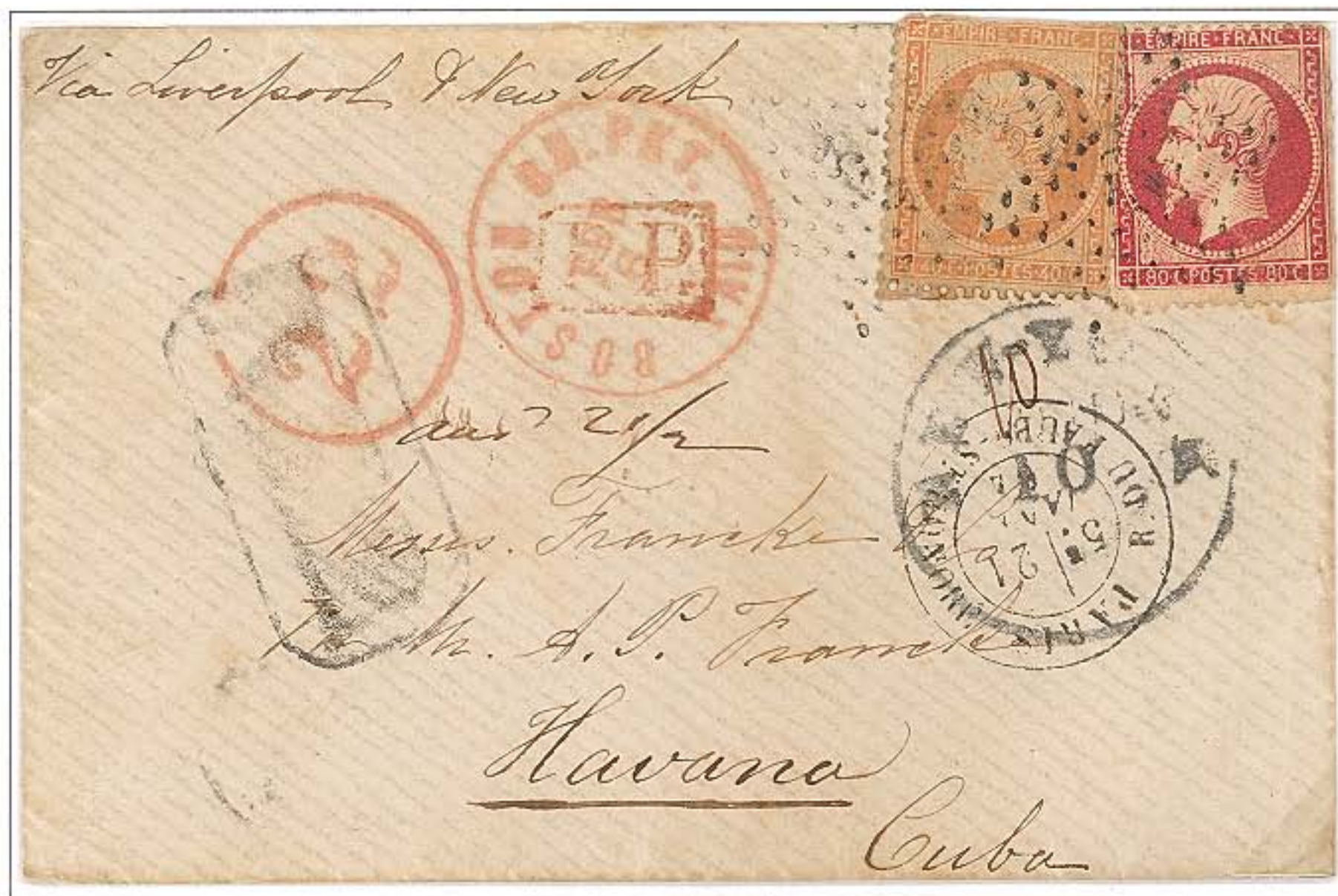
Envelope: Paris to Havana, Cuba, 21 January 1864