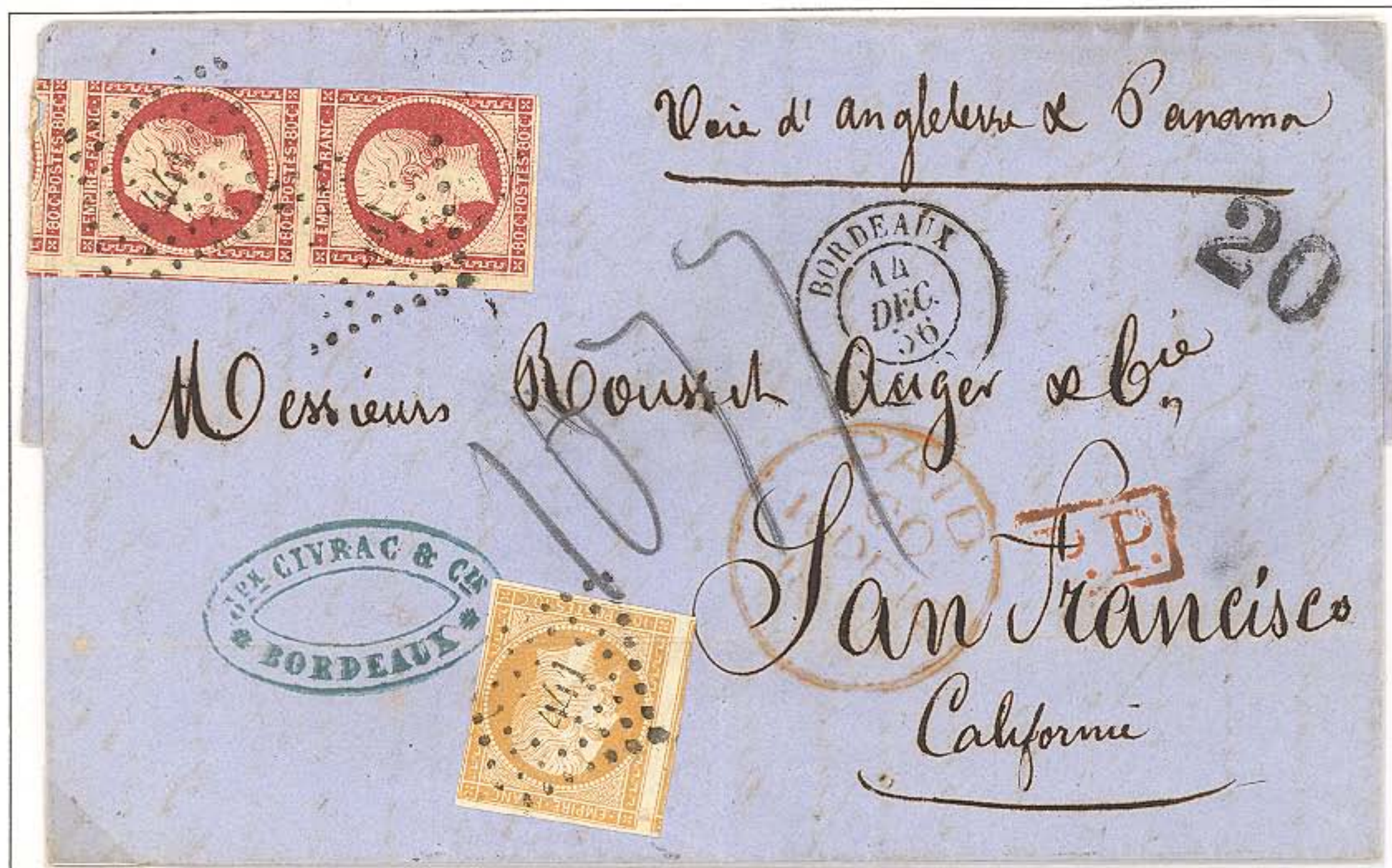
Folded Letter Outer Sheet: Bordeaux to San Francisco, 14 December 1856