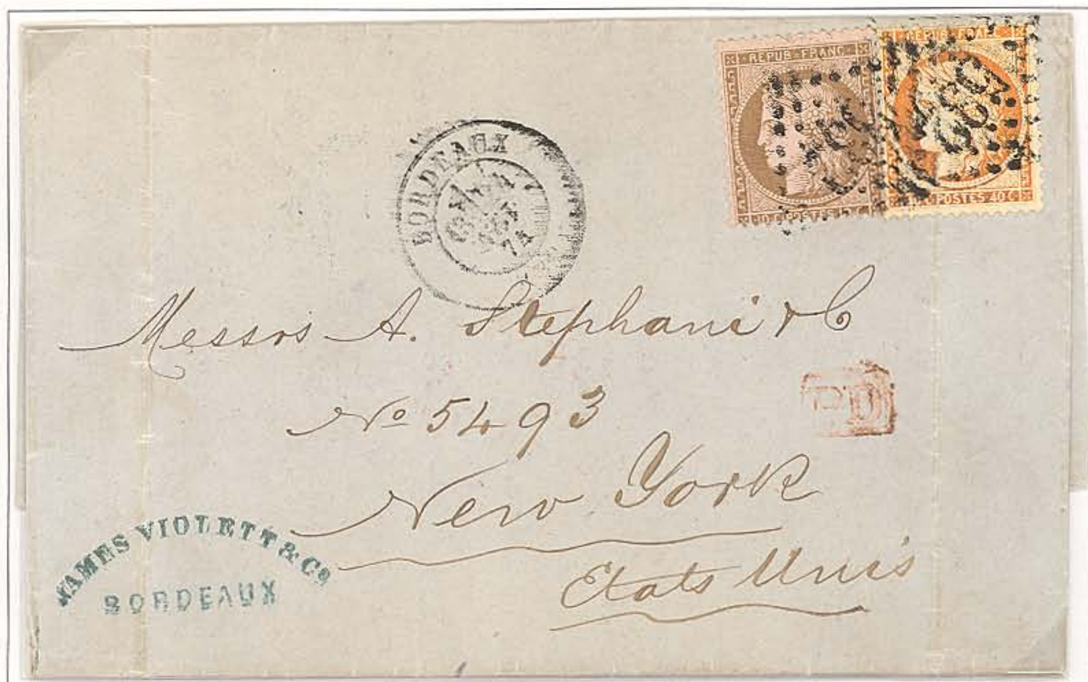
Folded Letter: Bordeaux to New York, 24 November 1874