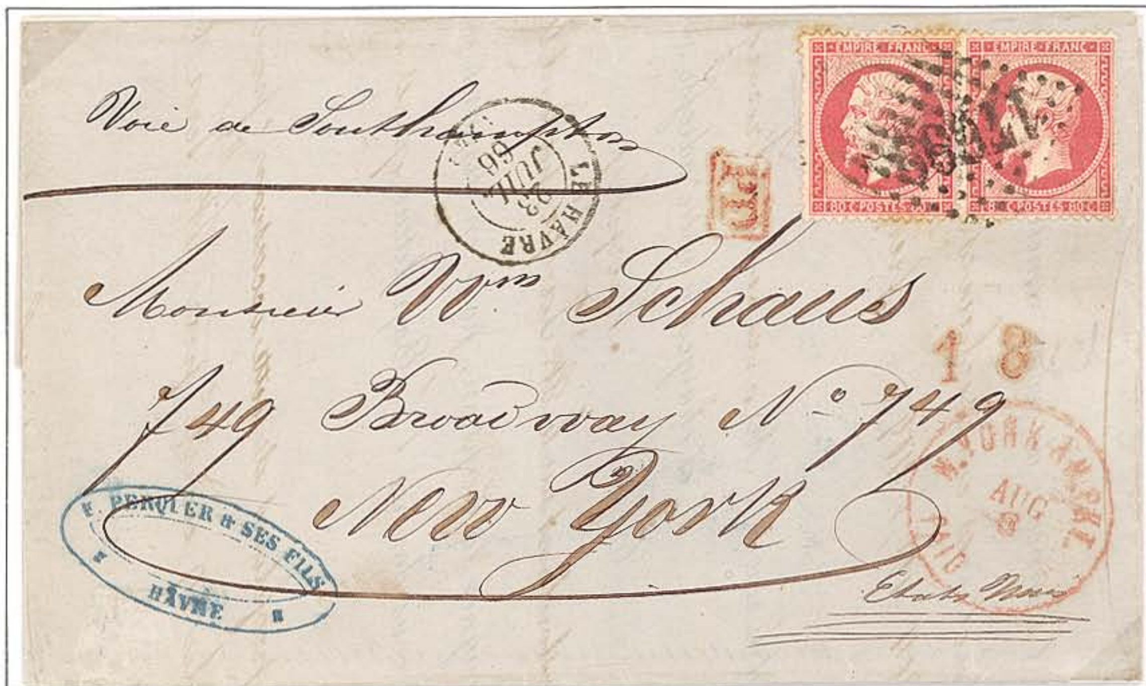
Folded Letter: Havre to New York, 23 July 1866