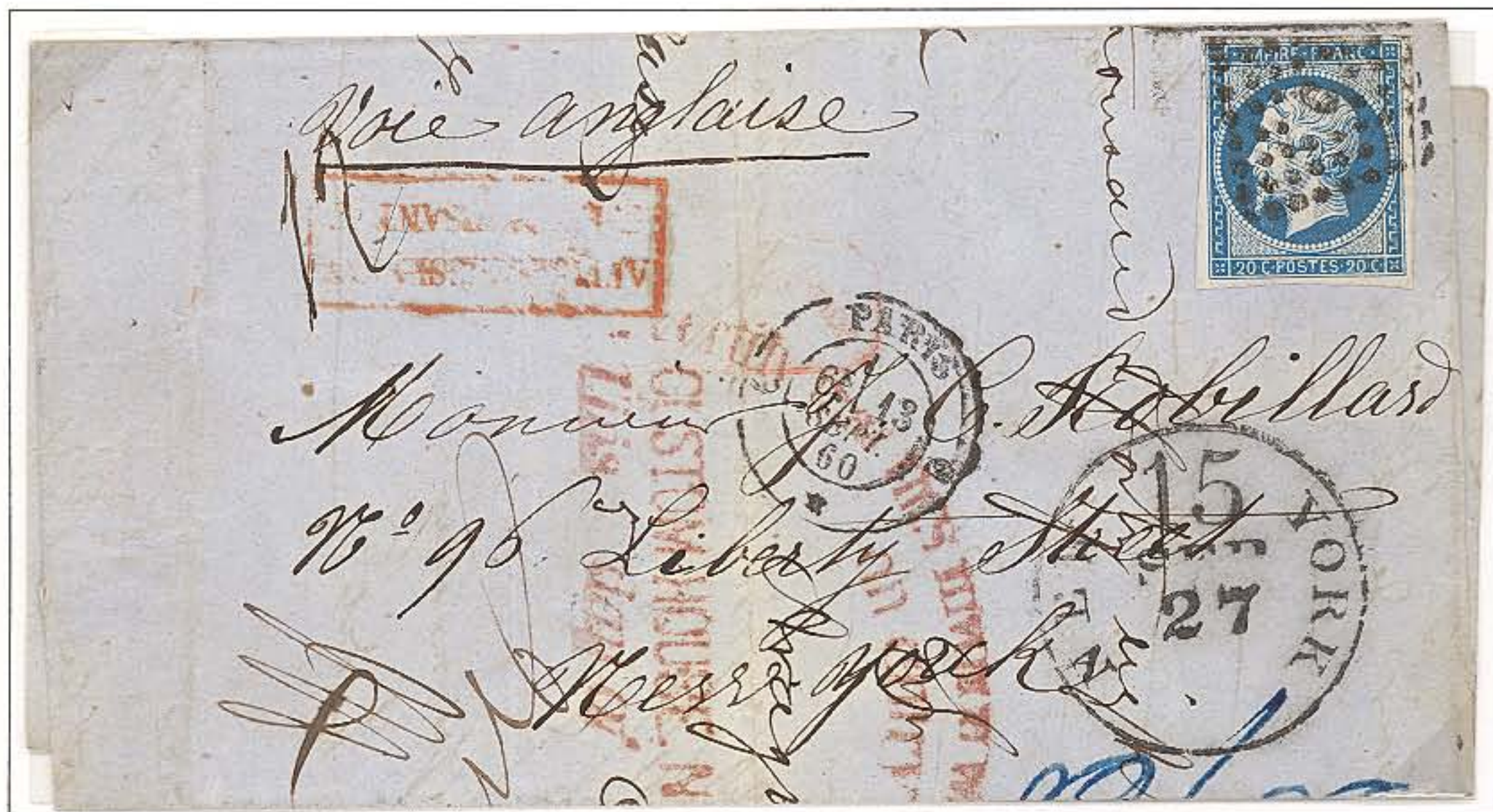
Folded Letter Outer Sheet: Paris to New York, 13 September 1860