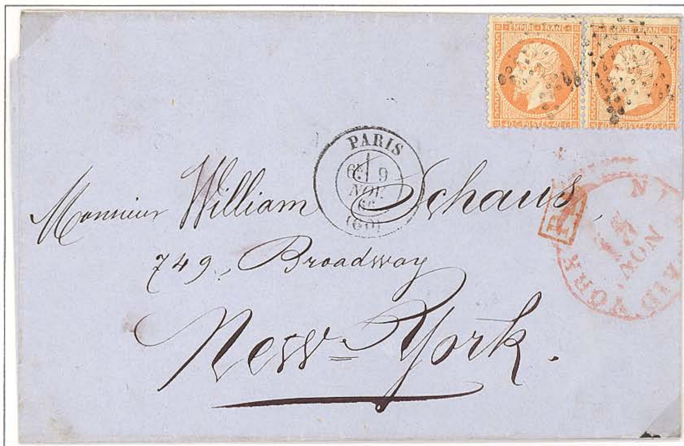
Folded Letter Outer Sheet: Paris to New York, 9 November 1866