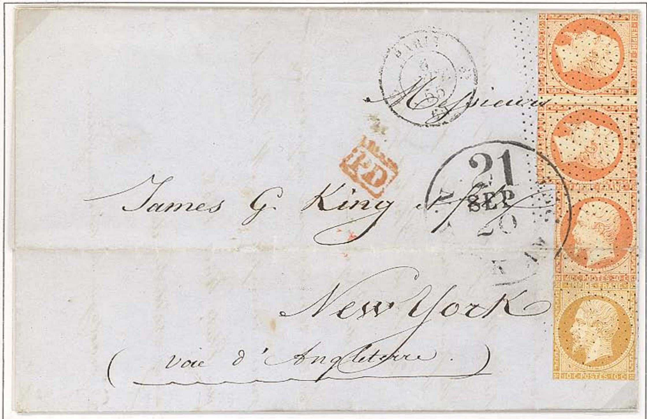
Folded Letter: Paris to New York, 6 September 1855

1847–1857 1 September 1851–1 January 1857