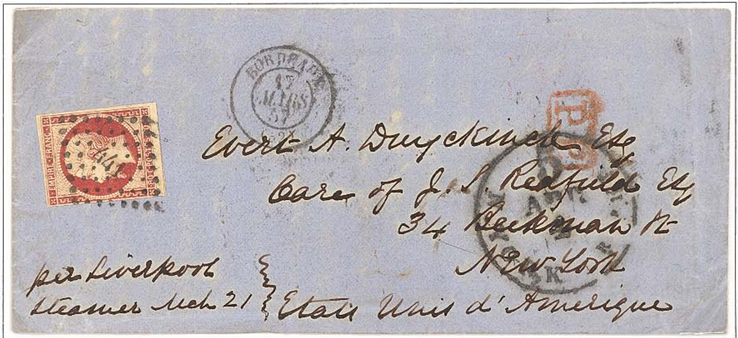
Envelope: Bordeaux to New York, 17 March 1857