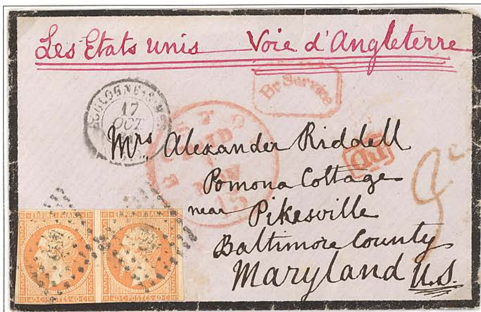
Envelope: Boulogne-sur-mer, France to Pikesville, Maryland, 17 October 1861

Ship: Europa Company: British & North American Royal Mail Steam Packet Company (Cunard Line) Depart: Queenstown, 20 October 1861 Arrive: Boston, 1 November 1861 Rate: 80 centimes prepaid for single treaty rate 3¢ French credit to U.S.