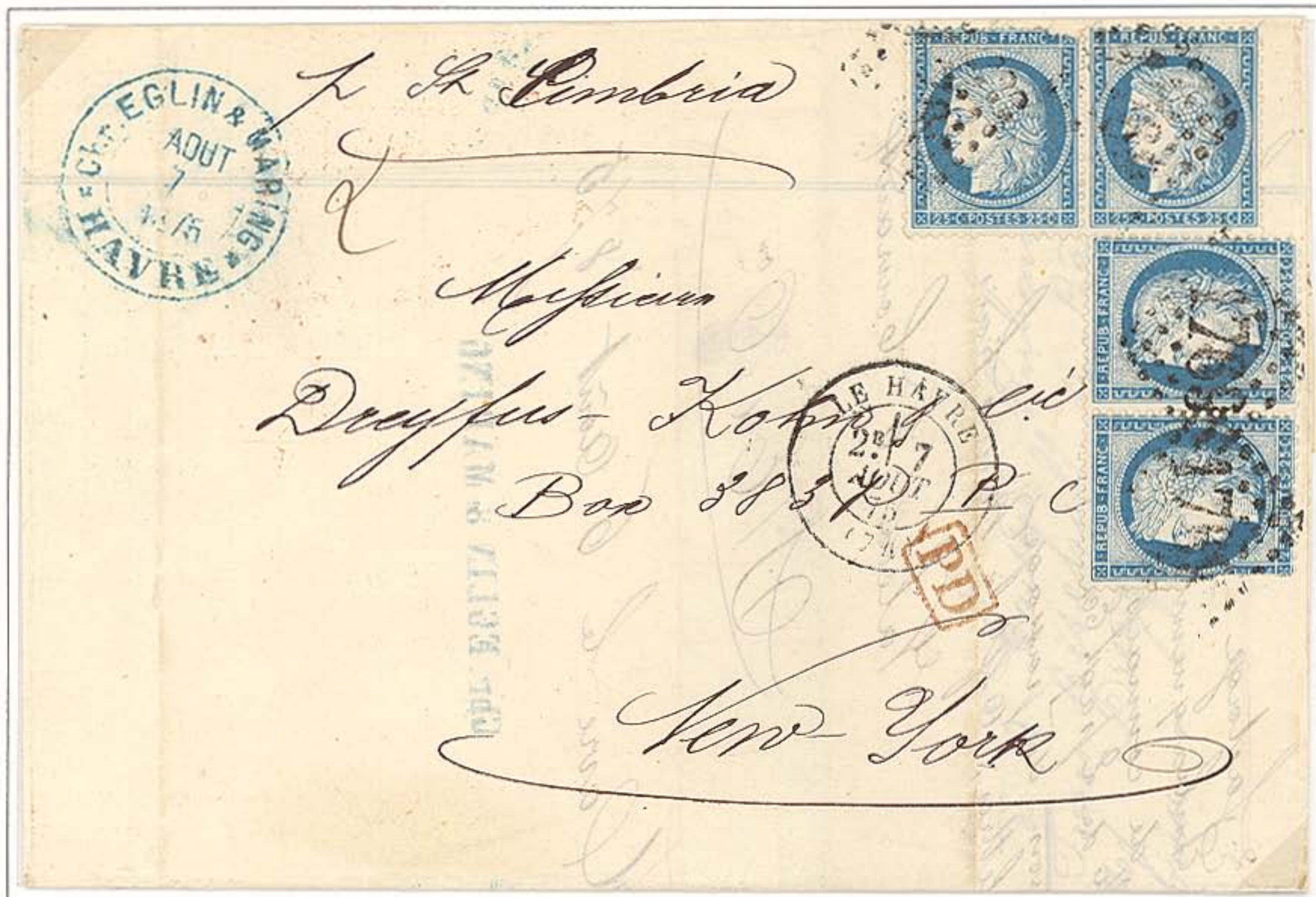
Folded Letter Outer Sheet: Havre to New York, 6 August 1875