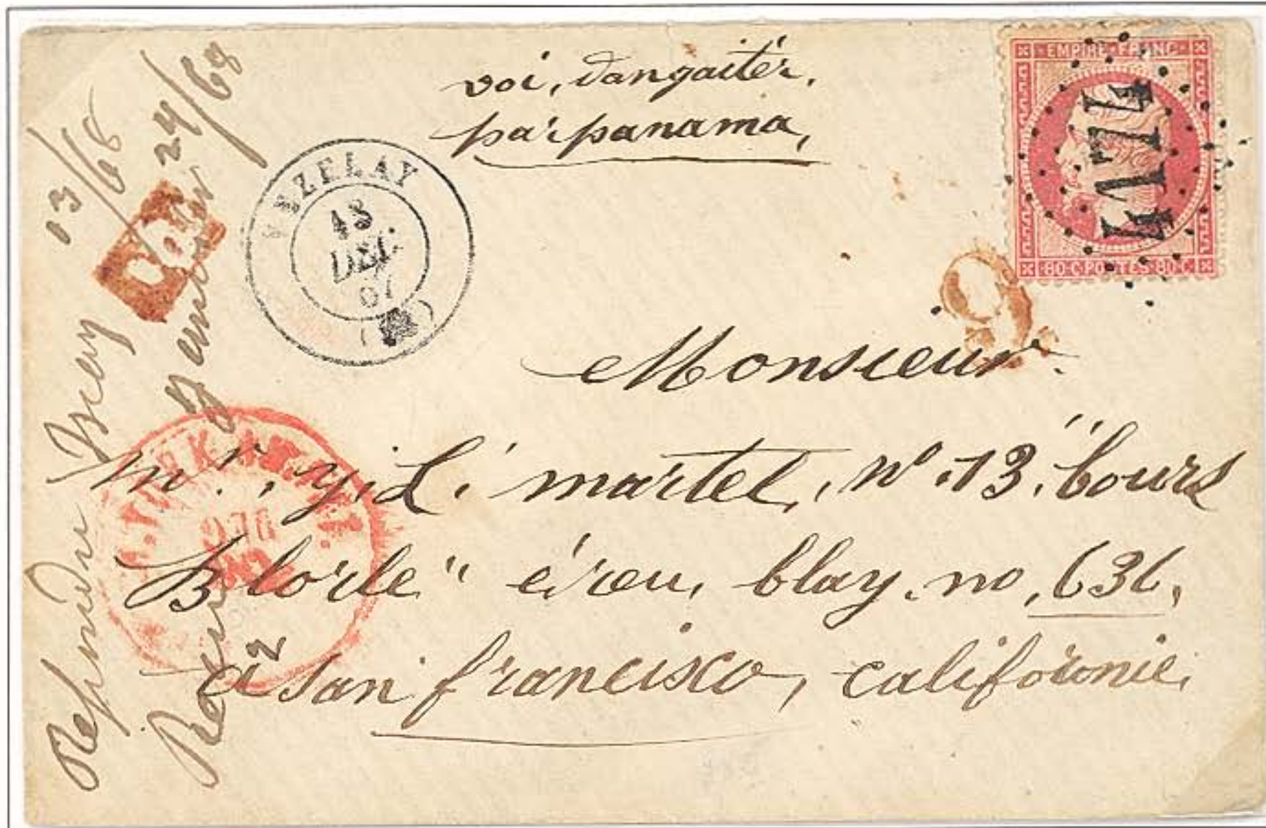
Envelope: Vezelay, France to San Francisco, 13 December 1867

Ship: Deutschland Company: Norddeutscher Lloyd (North German Lloyd Line) Depart: Southampton, 17 December 1867 Arrive: New York, 30 December 1867 Rate: 80 centimes prepaid for single treaty rate 9¢ French credit to U.S.