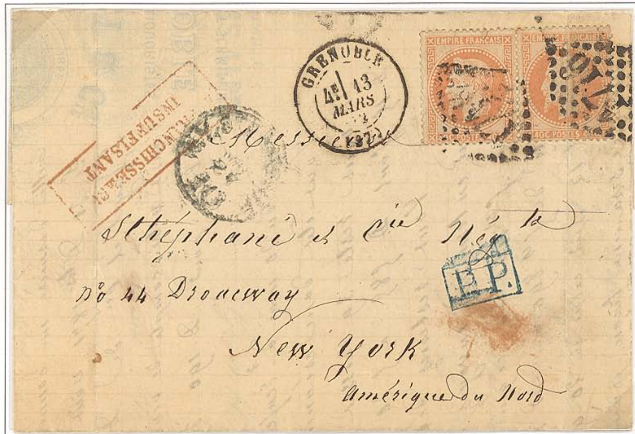
Folded Letter: Grenoble, France to New York, 13 March 1872