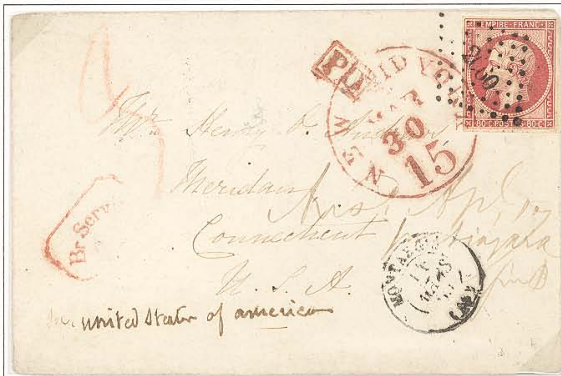
Envelope: Montargis, France to Meriden, Connecticut, 14 March 1860