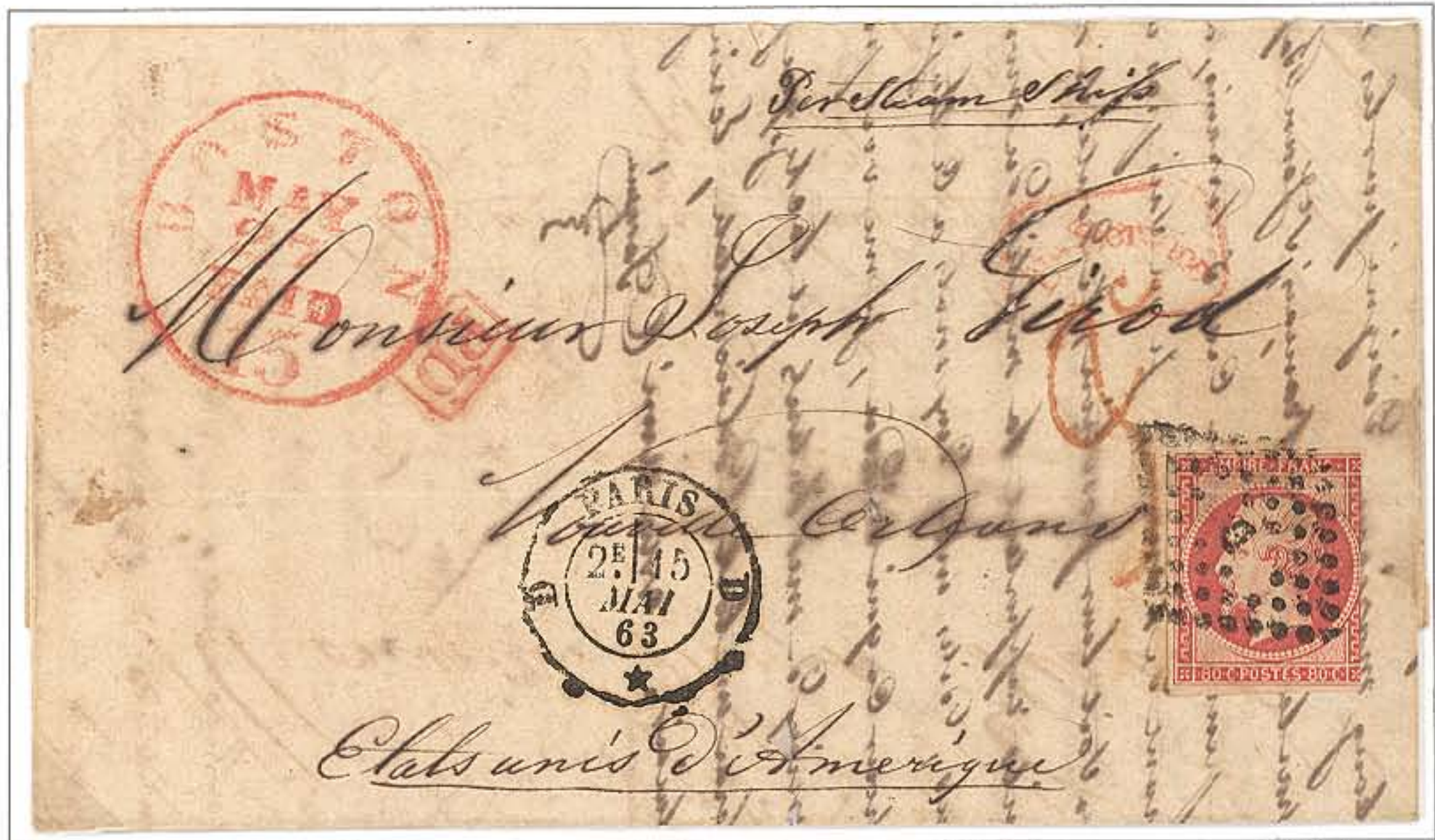
Envelope: Paris to New Orleans, 15 May 1863