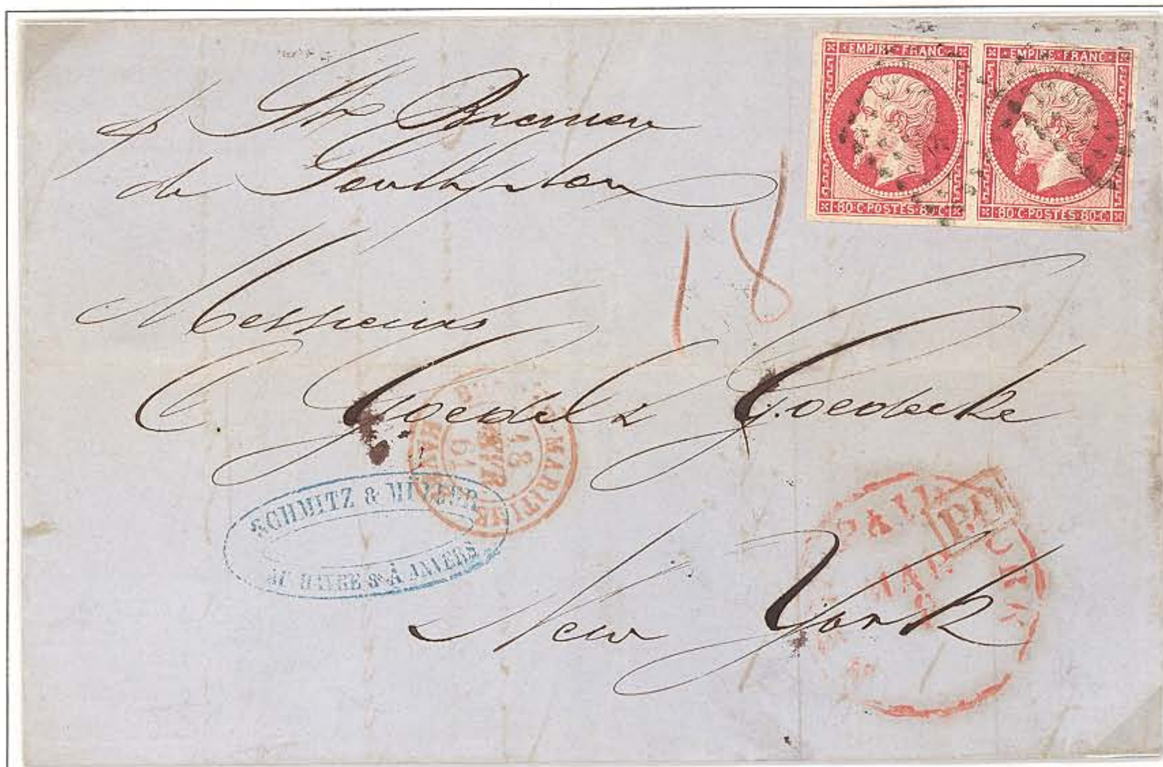
Folded Letter Outer Sheet: Havre to New York, 18 February 1861