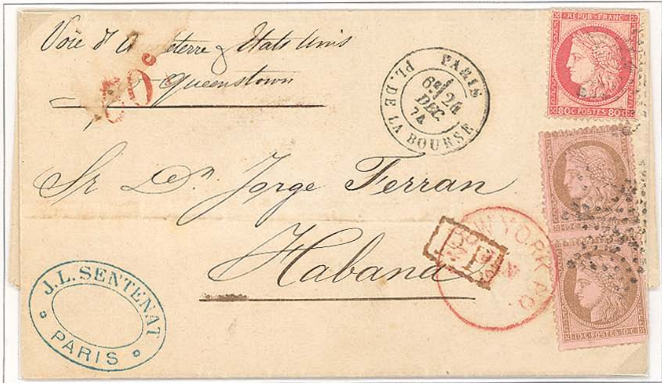
Folded Letter: Paris to Havana, Cuba, 24 December 1874