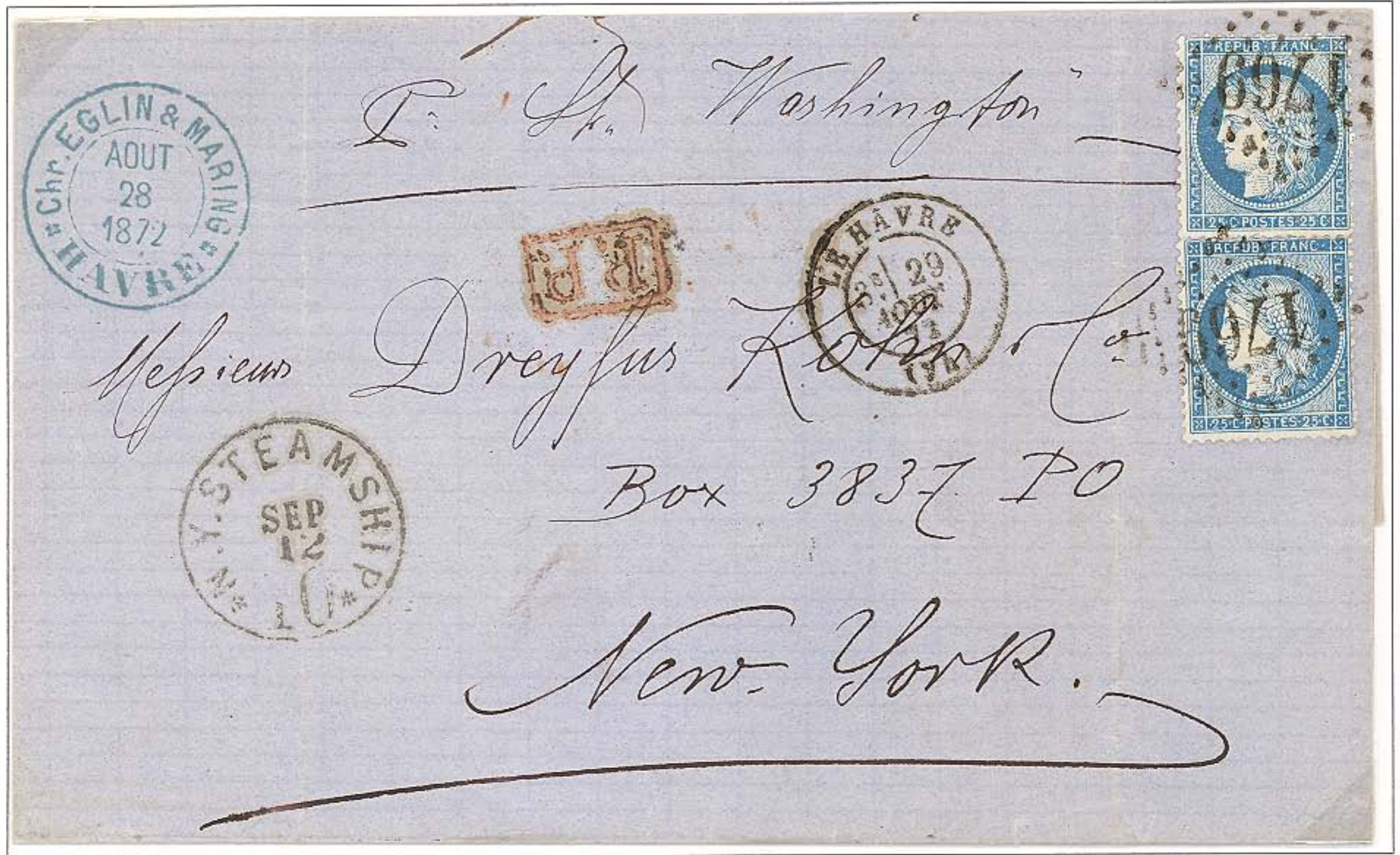
Folded Letter Outer Sheet: Havre to New York, 28 August 1872

Ship: Washington Company: Compagnie Générale Transatlantique (French Line H) Depart: Havre, 29 August 1872 Arrive: New York, 12 September 1872 Rate: 50 centimes prepaid for direct rate to U.S. 10¢ postage due in New York