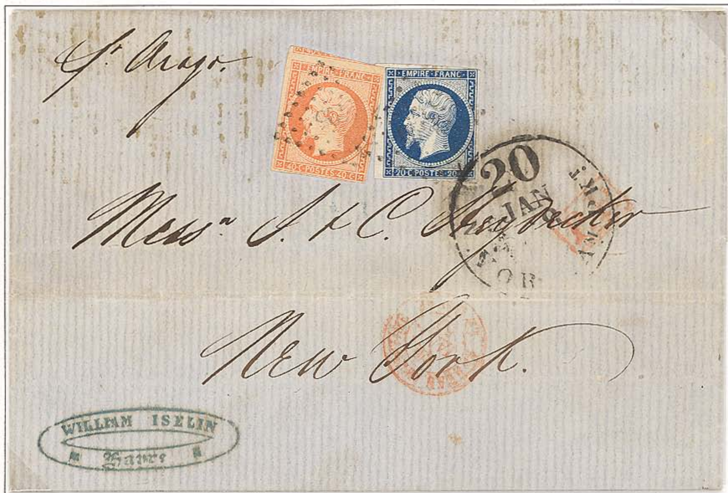
Envelope: Havre to New York, 13 January 1857