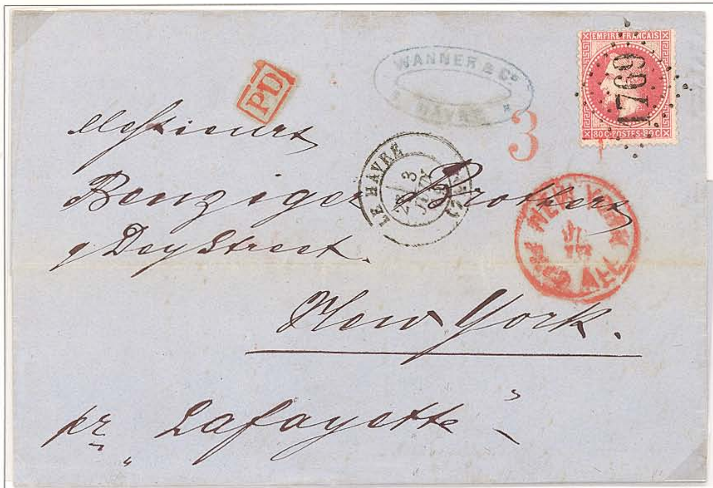
Folded Letter: Havre to New York, 3 June 1869