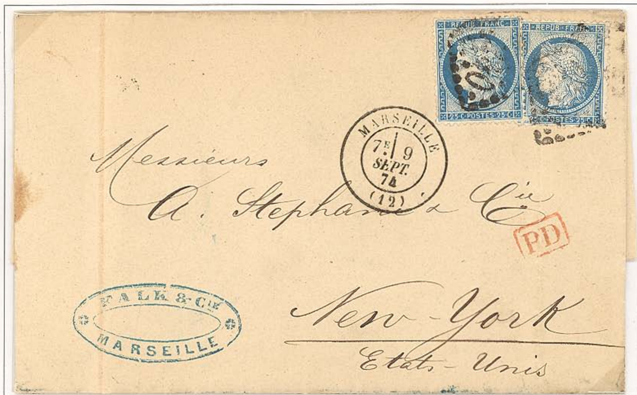
Folded Letter: Marseille to New York, 9 September 1874