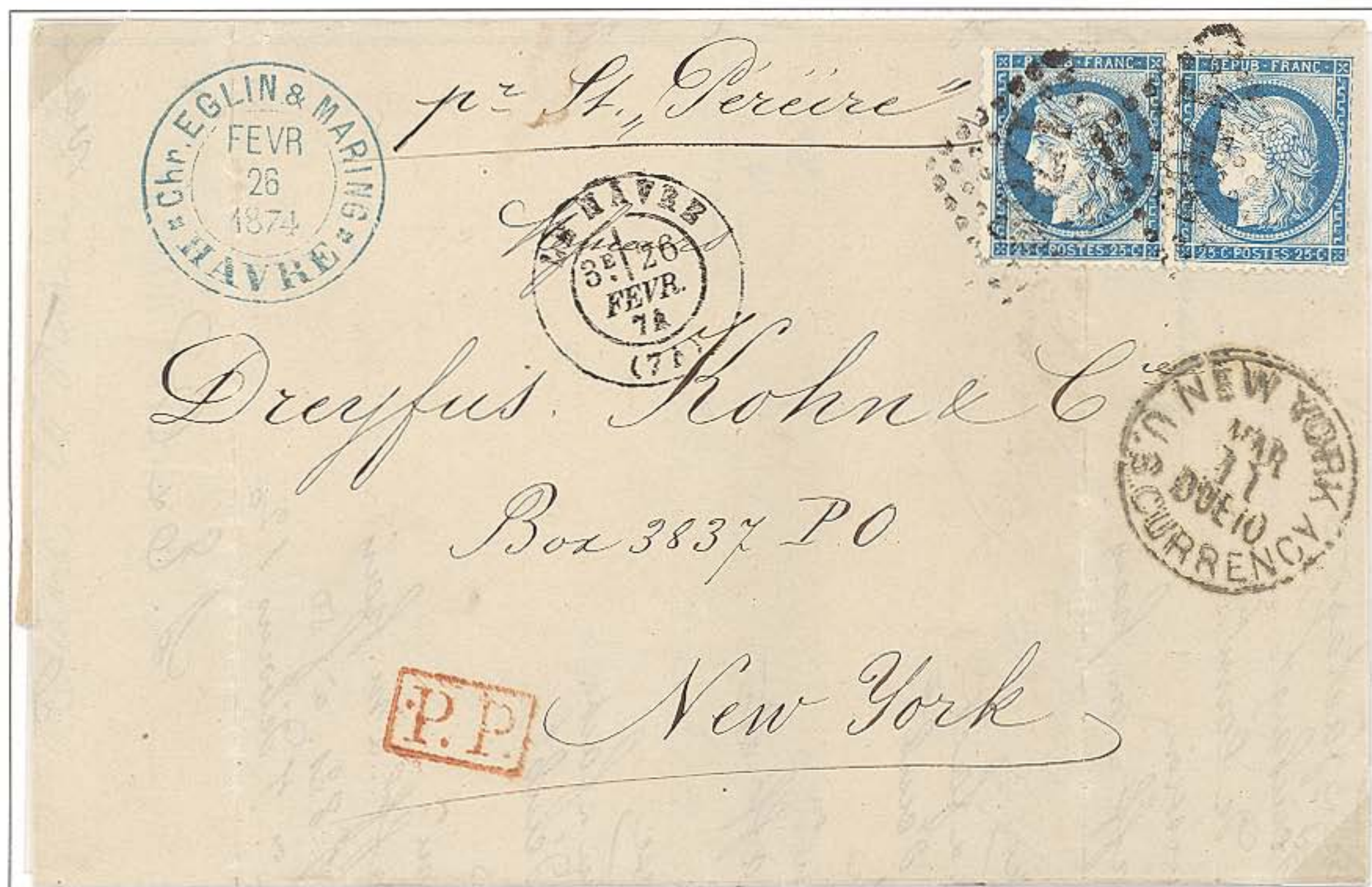
Folded Letter Outer Sheet: Havre to New York, 26 February 1874