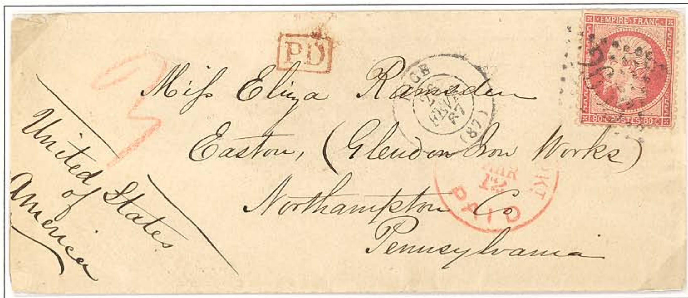
Envelope: Nice, France to Easton, Pennsylvania, 26 February 1867