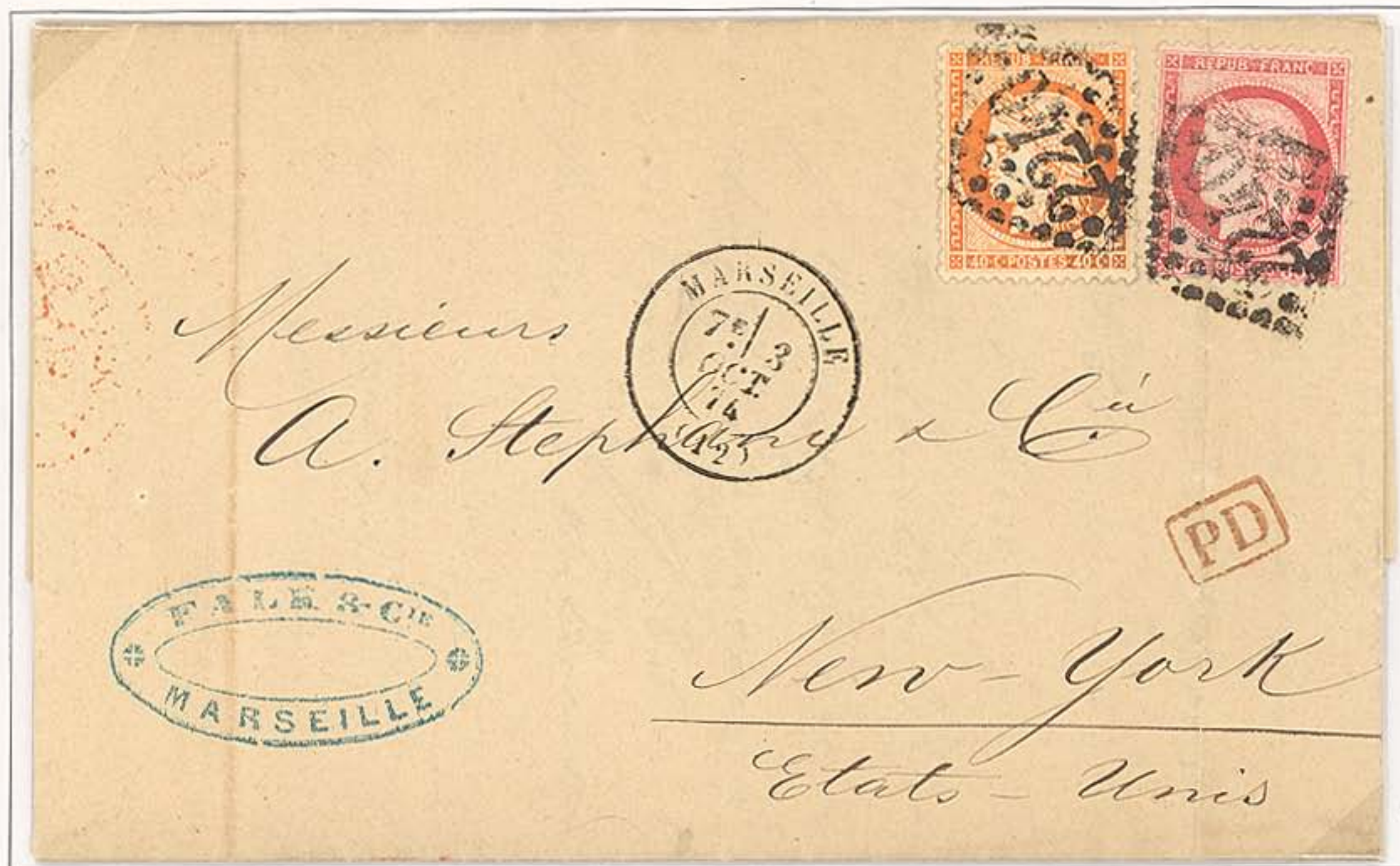
Folded Letter: Marseille to New York, 3 October 1874