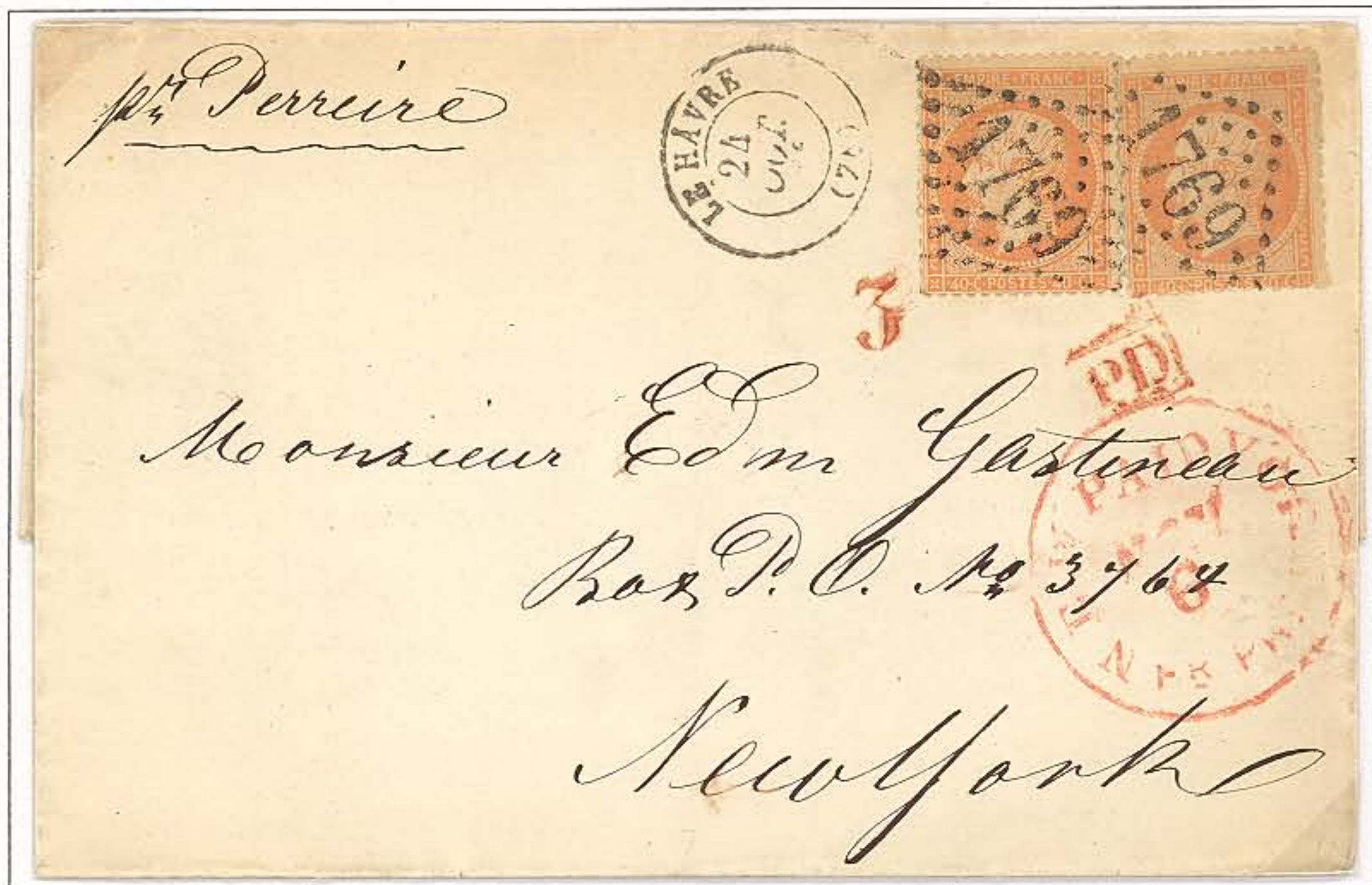
Folded Letter Outer Sheet: Havre to New York, 24 October 1866