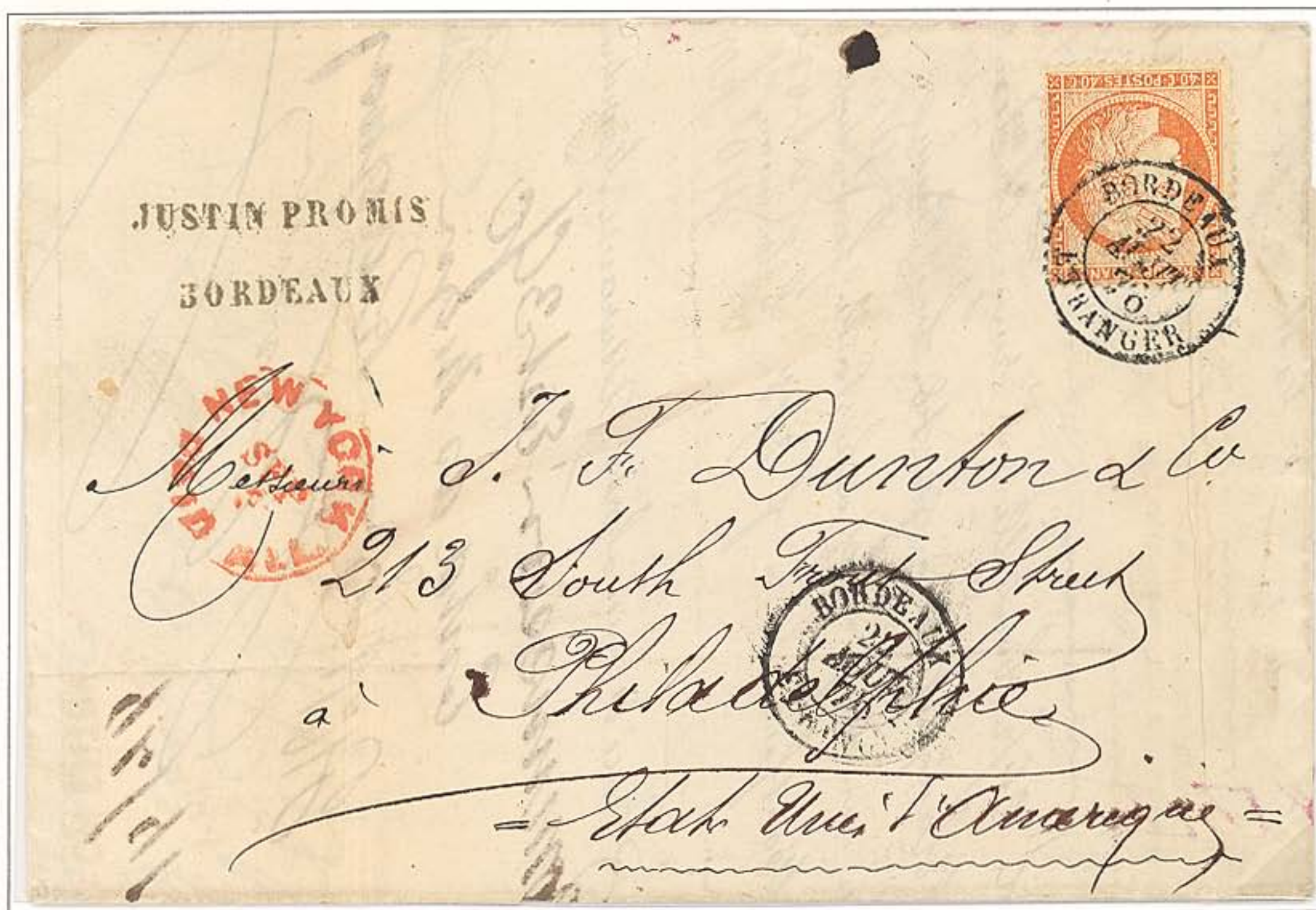
Folded Letter Outer Sheet: Bordeaux to Philadelphia, 21 August 1876