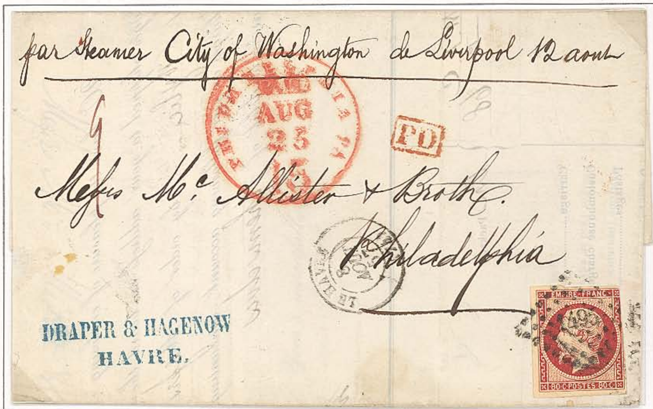
Folded Letter: Havre to Philadelphia, 7 August 1857