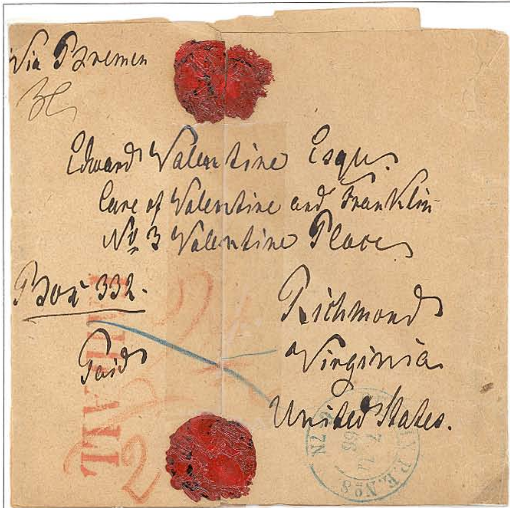
Pamphlet Wrapper: Berlin to Richmond, Virginia, 7 November 1866

Ship: Germania Company: Hamburg-Amerikanische Packetfahrt Aktien Gesellschaft (HAPAG) (Hamburg American Line) Depart: Hamburg, 11 November 1866 Arrive: New York, 25 November 1866 Rate: 4½ silbergroschen paid for pamphlet rate to destination