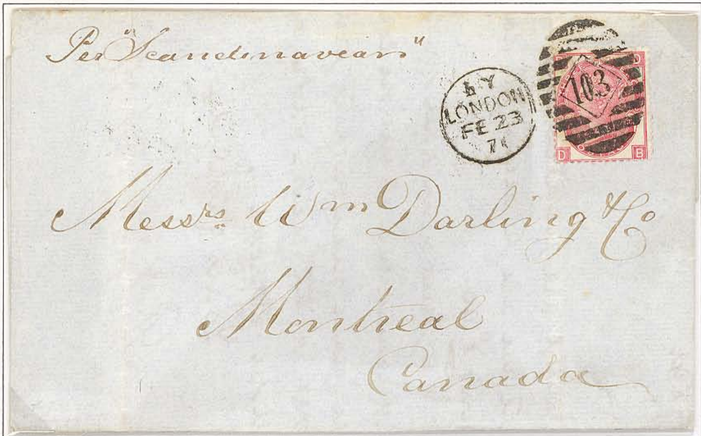
Folded Letter: London to Montreal, Canada, 23 February 1871

Ship: Scandinavian Company: Montreal Ocean Steamship Company (Allan Line) Depart: Londonderry, 24 February 1871 Arrive: Portland, 7 March 1871 Rate: 3 pence prepaid for single rate Notes: Allan Line steamers called at Moville, the port city for Londonderry, Ireland, on the day following departure from Liverpool, for the London mails. This letter was in a closed mail bag from London to Montreal.