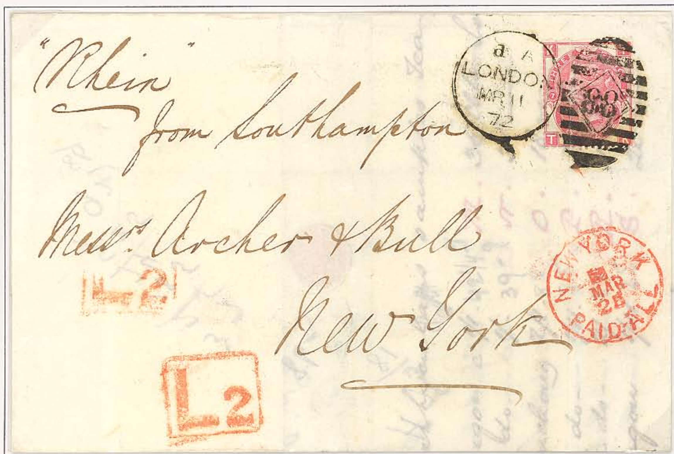
Folded Letter Outer Sheet: London to New York, 11 March 1872