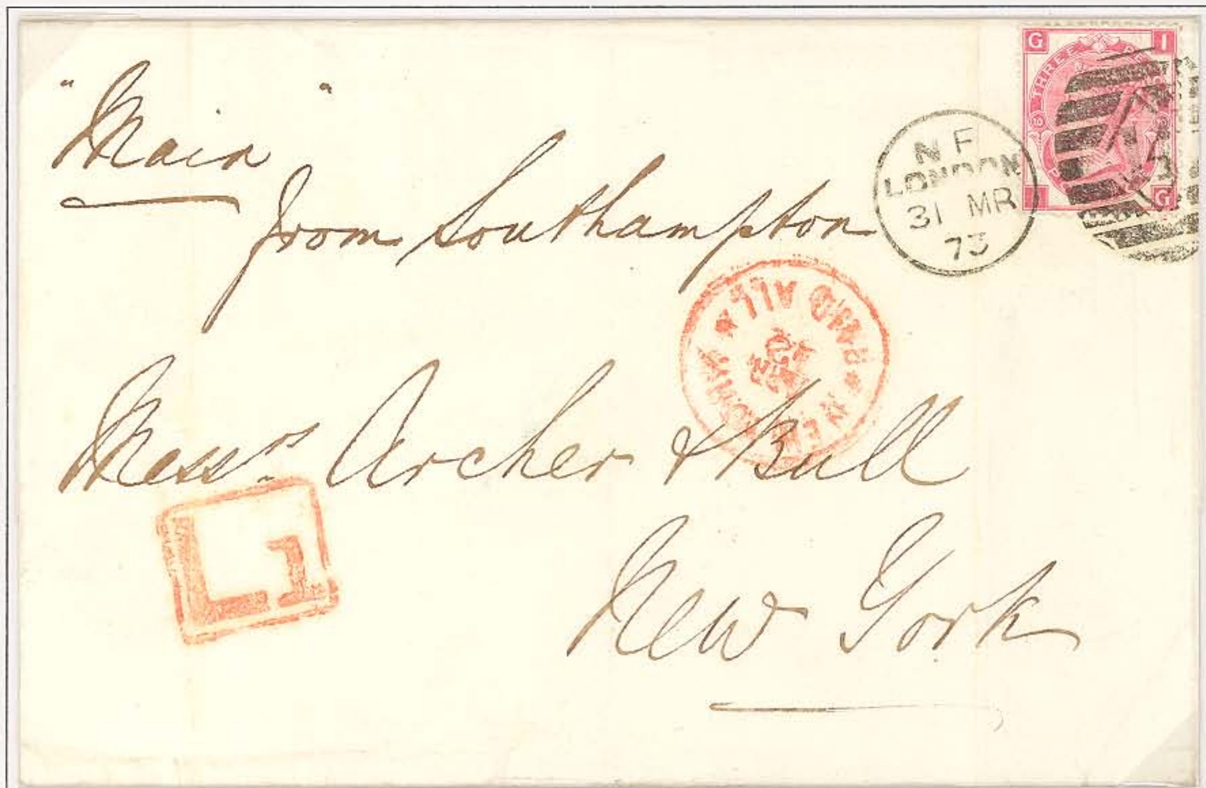
Folded Letter Outer Sheet: London to New York, 31 March 1873

Ship: Main Company: Norddeutscher Lloyd (North German Lloyd Line) Depart: Southampton, 1 April 1873 Arrive: New York, 11 April 1873 Rate: 3 pence prepaid for single treaty rate Notes: Large boxed L1 was struck at London to show a late fee was required (letter posted after the regular mails had closed). The late fee was paid in cash.