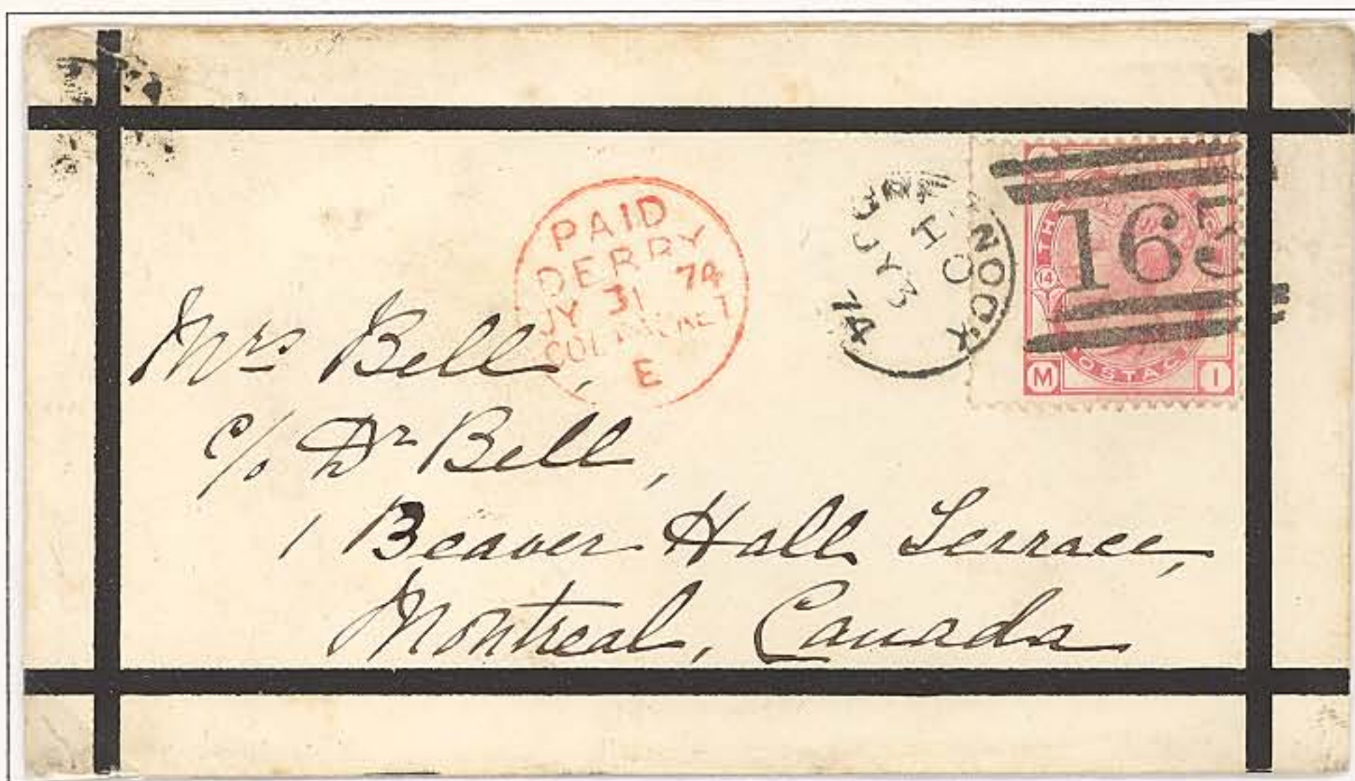
Envelope: Innellan, Scotland to Montreal, Canada, 30 July 1874

Ship: Prussian Company: Montreal Ocean Steamship Company (Allan Line) Depart: Londonderry, 31 July 1874 Arrive: Quebec, 10 August 1874 Rate: 3 pence prepaid for single rate