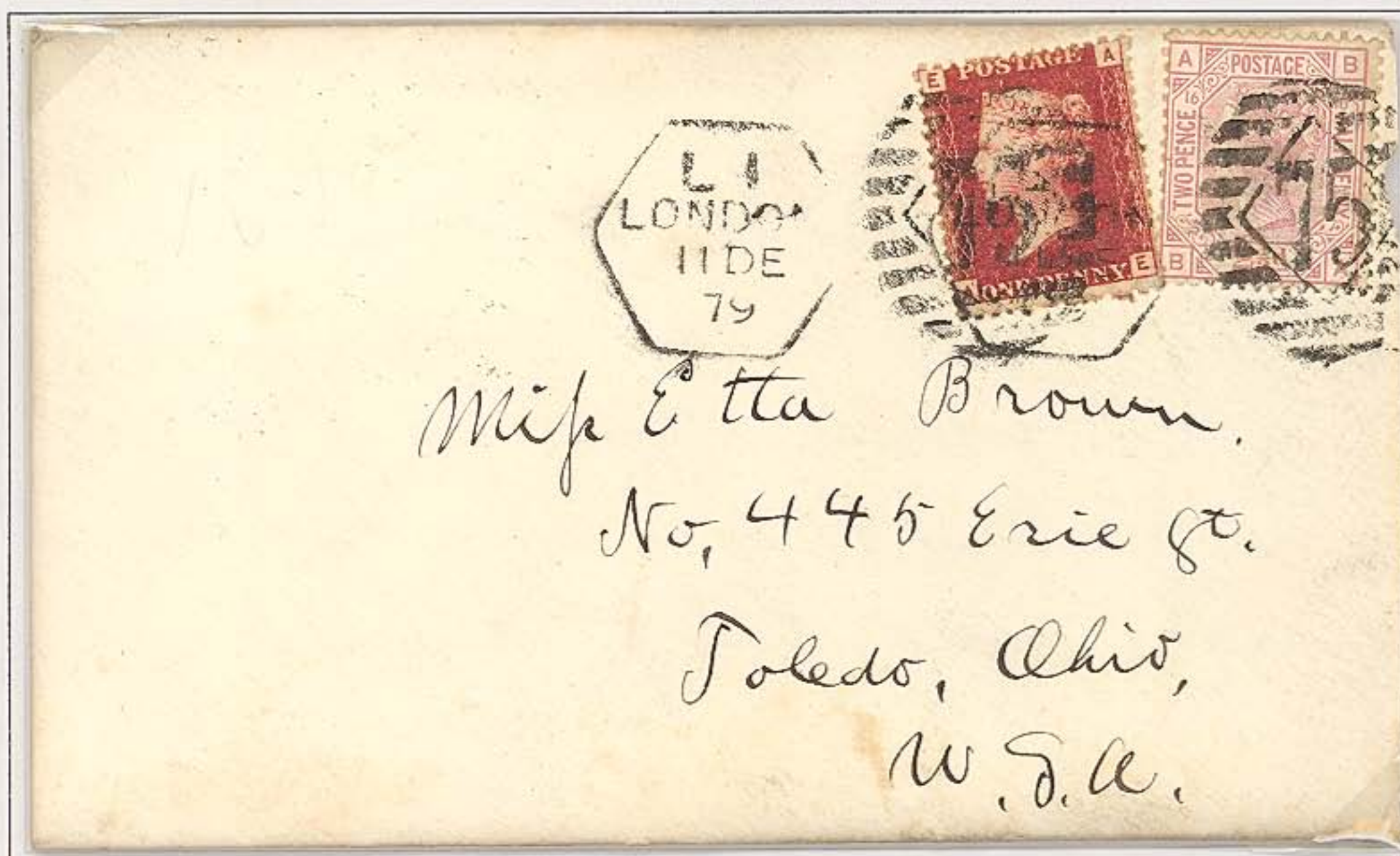
Envelope w/enclosed letter: London to Toledo, Ohio, 11 December 1879

Ship: Germanic Company: Oceanic Steam Navigation Company Limited (White Star Line) Depart: Queenstown, 14 December 1879 Arrive: New York, 24 December 1879 Rate: 2½ pence prepaid for single Union rate