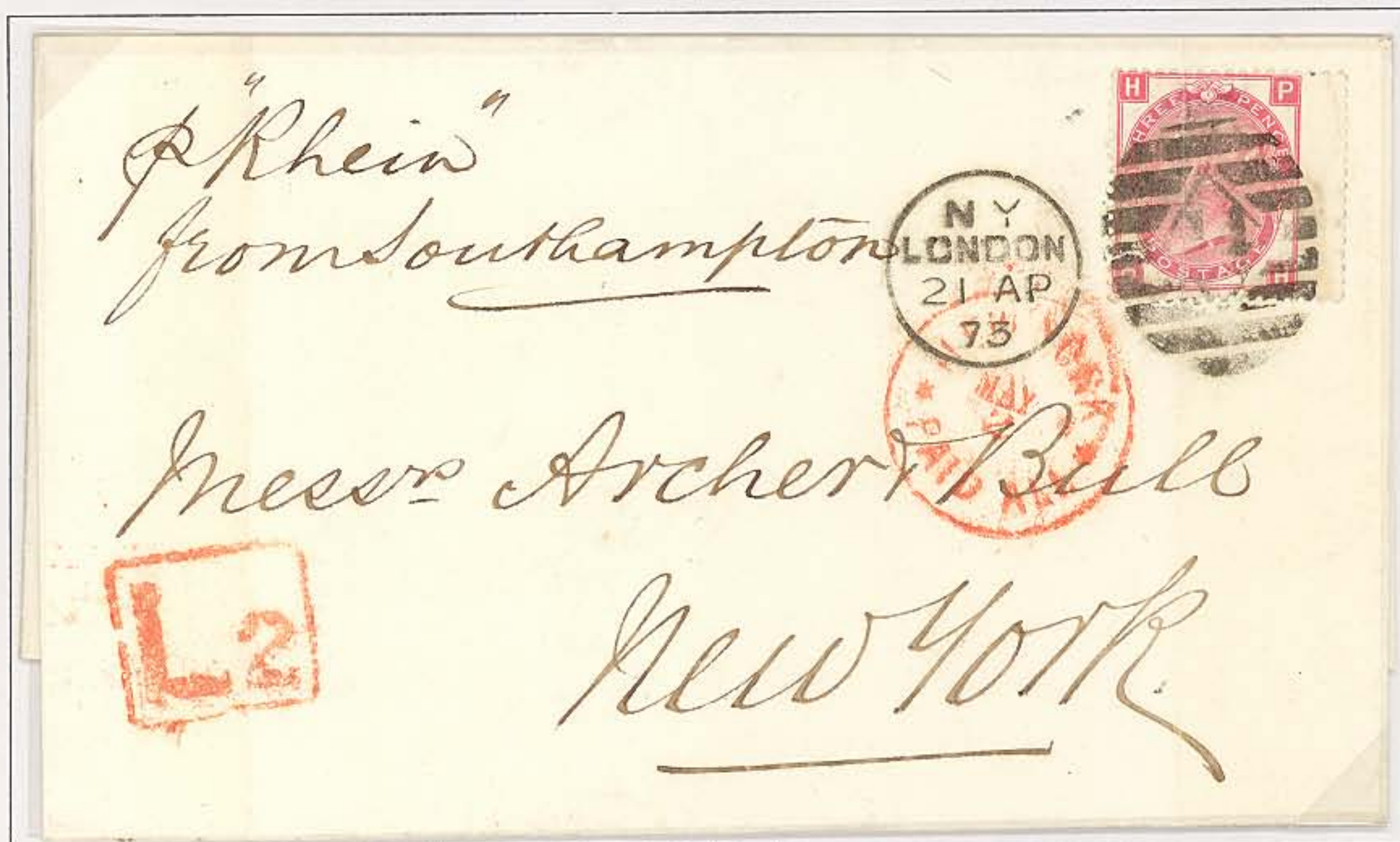
Folded Letter Outer Sheet: London to New York, 21 April 1873