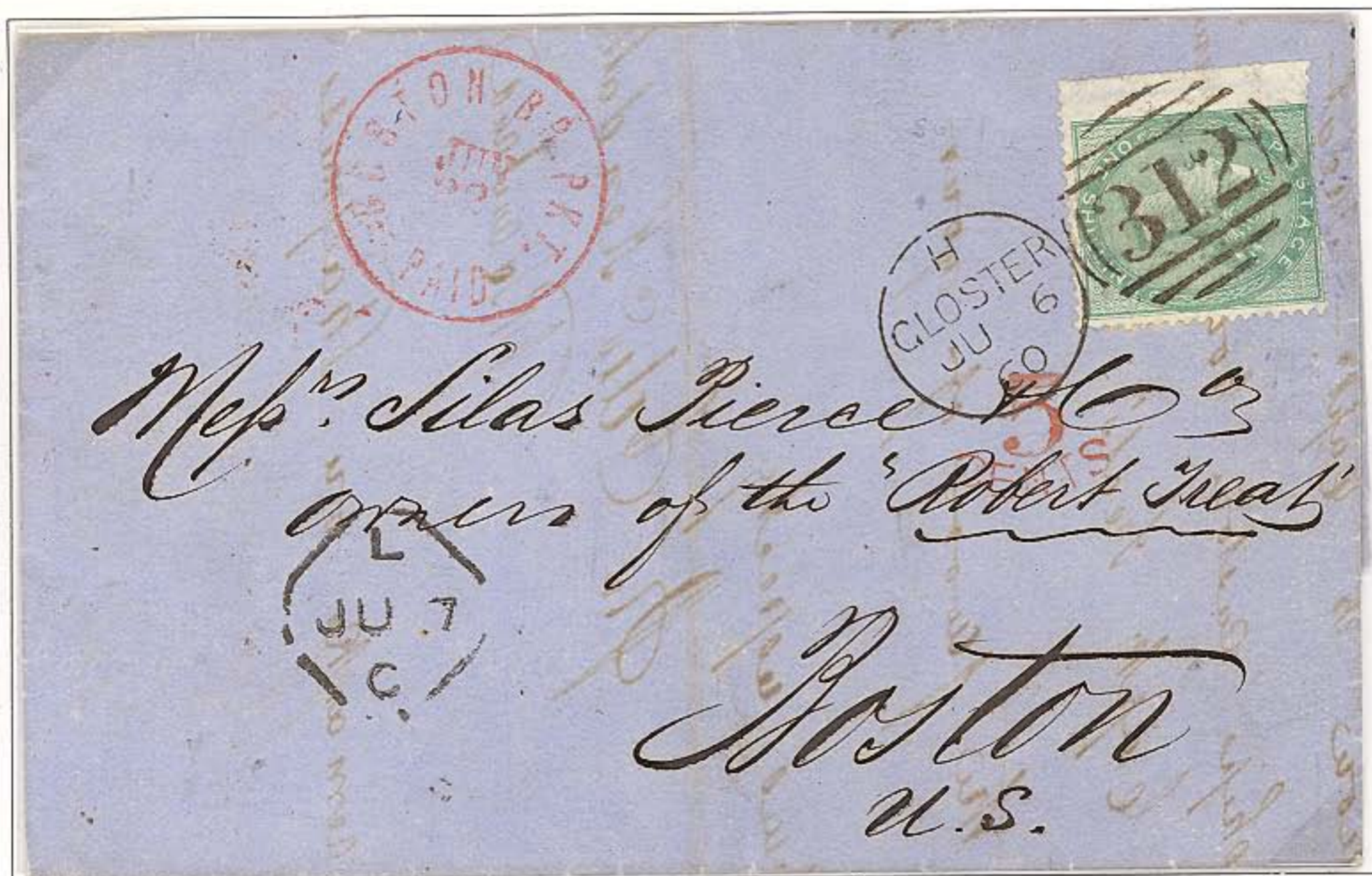
Folded Letter: Gloucester, England to Boston, 6 June 1860

1849-1867 15 February 1849-31 December 1867