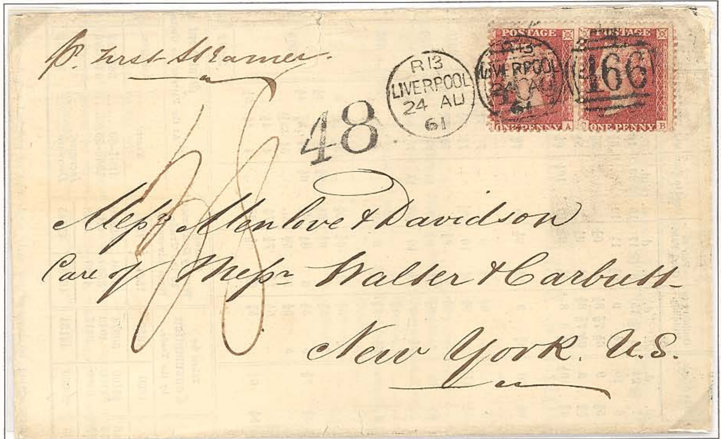
Folded Letter: Liverpool to New York, 23 August 1861

1849–1867 15 February 1849–31 December 1867