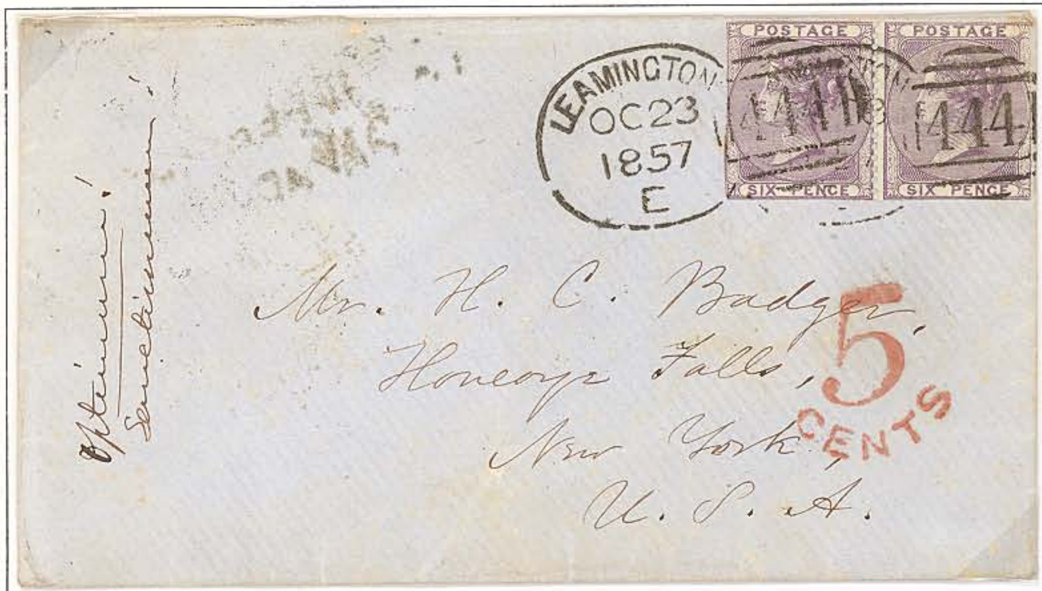
Envelope: Leamington, England to Honeoye, New York, 23 October 1857

1849–1867 15 February 1849–31 December 1867