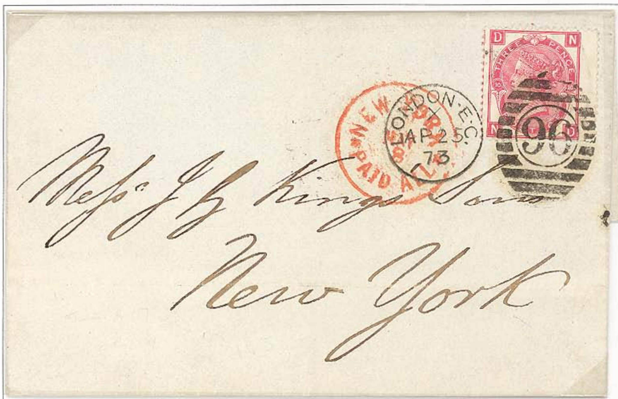
Folded Letter Outer Sheet: London to New York, 25 April 1873

Ship: Algeria Company: British & North American Royal Mail Steam Packet Company (Cunard Line) Depart: Queenstown, 27 April 1873 Arrive: New York, 8 May 1873 Rate: 3 pence prepaid for single treaty rate Notes: Letter prepaid with 3 pence adhesive, plate no. 10 (Scott No. 49).