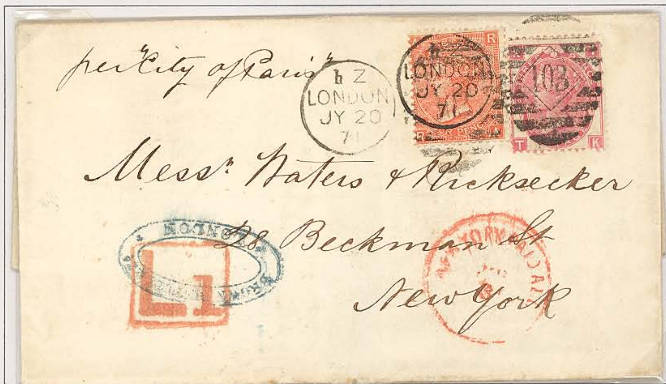
Folded Letter: London to New York, 20 July 1871