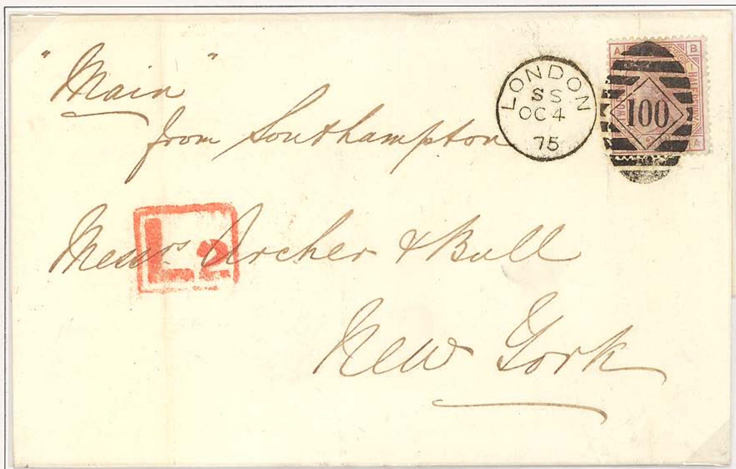
Folded Letter Outer Sheet: London to New York, 4 October 1875