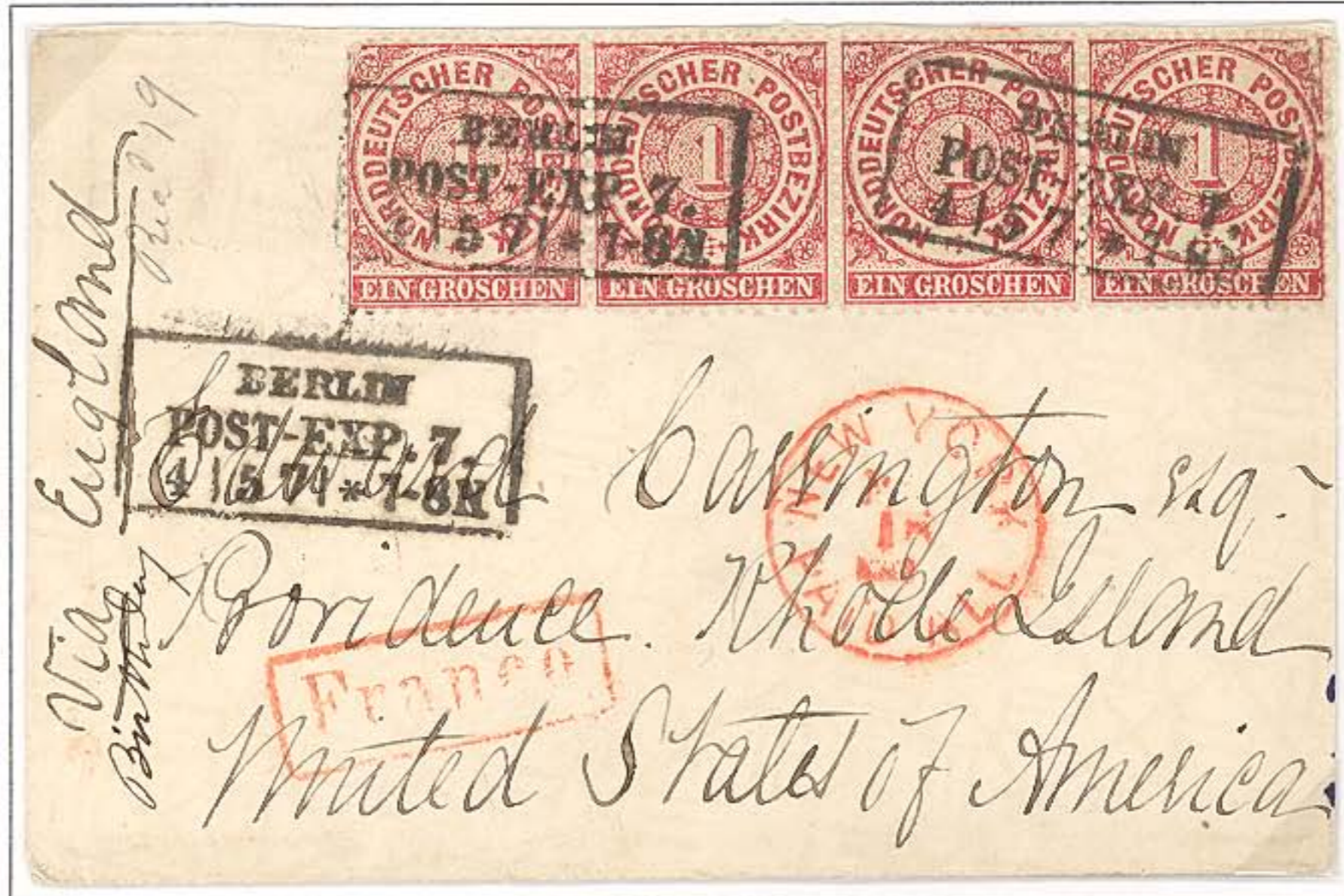
Envelope: Berlin, Prussia to Providence, Rhode Island, 4 May 1871

Ship: Cuba Company: British & North American Royal Mail Steam Packet Company (Cunard Line) Depart: Queenstown, 7 May 1871 Arrive: New York, 17 May 1871 Rate: 4 silbergroschen prepaid for single rate