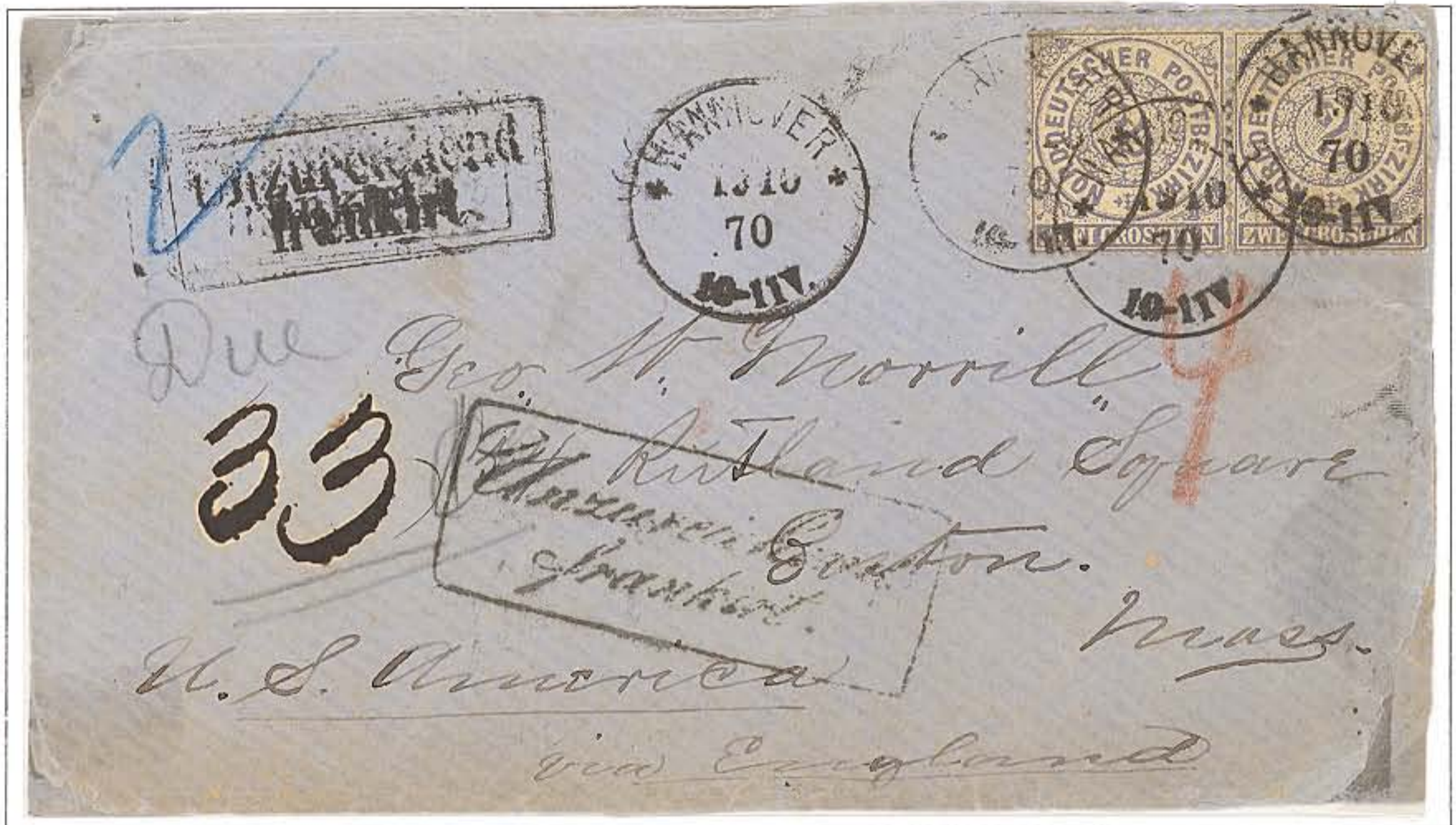
Envelope: Hannover to Boston, 13 October 1870