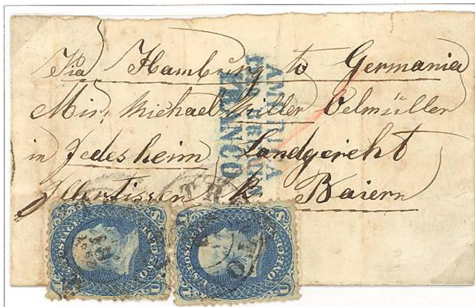
Pamphlet wrapper: Trenton, New Jersey, to Jedesheim, Bavaria, 13 February 1863

1853-1867 2 August 1853-31 December 1867