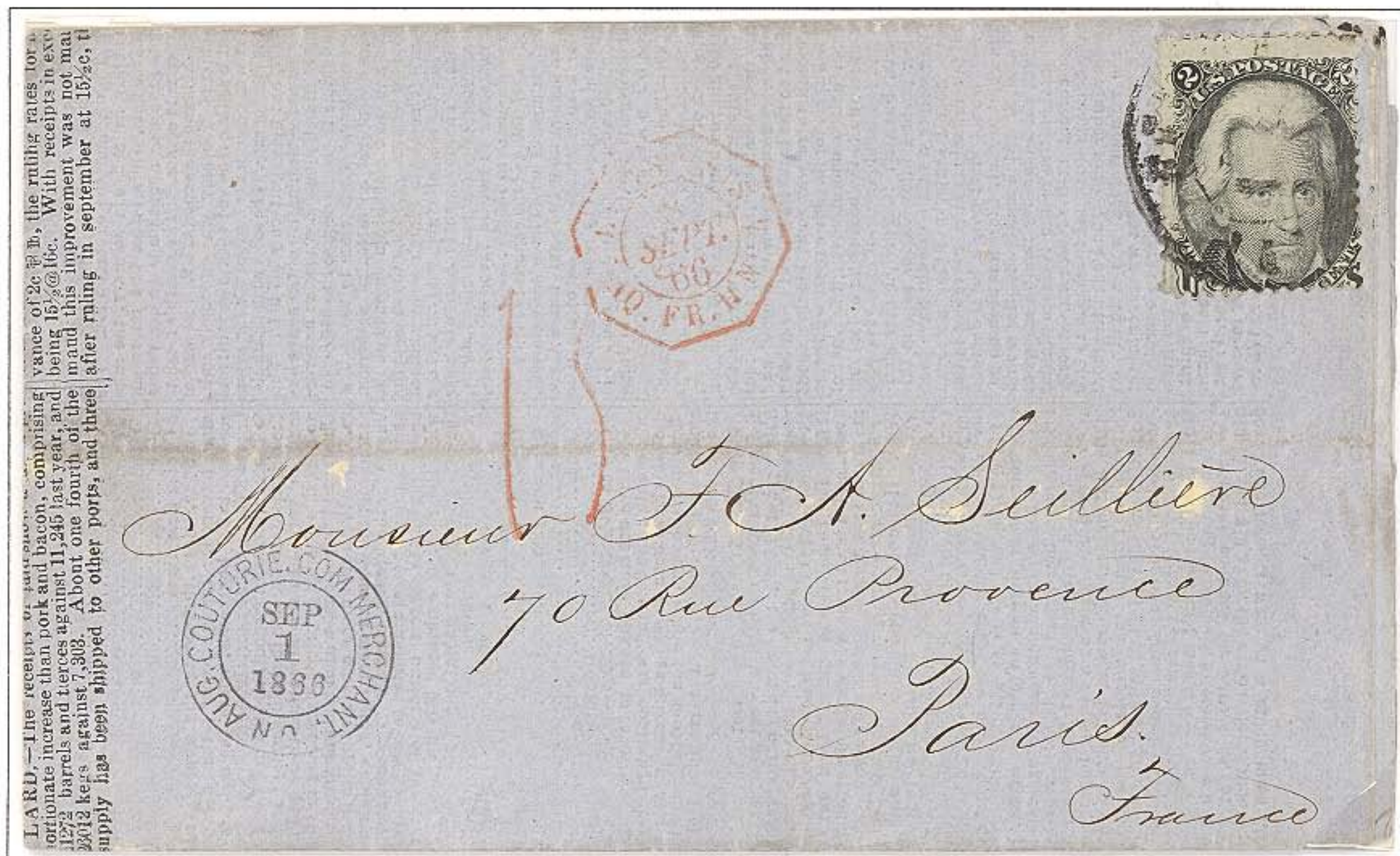
Printed Circular: New Orleans to Paris, 1 September 1866