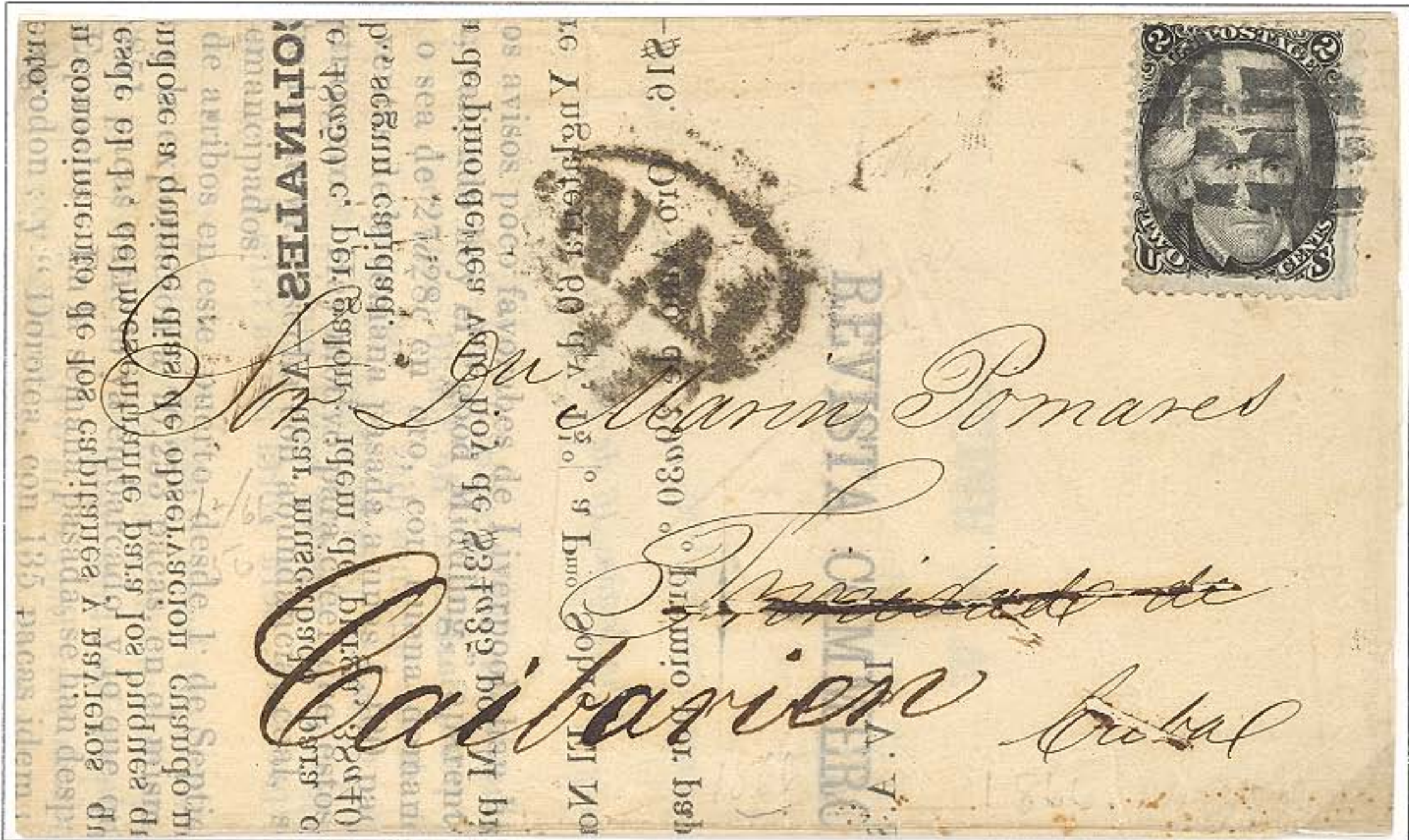
Printed Circular: Charleston, South Carolina to Caibarien, Cuba, 16 April 1866