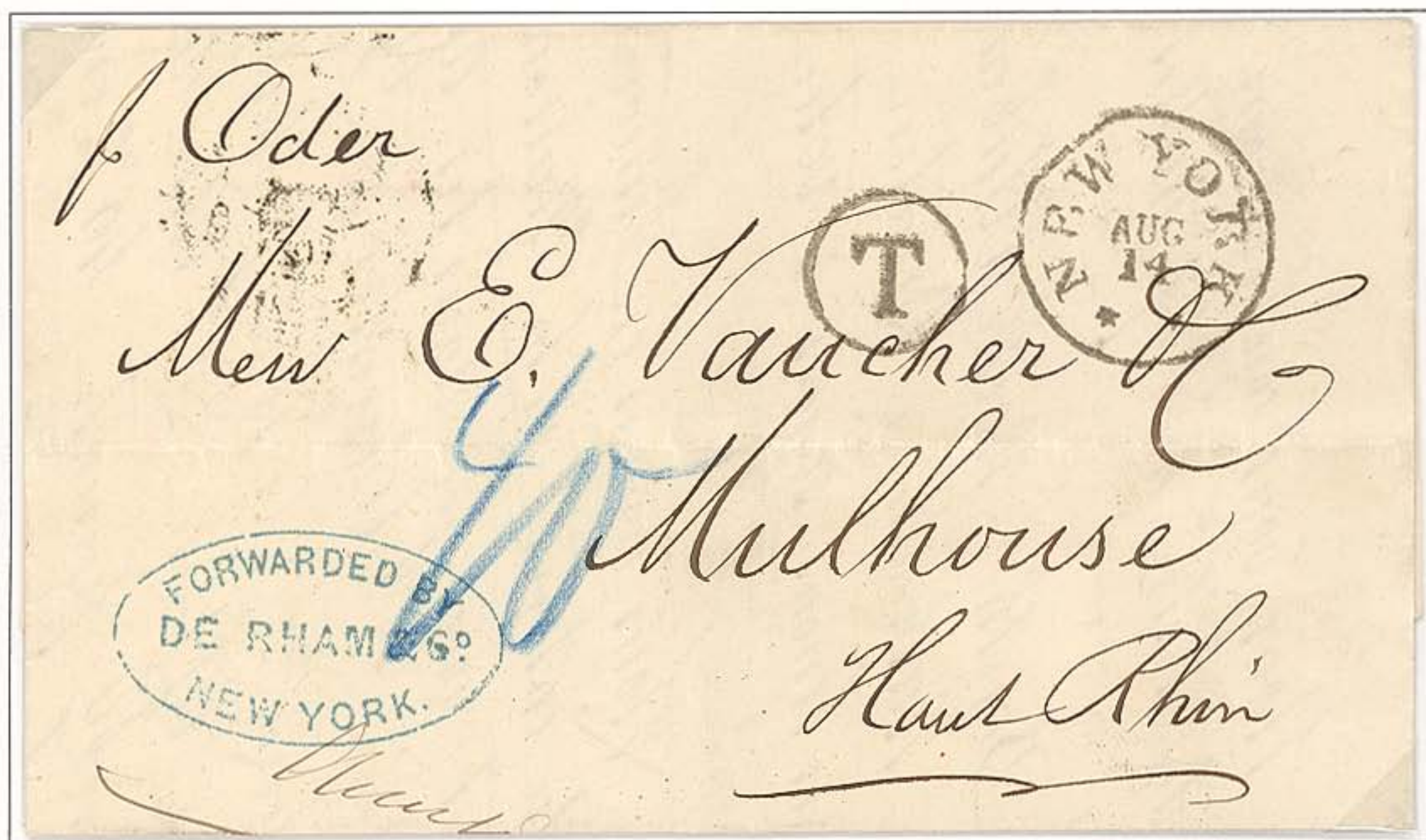
Folded Letter: New York to Mulhouse, Alsace, 14 August 1875

Ship: Oder Company: Norddeutscher Lloyd (North German Lloyd Line) Depart: New York, 14 August 1875 Arrive: Bremerhaven, about 26 August 1875 Rate: --- letter sent unpaid 40 pfennige postage due in Mulhouse