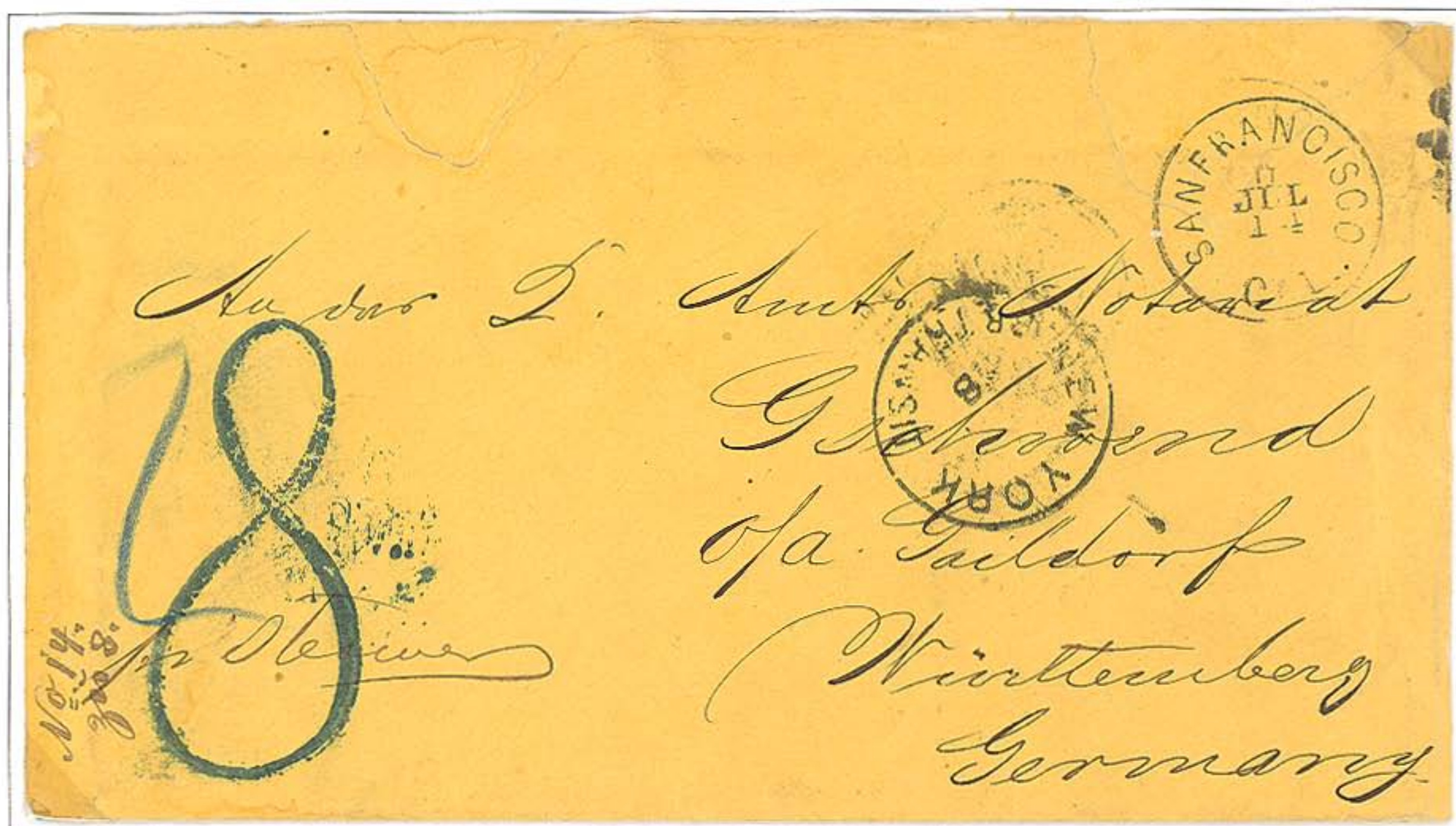
Envelope: San Francisco, California, to Gschwend, Württemberg, 14 July 1868

Ship: City of London Company: Liverpool, New York & Philadelphia Steam Ship Company (Inman Line) Depart: New York, 8 August 1868 Arrive: Queenstown, 18 August 1868 Rate: --- letter sent unpaid 8 silbergroschen postage due marked by Aachen 28 kreuzer postage due in Gschwend Notes: Postage due included 6 sgr NGU closed mail via England rate plus 2 sgr unpaid letter fine. The postage due was marked in the currency of the Southern German states, 28 kreuzer (equivalent to 8 sgr.) by placing a blue crayon "2" to the left of handstamp "8."