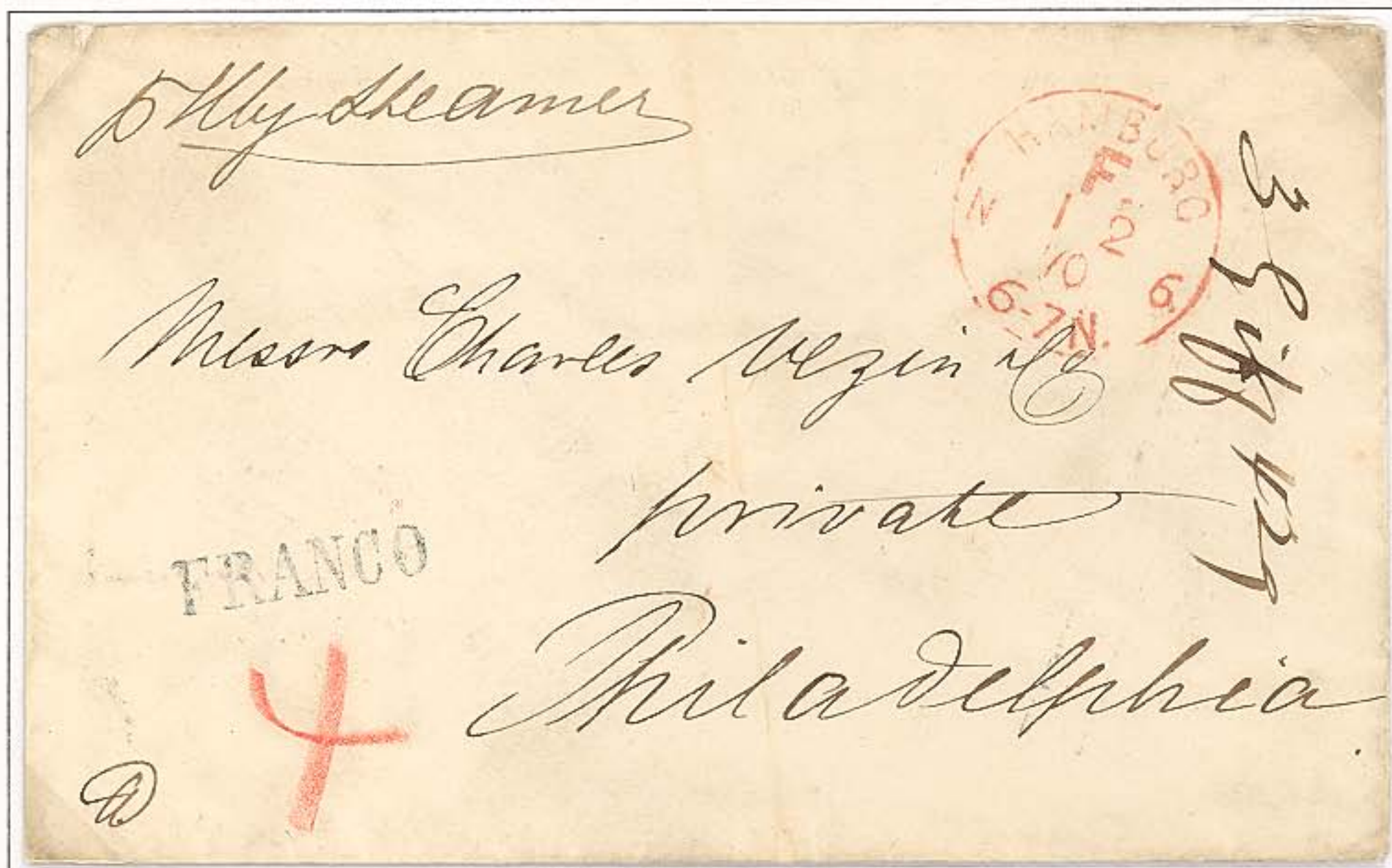
Envelope: Hamburg to Philadelphia, 1 February 1870