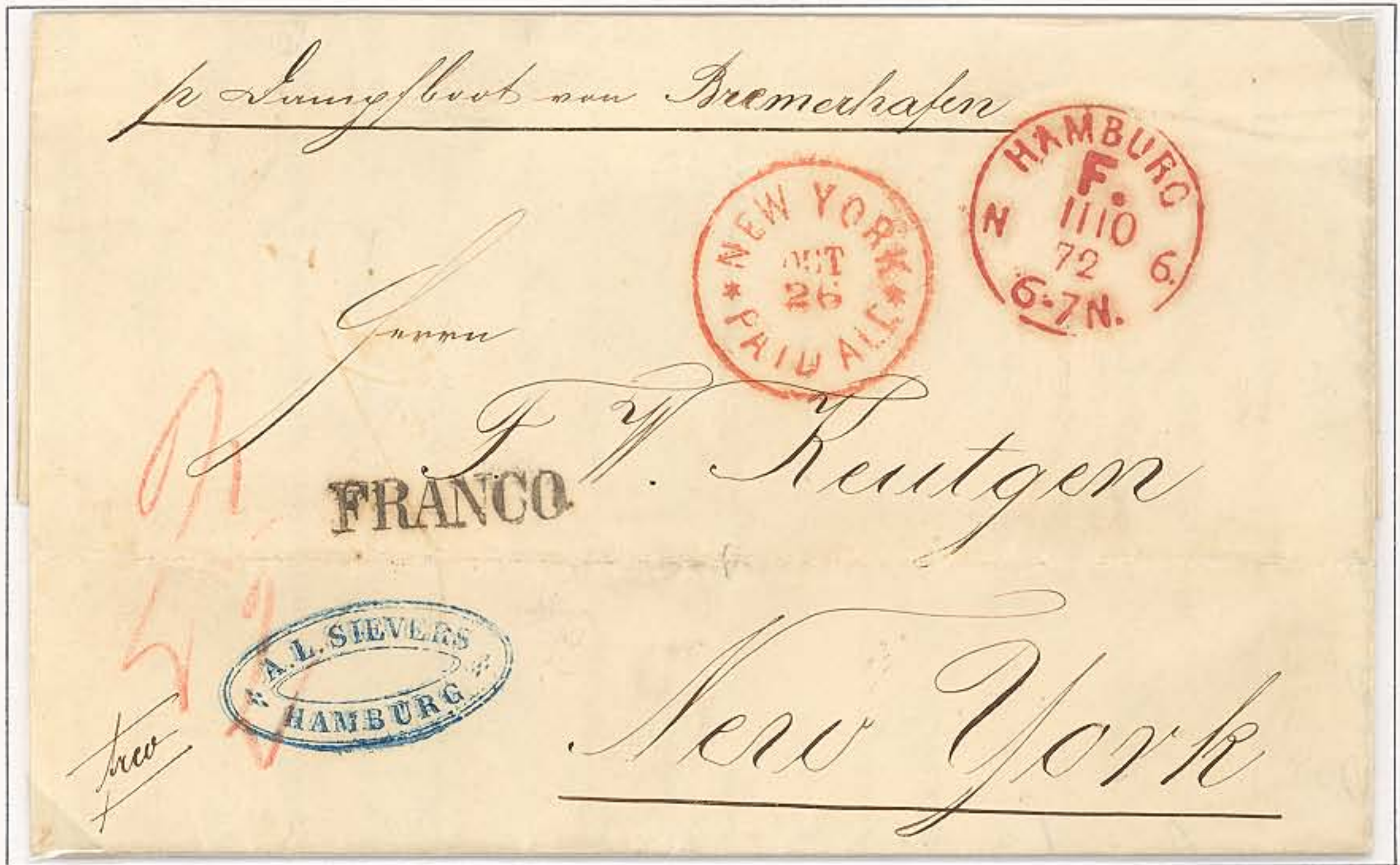
Folded Letter: Hamburg to New York, 11 October 1872

Ship: Deutschland Company: Norddeutscher Lloyd (North German Lloyd Line) Depart: Bremerhaven, 12 October 1872 Arrive: New York, 26 October 1872 Rate: 2½ silbergroschen prepaid for single rate Notes: Letter prepaid for direct packet rate from Bremen to New York. Hamburg "F" circular datestamp was used on letters paid in cash. Hamburg also marked the black handstamp FRANCO to indicate letter fully paid.