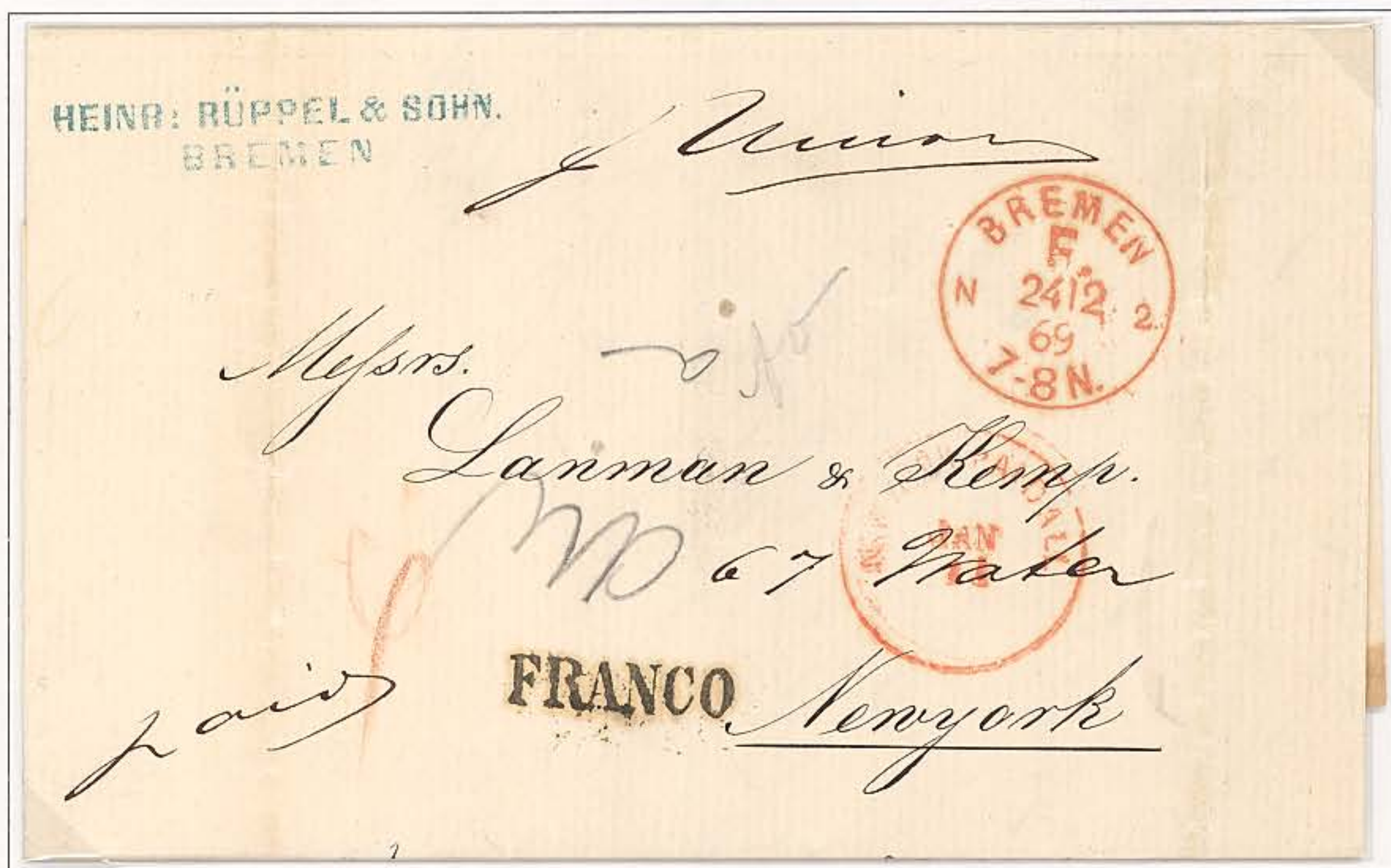
Folded Letter: Bremen to New York, 25 December 1869