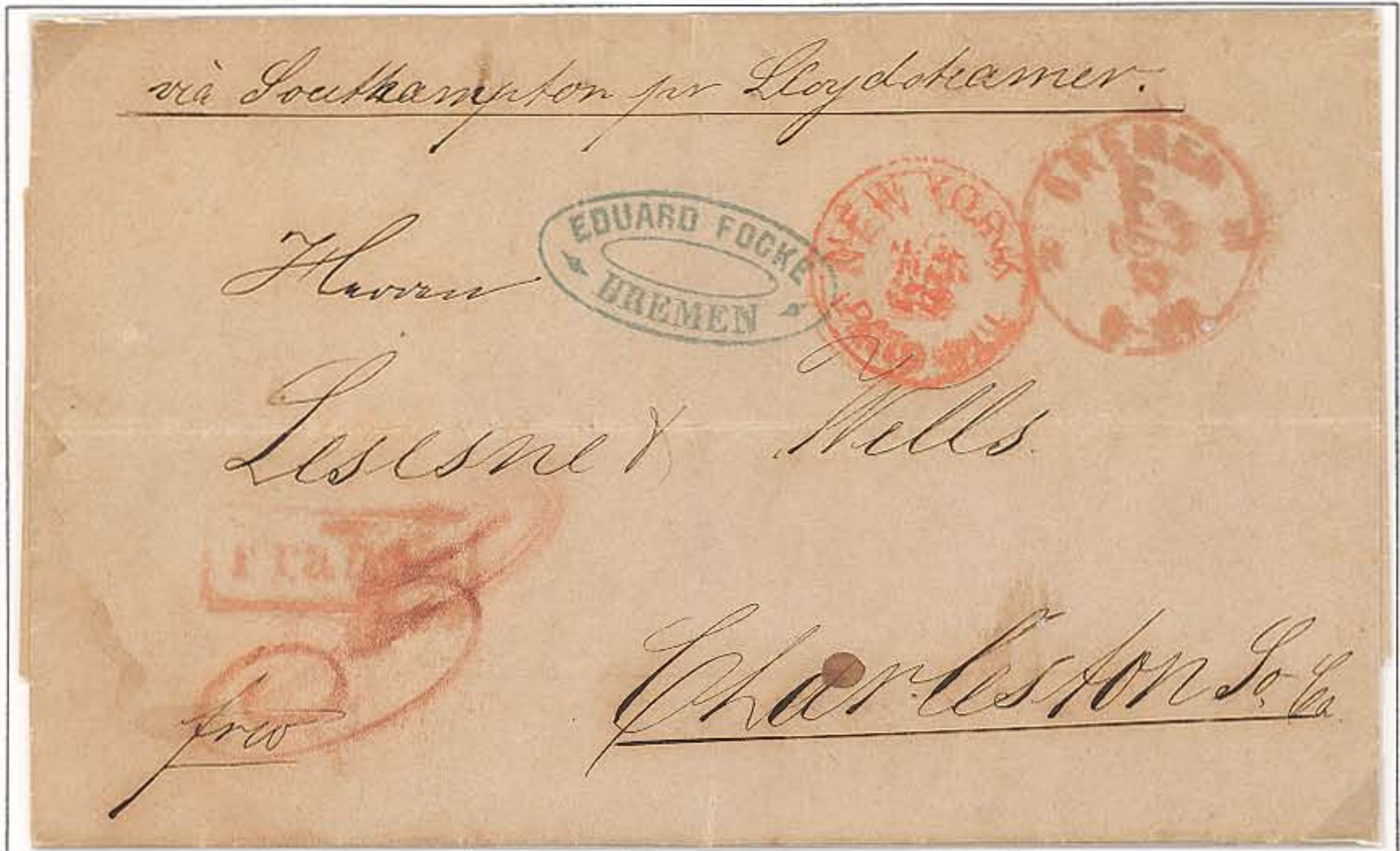
Folded Letter: Bremen to Charleston, South Carolina, 15 March 1873