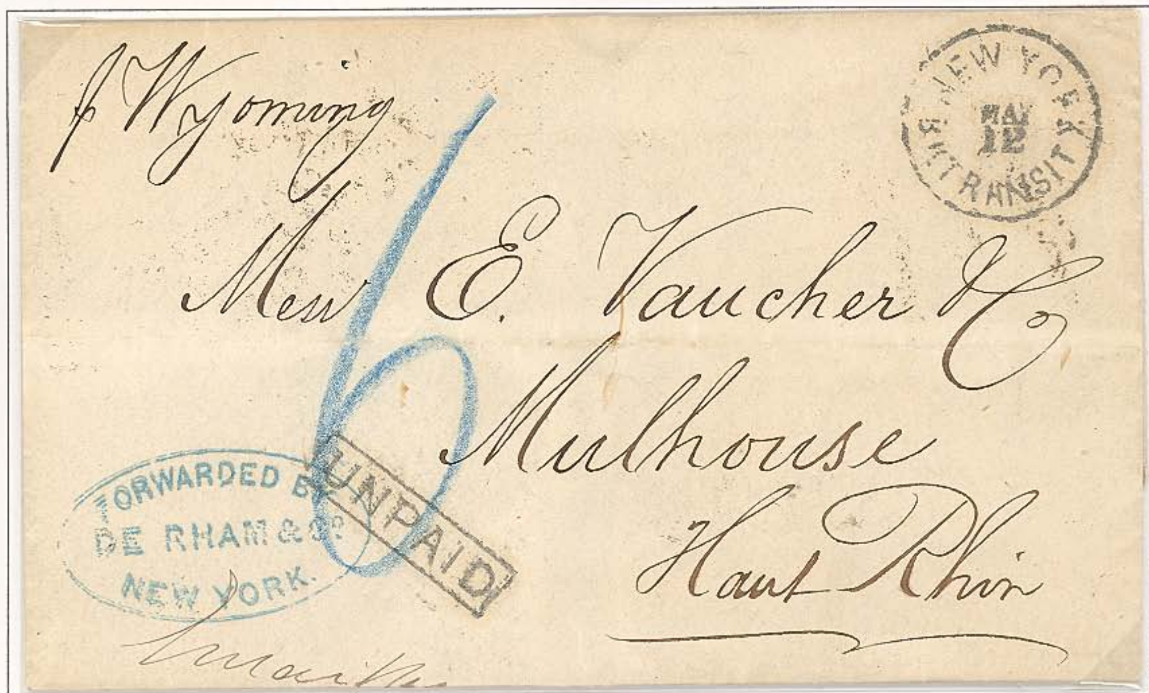
Folded Letter: New York to Mulhouse, Alsace, 11 May 1874