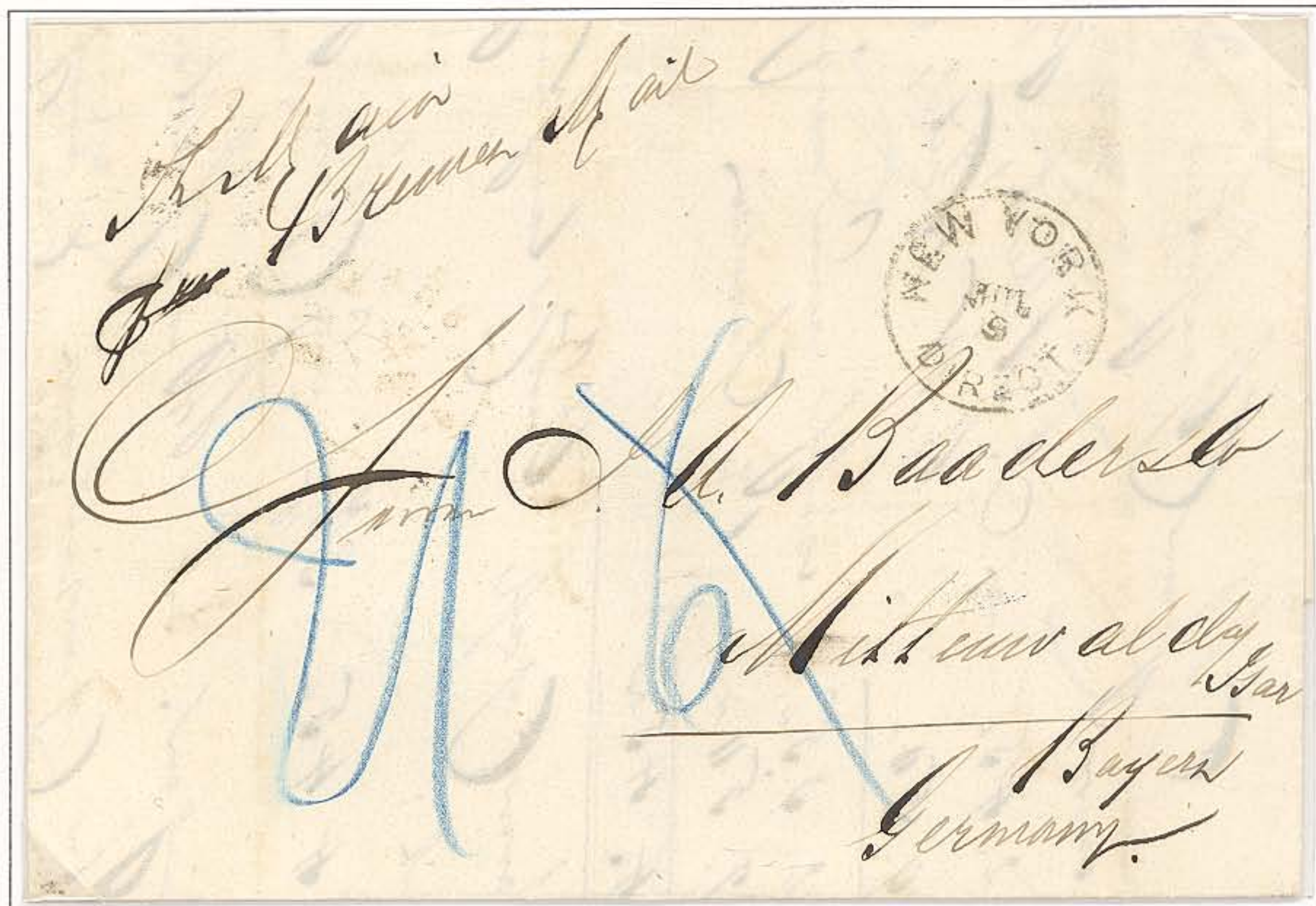
Folded Letter: New York to Mittenwald, Bavaria, 9 July 1870