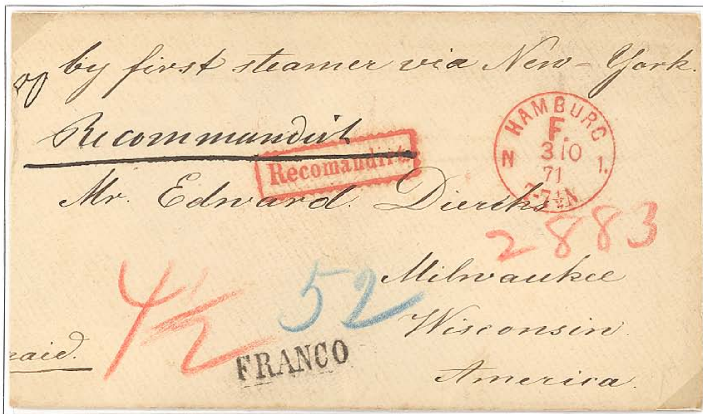
Envelope: Hamburg to Milwaukee, Wisconsin, 3 October 1871