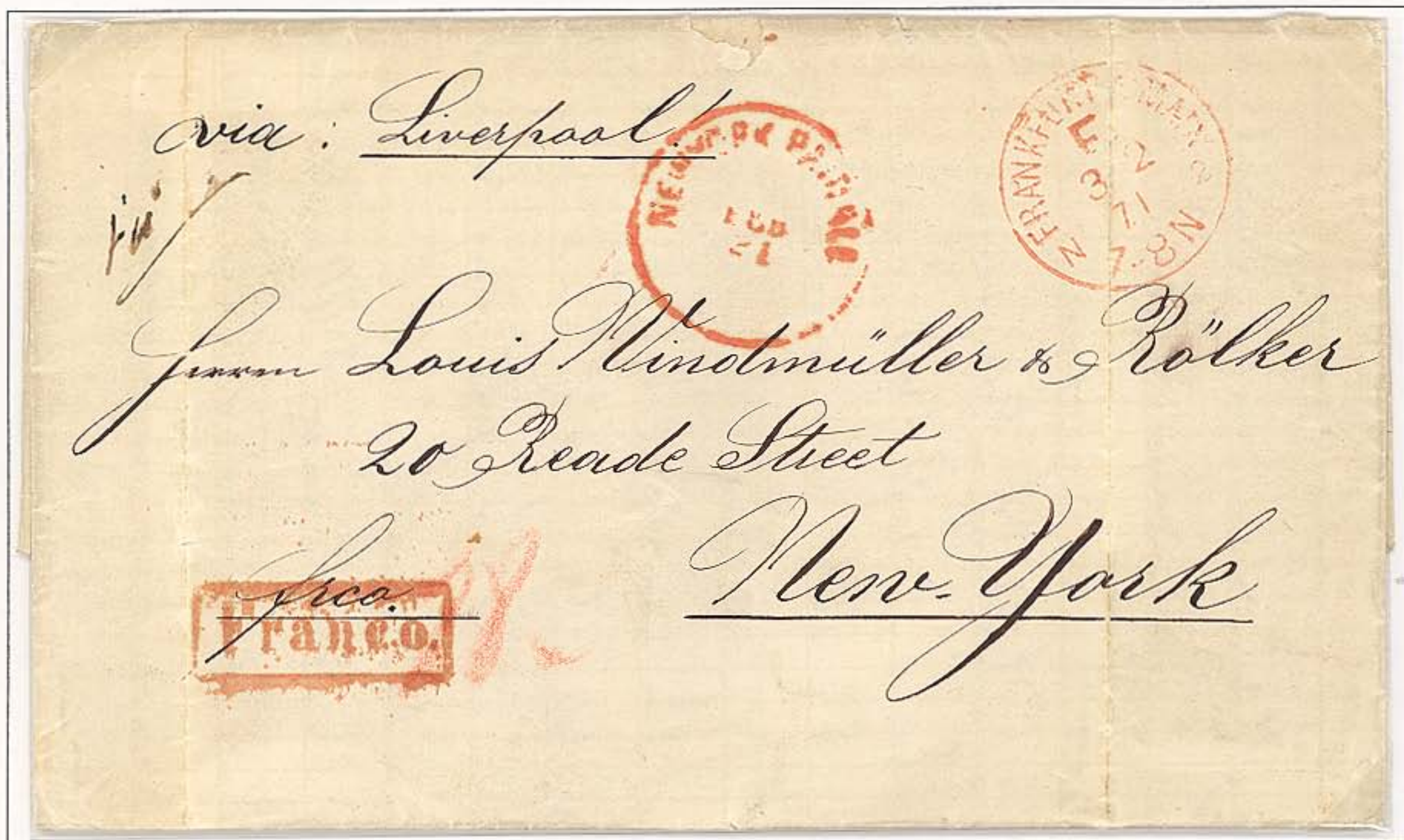
Folded Letter: Frankfurt to New York, 2 February 1871