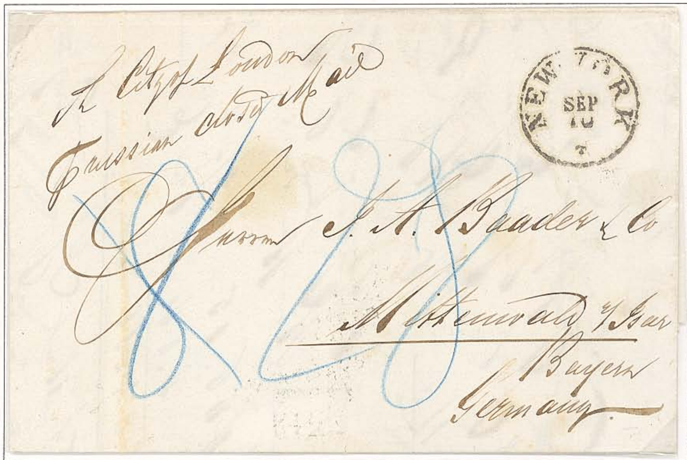
Folded Letter: New York to Mittenwald, Bavaria, 8 September 1870

Ship: City of London Company: Liverpool, New York & Philadelphia Steam Ship Company (Inman Line) Depart: New York, 10 September 1870 Arrive: Queenstown, 20 September 1870 Rate: --- letter sent unpaid 8 silbergroschen postage due in Northern German currency 28 kreuzer postage due in Mittenwald