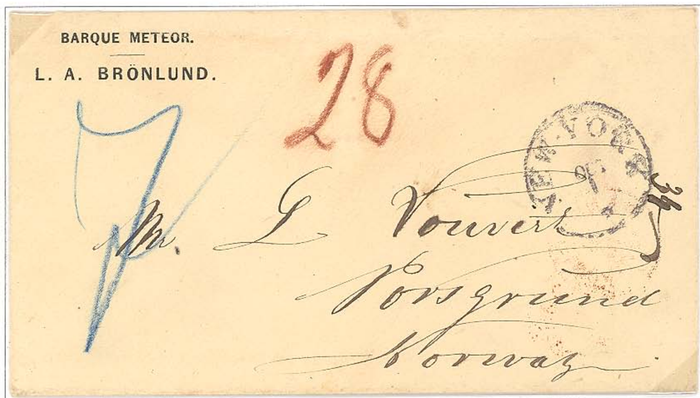
Envelope: New York to Porsgrund, Norway, 1 October 1870