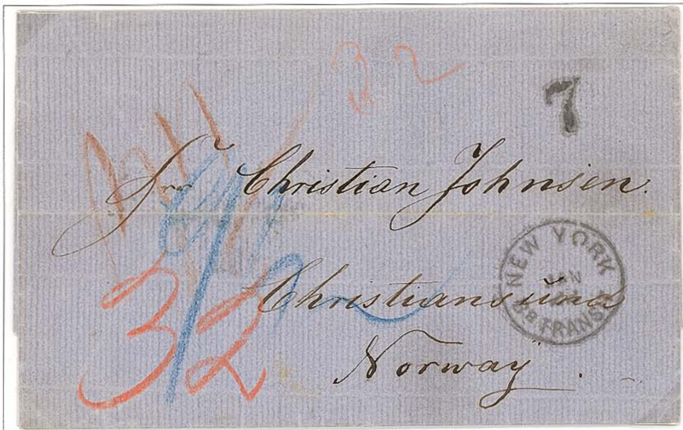
Folded Letter: Havana, Cuba to Christiansund, Norway, 8 January 1873