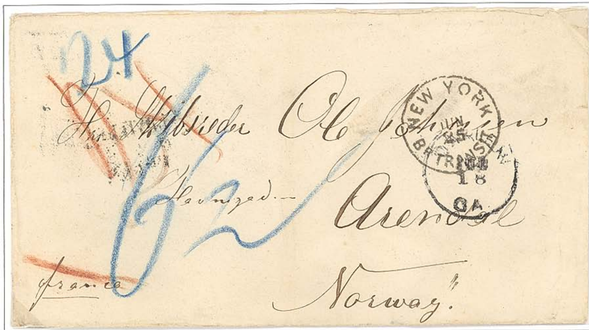
Envelope: Darien, Georgia to Arendal, Norway, 18 June 1873