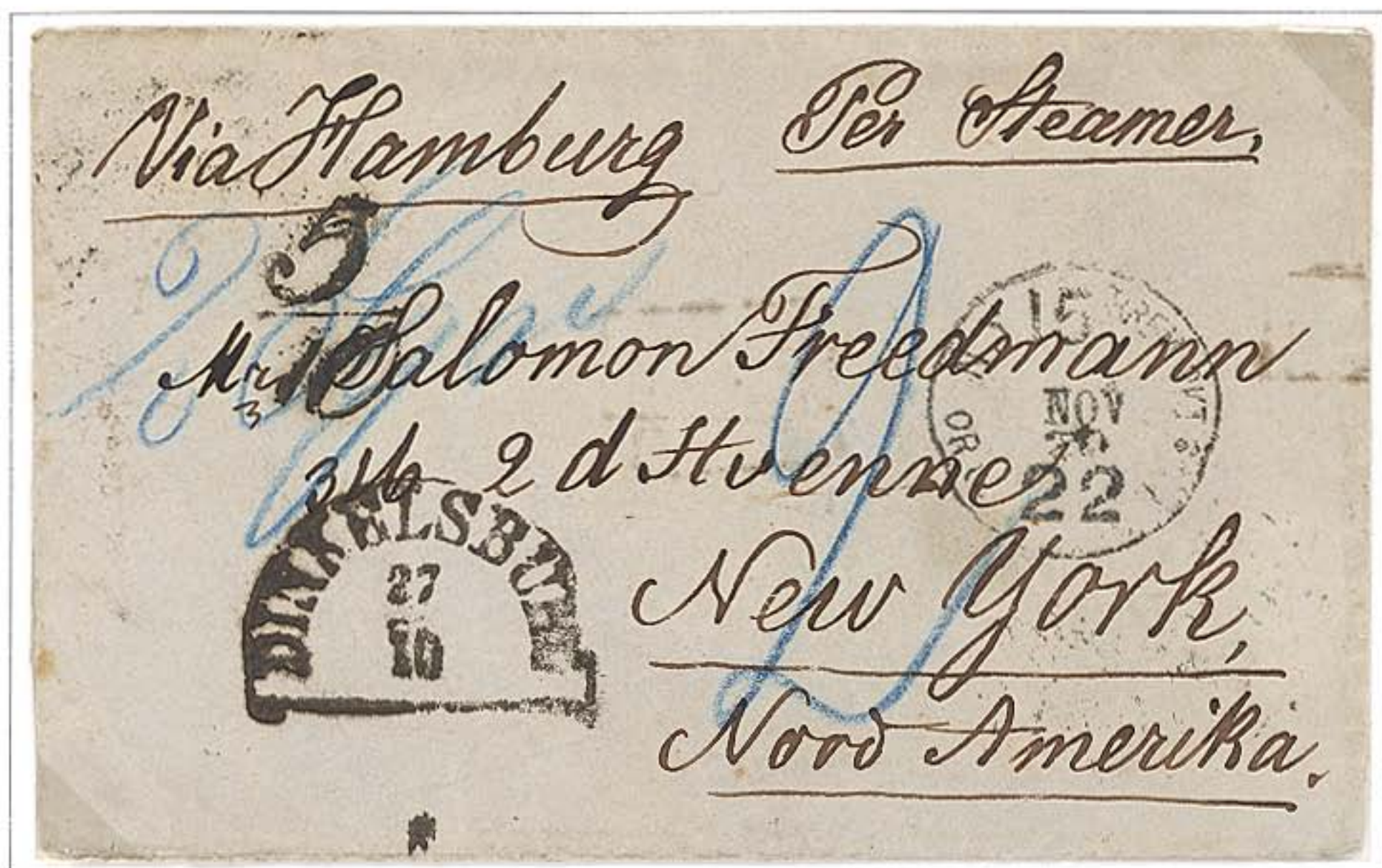
Folded Letter: Dinkelsbühl, Bavaria, to New York, 27 October 1865