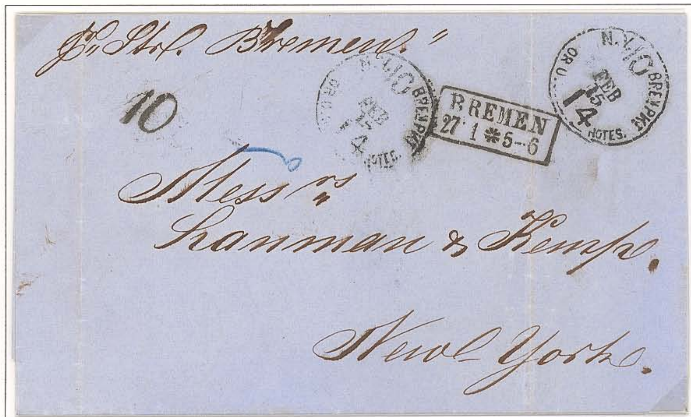
Folded Letter: Bremen to New York, 27 January 1866