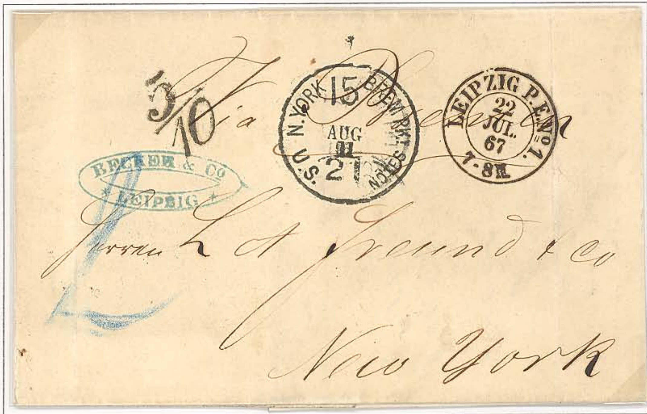
Folded Letter: Leipzig, Saxony to New York, 22 July 1867

Ship: Weser II Company: Norddeutscher Lloyd (North German Lloyd Line) Depart: Bremerhaven, 27 July 1867 Arrive: New York, 10 August 1867 Rate: --- letter sent unpaid 15¢ postage due in coin in New York 21¢ postage due in notes in New York