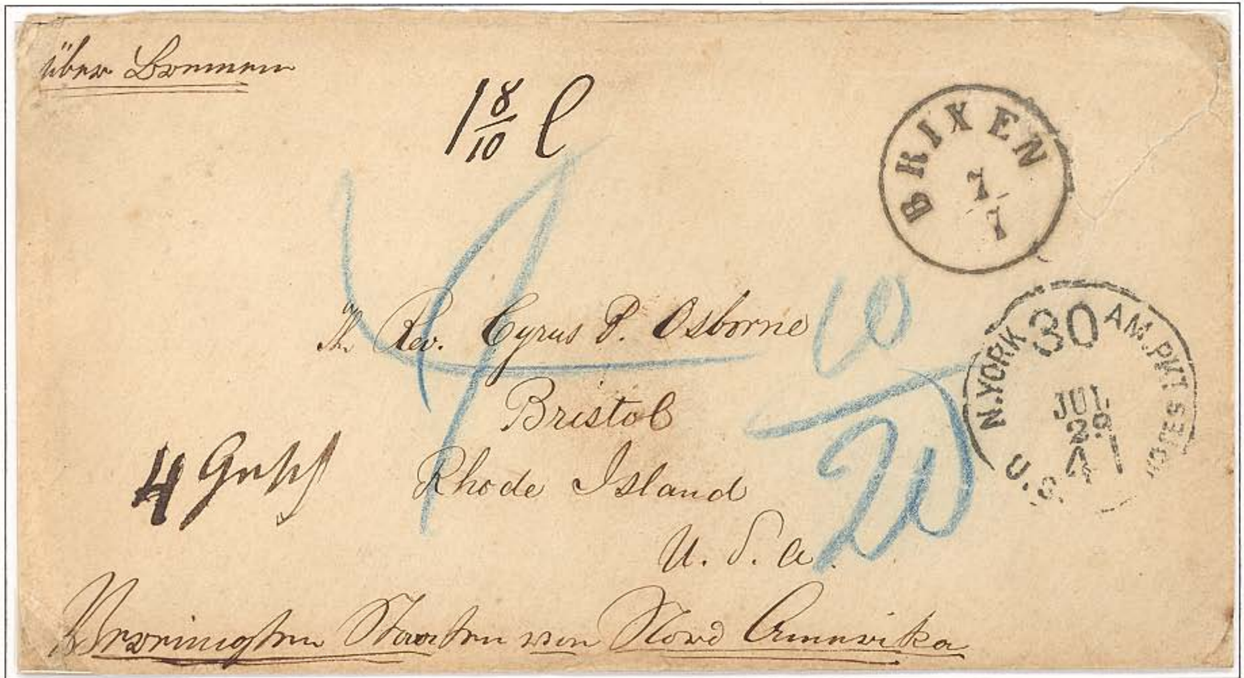
Envelope: Brixen, Austria (Tyrol) to Bristol, Rhode Island, 7 July 1867