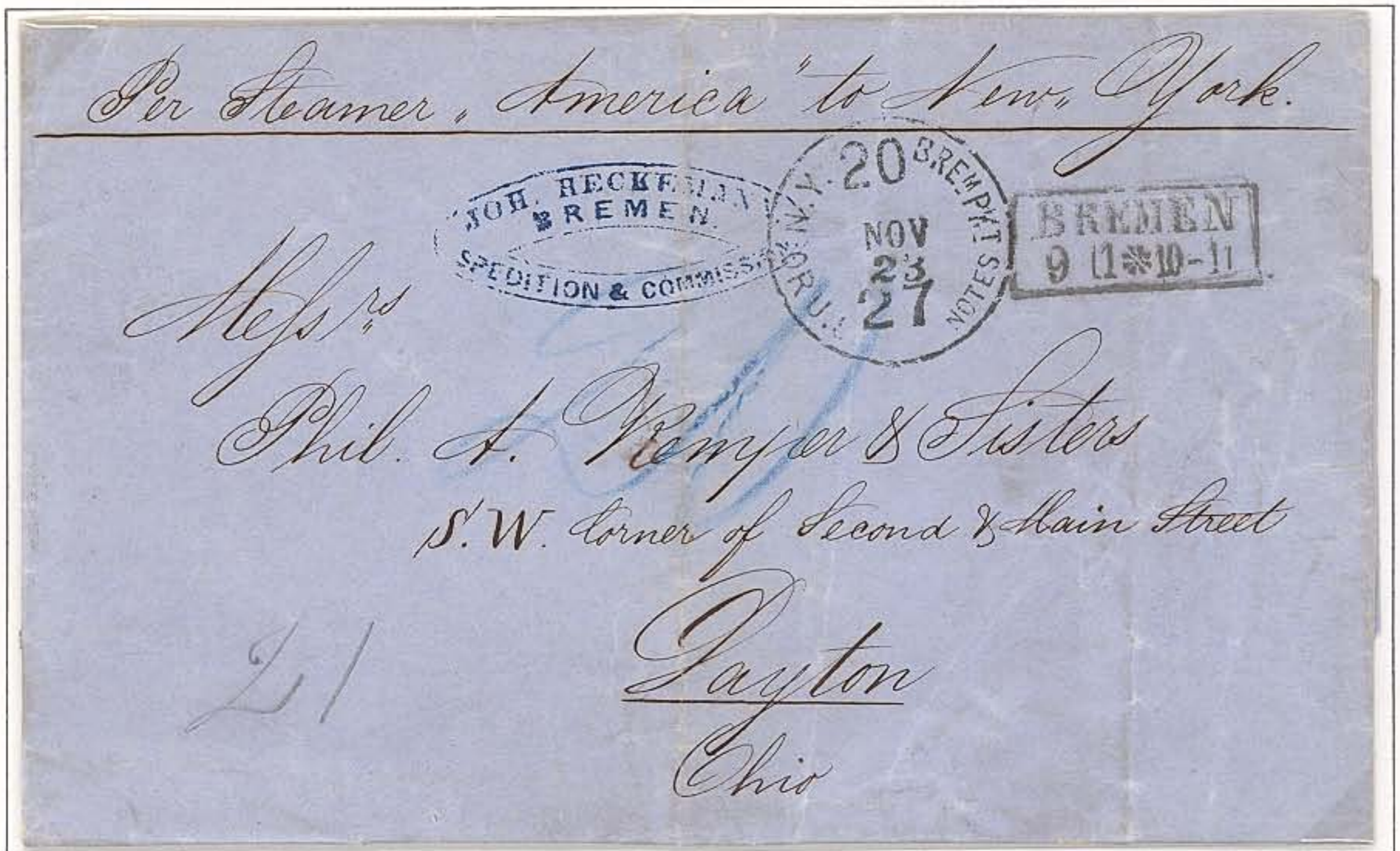
Folded Letter: Bremen to Dayton, Ohio, 8 November 1867

Ship: America Company: Norddeutscher Lloyd (North German Lloyd Line) Depart: Bremerhaven, 9 November 1867 Arrive: New York, 23 November 1867 Rate: --- letter sent unpaid 20¢ postage due in coin in Dayton 27¢ postage due in notes in Dayton Notes: Bremen marked 2x10 = 20 grote unpaid international rate for double rate letter. Pencil "21" in lower left may have been a Dayton letter carrier misreading the postage due marked at New York as 21¢ in greenback currency.