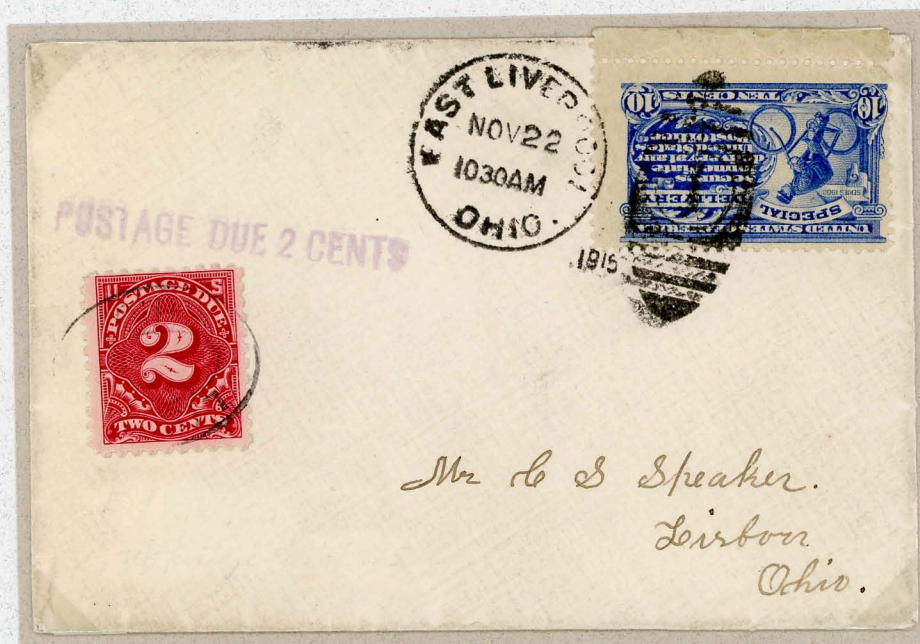
East Liverpool, to Lisbon, Oh., November 15, 1915 Marked 'Postage Due 2 cents'