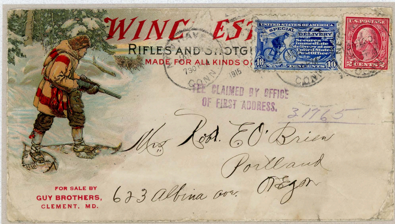
Advertising use with standard fee claim marking