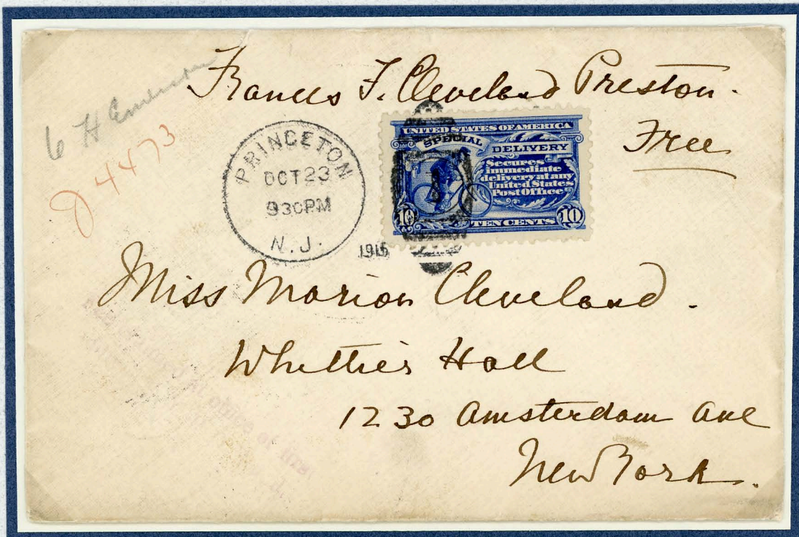
Free frank by Presidential widow, Mrs. Cleveland, Special Delivery fee paid by stamp