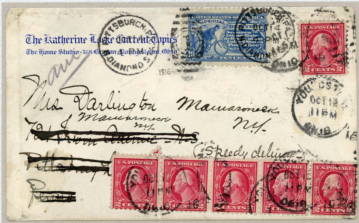
Forwarded 'Speedy delivery' paid by both Special Delivery stamp and regular postage issues