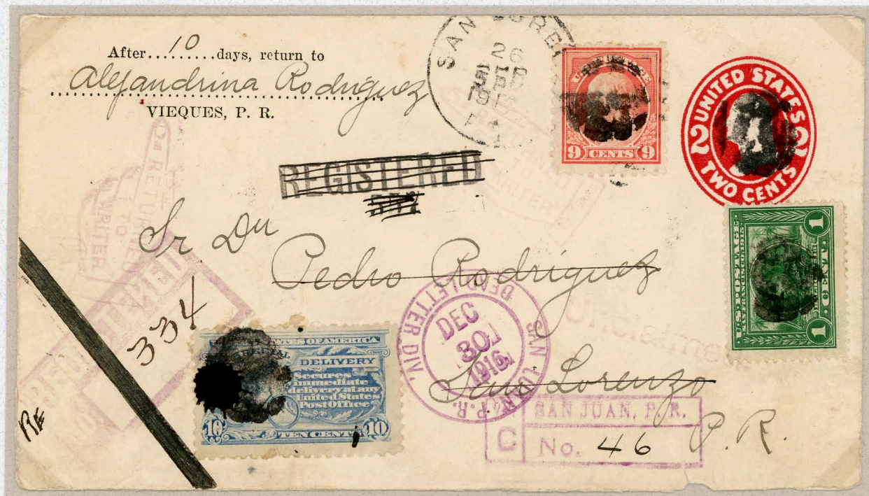
Dead Letter Office 'Unclaimed', registration fee 10¢, less than $25 indemnity