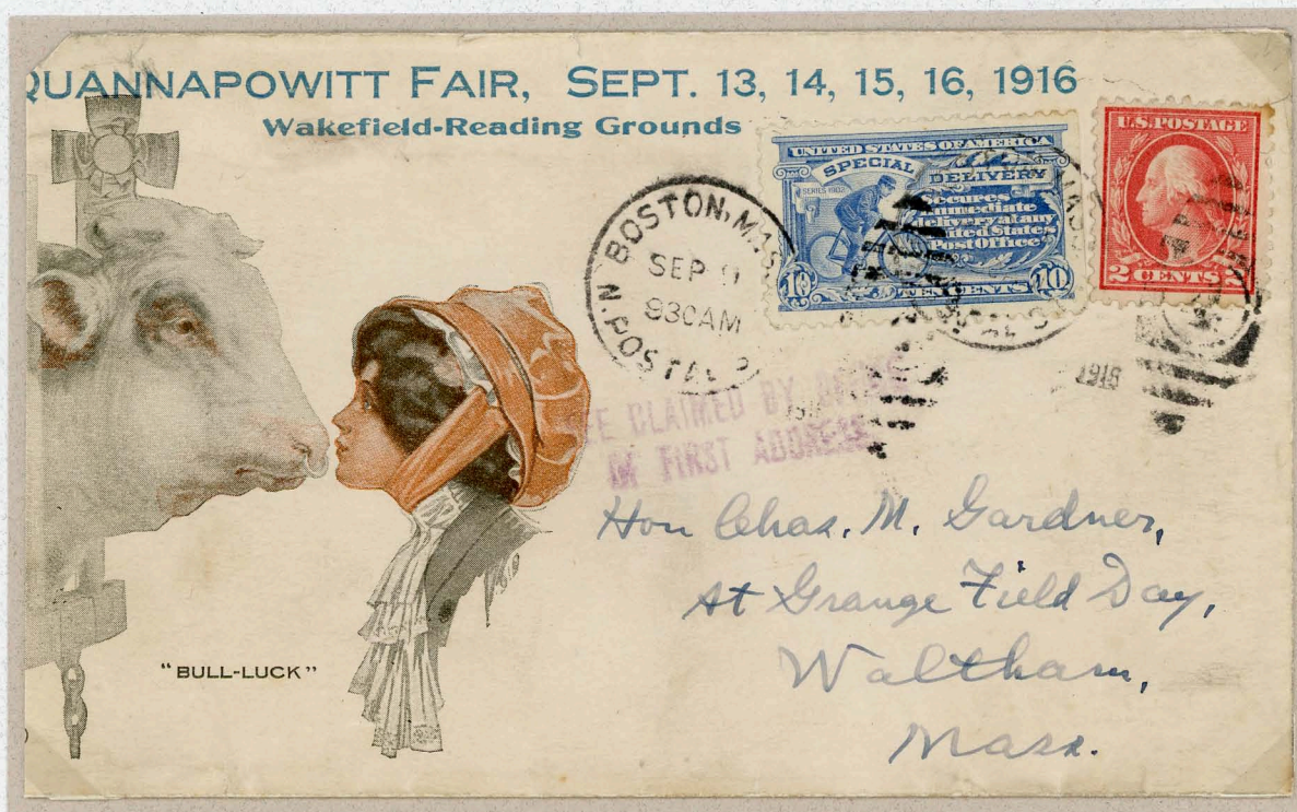
Advertising use with standard fee claim marking to 'Grange Field Day' celebration