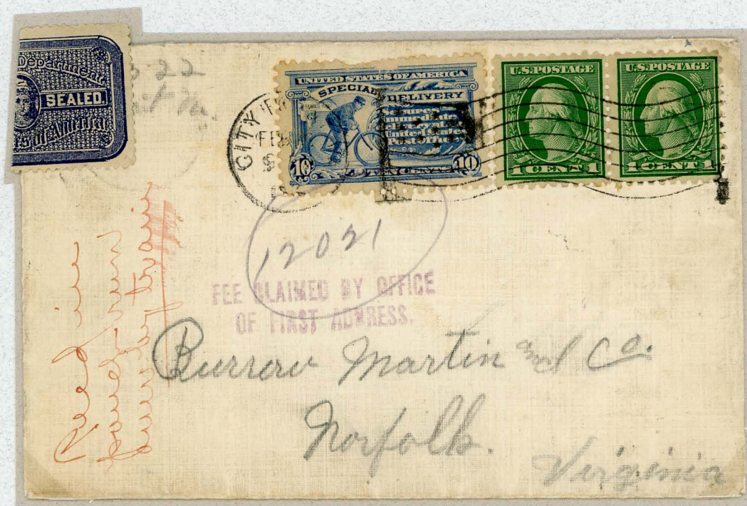
Officially sealed due to script note 'Recd in pouch, run over by train', note wheel lines on cover