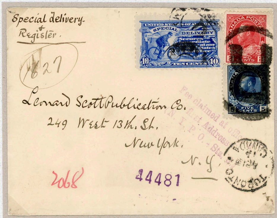
Toronto, Canada to New York, N.Y., April 15, 1915