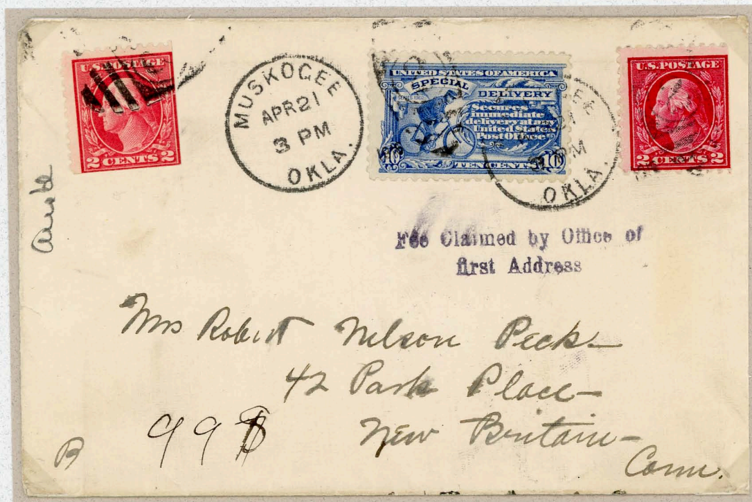
Double weight paid with booklet issues, backstamped April 24, 1916