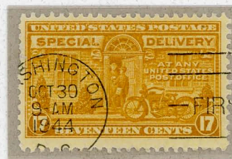
First day of issue