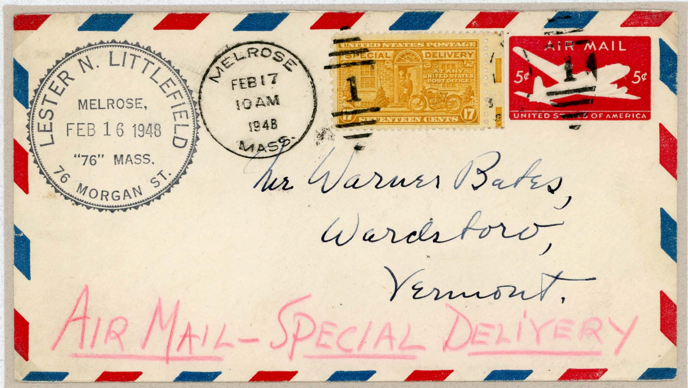
Melrose, Ma. to Wardsboro, Vt., February 17, 1948 5¢ airmail postage, 17¢ Special Delivery fee