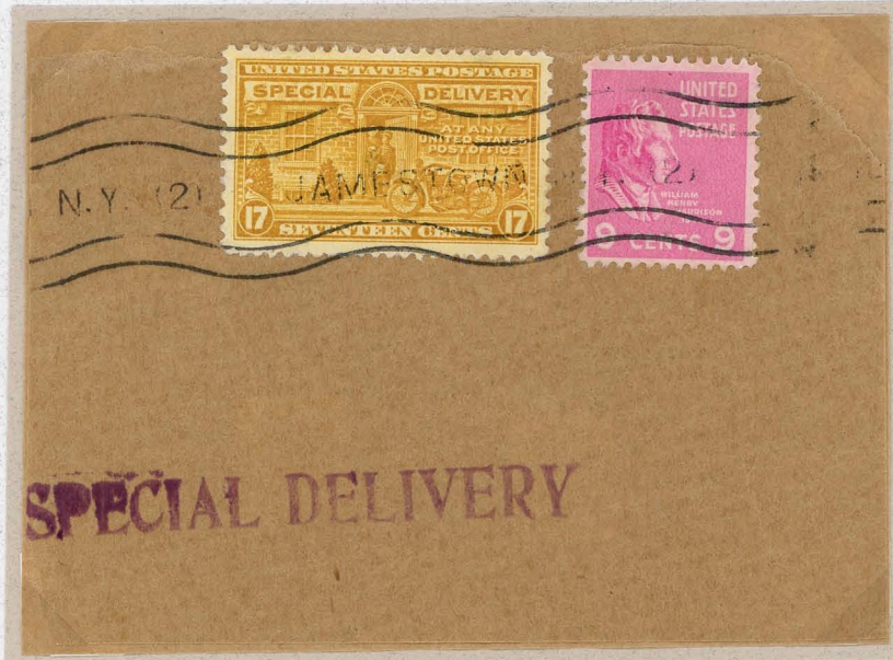
Jamestown, N.Y. Machine roller band device 9¢ 4th class postage 17¢ Special Delivery fee