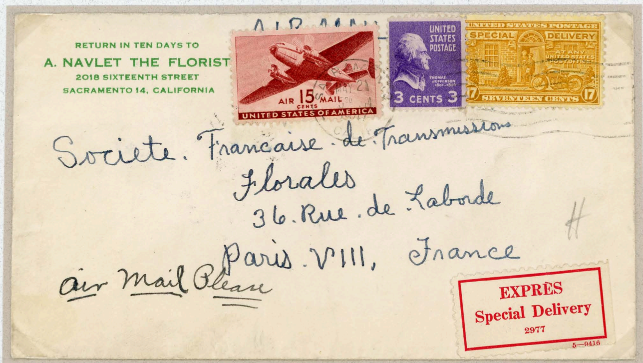
Sacramento, Ca. to Paris, France, May 21, 1947 15¢ airmail postage, 20¢ Special Delivery fee paid with combination 17¢ & 3¢ stamps