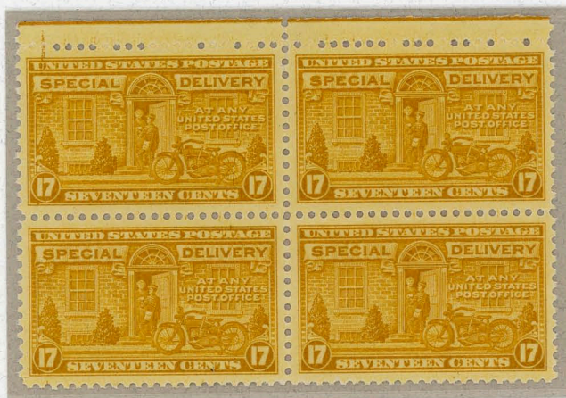
Plate scratch (UL stamp)