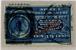
No dots in frame arc