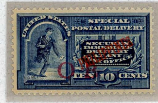
Red, 50 printed