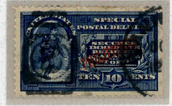
Dots in frame arc