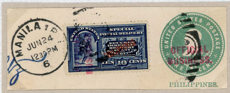
Vertical 'Official Business' overprint on stamp at left