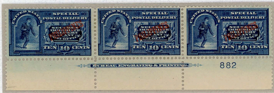
Imprint plate number strip, dots in frame arc