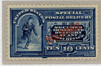
Die variety (lower frame)