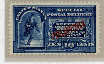
Dots in frame arc