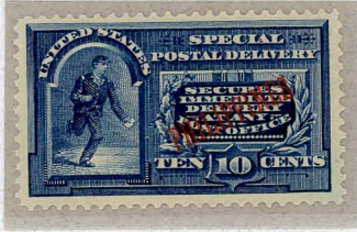
No dots in frame arc