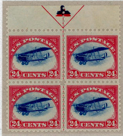
Top arrow block

Between 1918 and 1936, five different combination air mail / special delivery service stamps were issued by the United States Post Office. The Scott catalogue has clearly misnumbered these stamps. The first two air mail stamps of the United States included ten cents for special delivery service; and no additional stamps were required for that purpose. Later, between 1934 and 1936, President Franklin D. Roosevelt designed three additional stamps which also included the ten cent fee for special delivery service in addition to the six cent fee for airmail service.