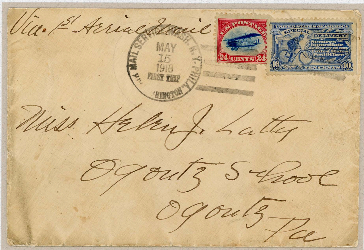
First AirMail Trip, flown from Washington, D.C. to Philadelphia, Pa. and via surface to Ogoutz, Pa. Airmail stamp included Special Delivery service fee, Special Delivery stamp not required