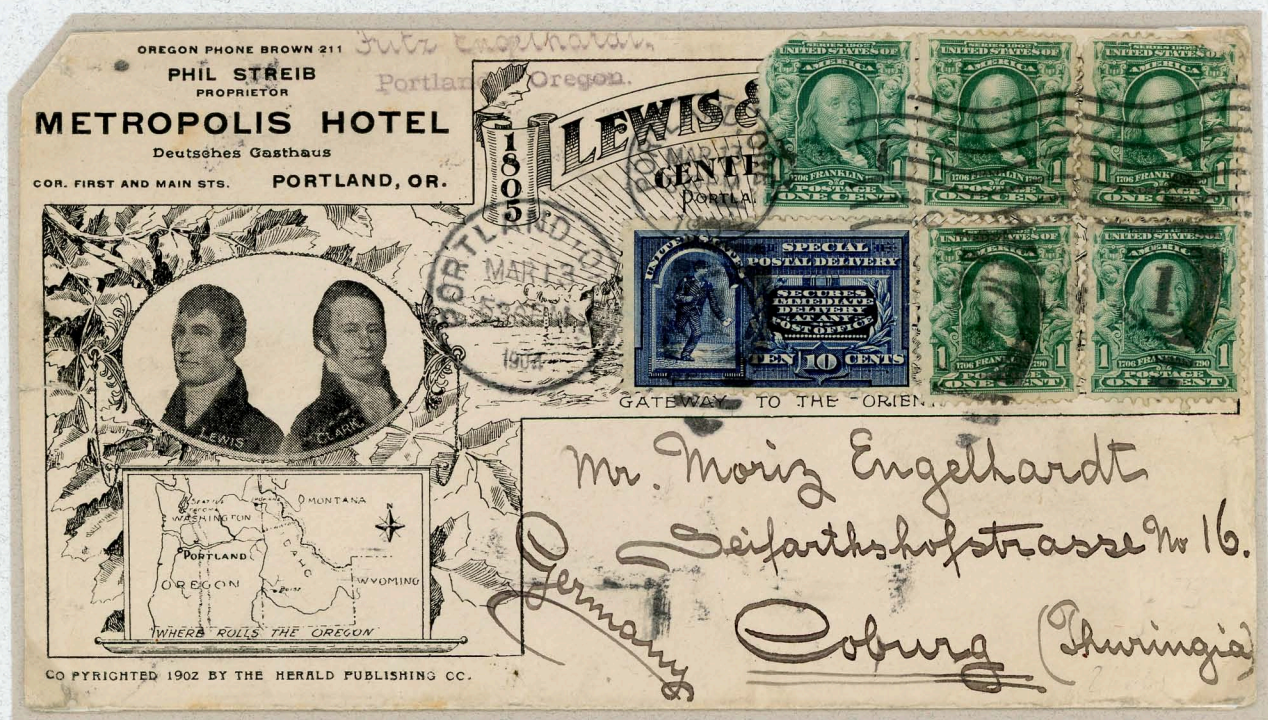
Advertising cover to Coburg, Germany at 5¢ U.P.U. single weight first class rate