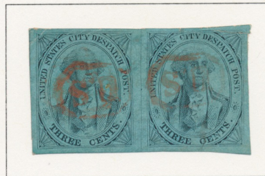
ex Kapiloff, 4L-5L