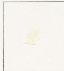
Double impression cert

Plating of 50 varieties on the plate of two 5x5 panes was first completed by Elliott Perry before 1950 and published posthumously in The Penny Post by Calvet Hahn in 1996. Used multiples are possible on letters over a half ounce, on registered letters, or on letters where adhesives were used to pay inter-city government postage. The first two possibilities are unrecorded.