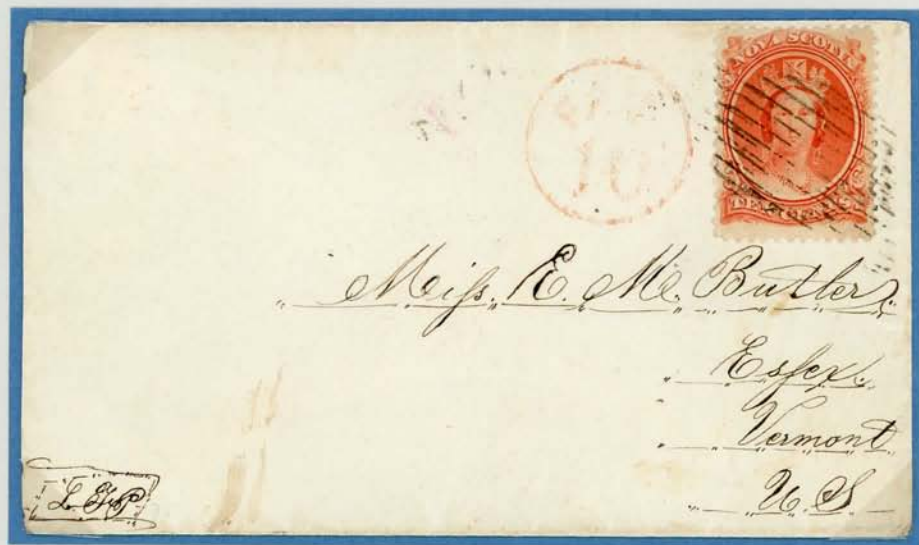
17th September 1863, 10c. on cover from Locks-Island via Shelburne, Yarmouth, Digby to Vermont. Red « PAID 10 » in circle.