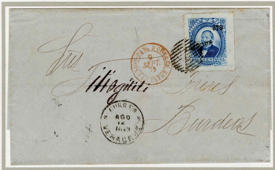
VERA CRUZ TO BORDEAUX, FRANCE VIA FRENCH PACKET AUGUST 12, 1879

CIRCULAR NUMBER 5 FROM THE GENERAL POST OFFICE MANDATED THE USE OF GRID CANCELS ON THIS ISSUE FOR THE 53 LARGEST POST OFFICES. THE TWO AUTHORIZED GRIDS ARE SHOWN ABOVE. THE DIRECTIVE WAS NOT ALWAYS OBSERVED.