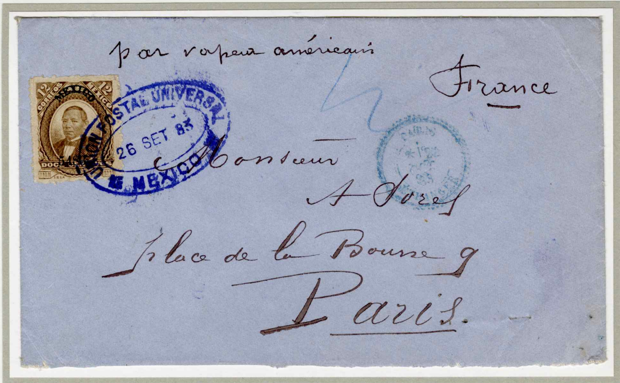
MEXICO CITY TO PARIS, FRANCE SEPTEMBER 26, 1883 U.P.U. COMMEMORATIVE CANCEL