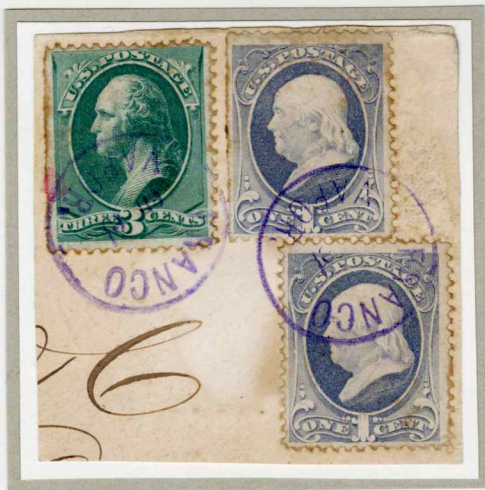
FRANCO EN VAPOR (STEAMSHIP) ON U. S. STAMPS (PORT OF MAZATLAN)