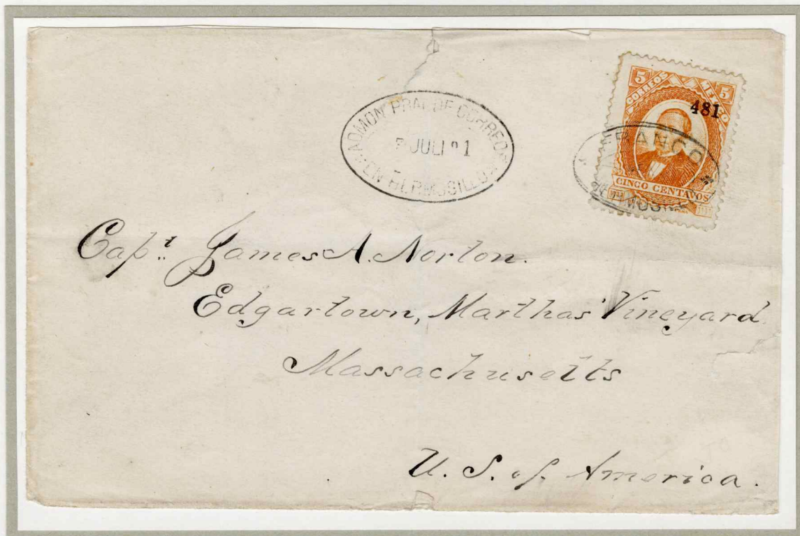
HERMOSILLO TO EDGARTOWN, MASSACHUSETTS JULY 5, 1881