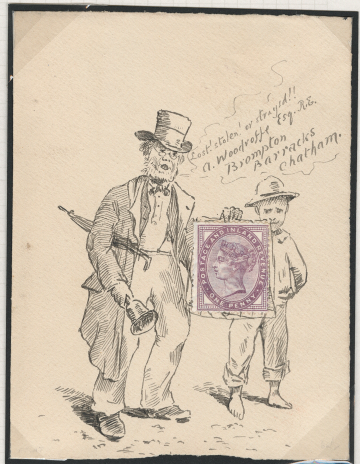
Two unmailed fronts, the first with a very amusing illustration.