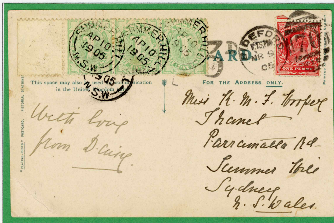
3 x 1d Green; p. 12x11; Wm Crown/NSW Similar postcard as above from Bideford, England to Summerhill, NSW. Card franked similarly as above but this time post office charged Commonwealth letter rate (2 1/2d) for postcard (because card contains writing?). Deficiency plus fine (3d) (as indicated by black '3D' handstamp) paid with three precancelled 1d dues (note incomplete cancellations on stamps similar to cancellation on card under dues) dated 10 April 1905.