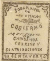
Postage and revenue 50 centavos