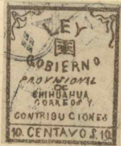
Postage and revenue 10 centavos

The oval one is illustrated in Moens 1892 and three values are listed.