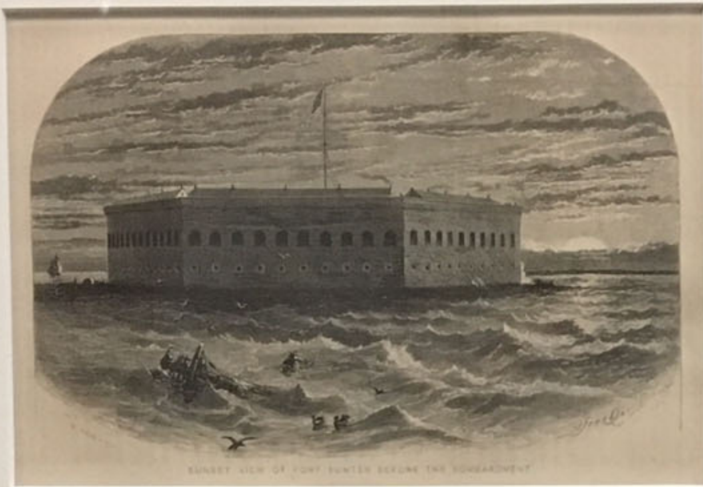
SUNSET VIEW OF FORT SUMTER BEFORE THE BOMBARDMENT