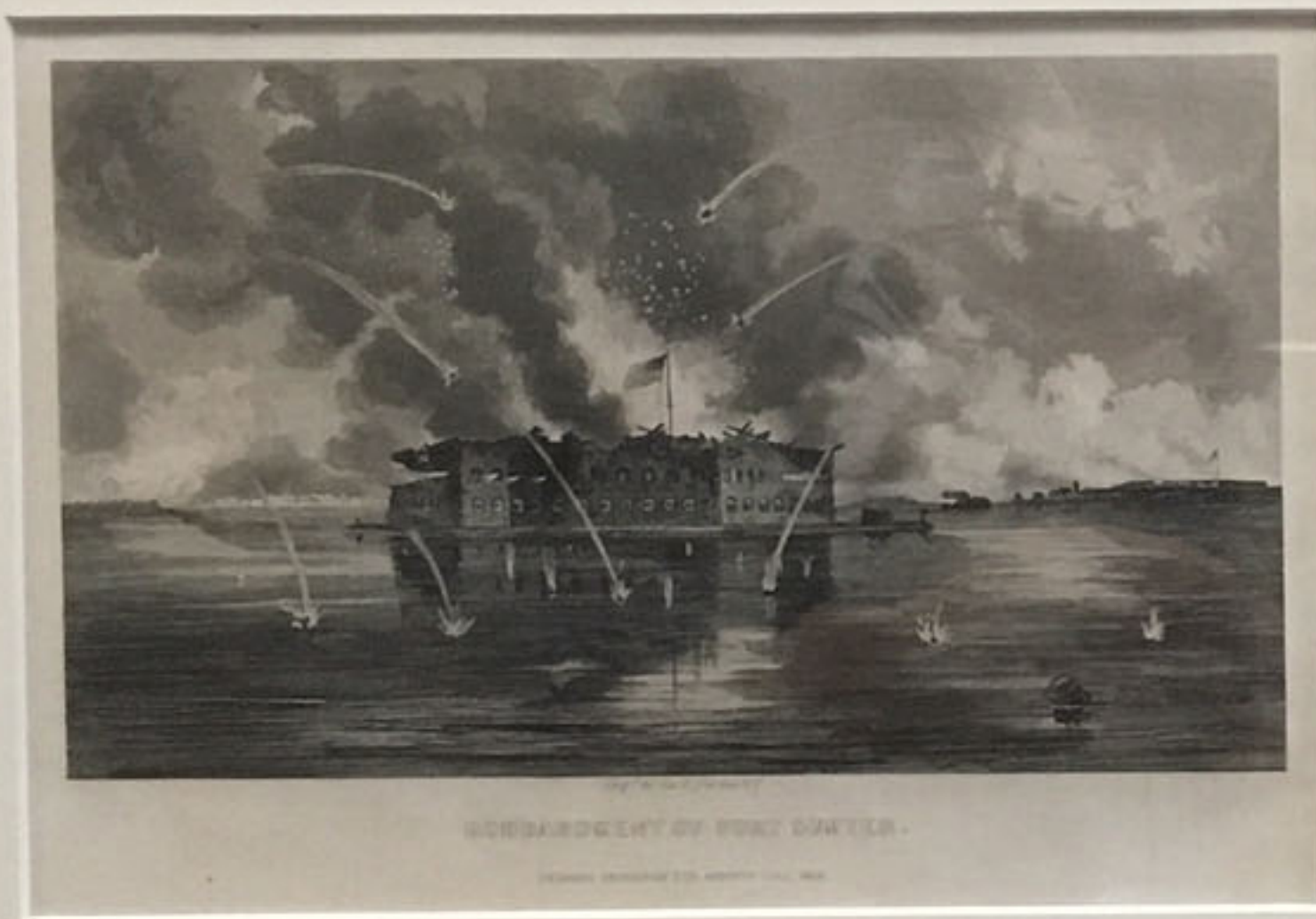
BOMBARDMENT OF FORT SUMTER