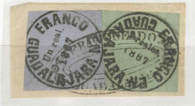
1r Blue Wove 3rd Period and 2r Quadrille 2nd Period. Guadalajara thin oval (c).