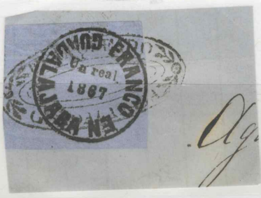
1 real Blue Oblong Quadrille 3rd Period (c)