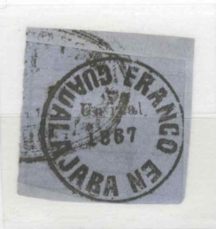
1r Blue Wove Guadalajara oval