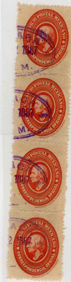
Guadalajara. Only multiple known, as non-denominational multiples seemed unnecessary