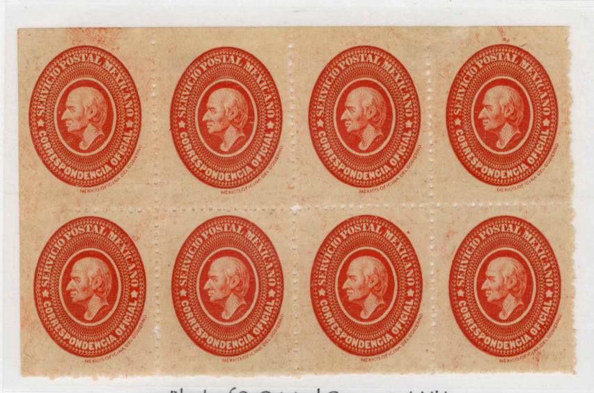
Block of 8 Original Gum, most NH.

The Bright Red's was the very first Mexican official. The stamp design and color is clearly visible on the back. Paper is vertical grain, hard paper. The earliest recorded cover is dated October 11, 1884. The latest is January 2, 1888