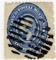
San Antonio Leon Vire