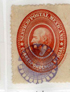
Paso del Norte