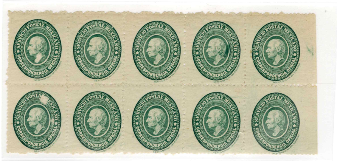
Large Block of 10. OG and mostly NH

The Blue Green's earliest recorded cover is dated August 11, 1893. The latest is November 20, 1894.