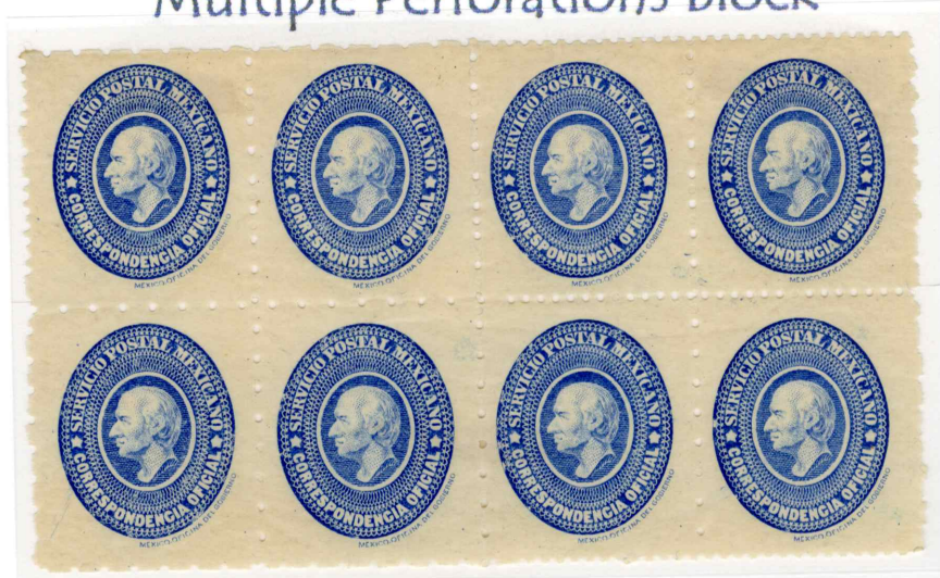
Very scarce block of 8 showing all the possible perforation varieties: 11 x 11, 5 1/2 x 5 1/2, and combination of both. OG.