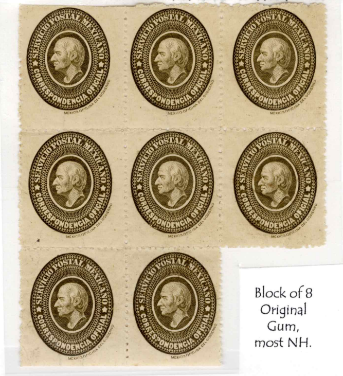
Block of 8 Original Gum, most NH.

The Olive Brown's earliest recorded cover is dated October 7, 1887. The latest is May 28, 1893.