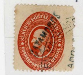
Only this district overprint is known on official stamps