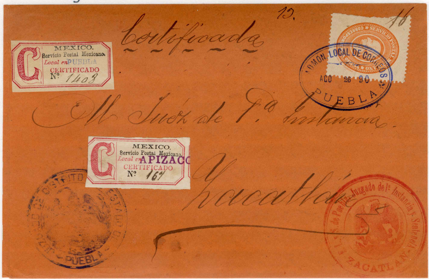
Puebla to Zacatlan. Sent on August 26, 1890. Transit certification labels from Puebla and Apizaco. The later one very uncommon. It carried Judiciary documents. Red cachet from the Zacatlan Court house.