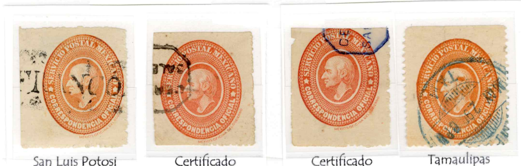
San Luis Potosi