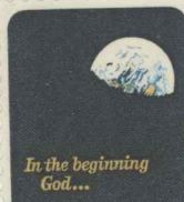
In the beginning God...