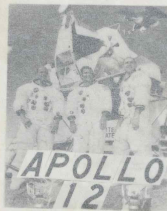
USS HORNET PICKS UP APOLLO 12 MOON MEN CONRAD, GORDON & BEAN