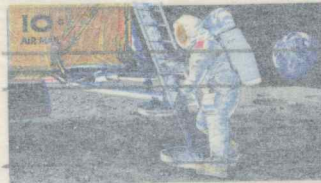
FIRST MAN ON THE MOON