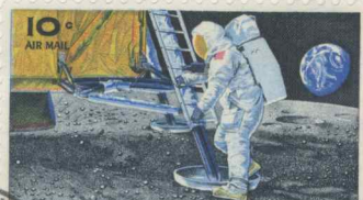
FIRST MAN ON THE MOON