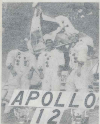
USS HORNET PICKS UP APOLLO 12 MOON MEN CONRAD, GORDON & BEAN