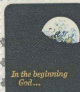
In the beginning God...