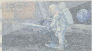
FIRST MAN ON THE MOON