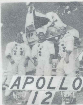
APOLLO 12 DESTINATION MOON