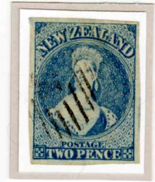
deep steel blue