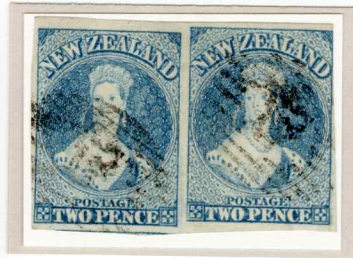
pale blue R. 1/3-4