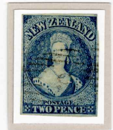
dull deep blue

The earliest stages of plate wear are seen as weakness in the design to the right of the Queen's head. Over the next year, the wear extended evenly over the entire design.