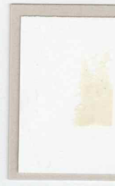
re-entry R. 14