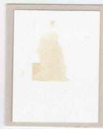
deep shade Auckland & London cancels