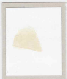
serrated 16-18 at Nelson obliterator '15' used at the Nelson post-office