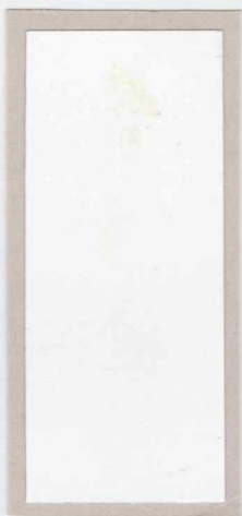
unusual vertical pair