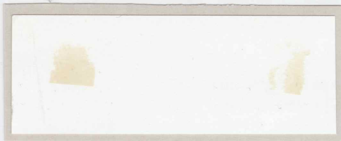
largest known used multiple