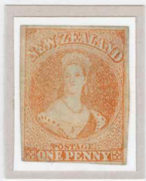
unused thin hard paper used - faint cancel