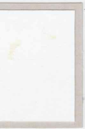
unused thick soft paper