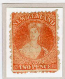
orange-vermilion R. 4/4