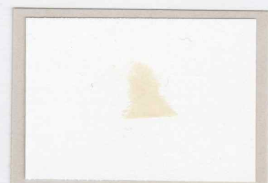
R. 18/5-6 retouched