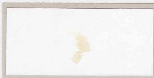
R. 19/4-6 retouched