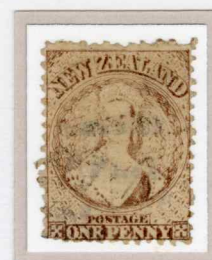
re-entry R. 19/3