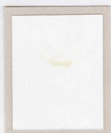
pale orange-vermilion R. 17/1 retouched