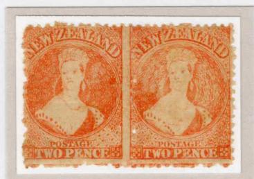
R. 17/8-9 retouched