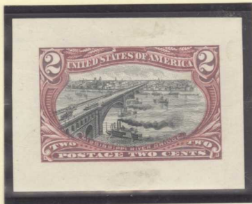
BI-COLORED ESSAY 286-E8 - 2¢ DARK RED & BLACK ON INDIA PAPER - REMOVED FROM CARD

These essays were printed on India paper and die sunk on large cards for presentation. The example here has been removed from card and cut close.