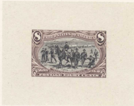
BI-COLORED ESSAY 289-E4 - 8¢ DUSKY RED & BLACK ON INDIA PAPER - DIE MOUNTED ON CARD

This essay was printed on India paper and mounted (not sunk) to presentation card.