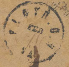
Floyd C.H. Va. CDS Feb. 16 (1863). Additional strike ties pair of 5¢ Blue Local Prints to flap. Turned cover, inside usage is hand carried.