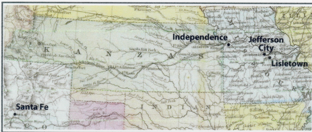
Map showing the showing origin of the cover at Santa Fe, end point of the Hall Contract route at Independence point of the mail robbery Lisletown, and post office where recovered mail processed at Jefferson City.

(from the Daily National Intelligencer of November 2, 1855)