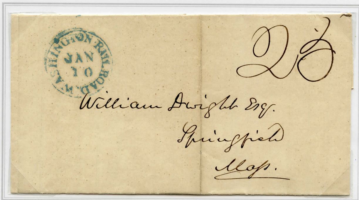
WASHINGTON RAIL ROAD JAN / 10

The payment remained constant until July 1868.