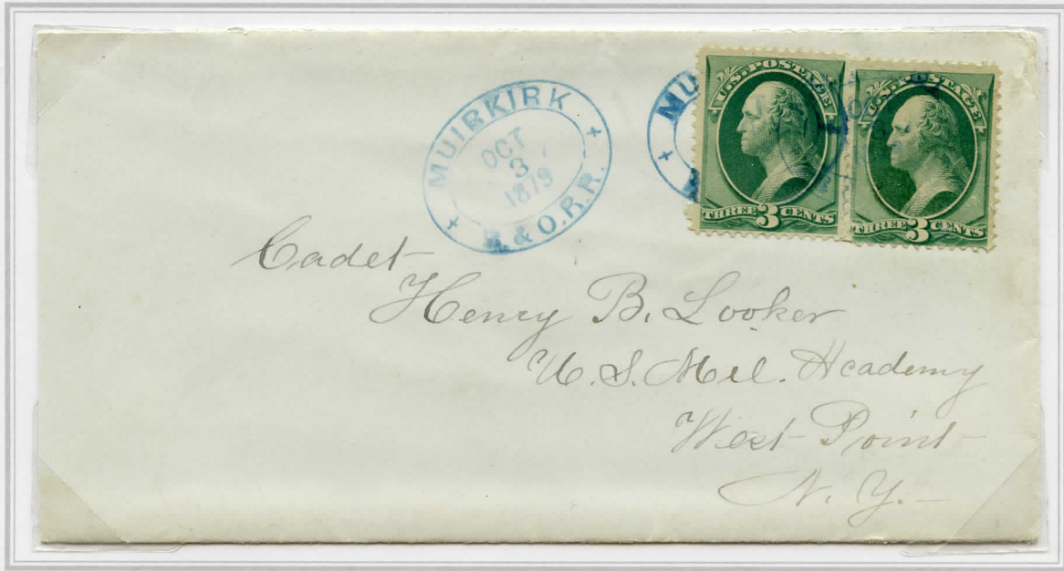
MUIRKIRK B. & O. R.R. / OCT / 3 / 1879

A total of 5 stations are recorded as using Station Agent date stamps, these being Beltsville, Branchville, Jessup's, Muirkirk and Laurel. This was out of a total of 14 offices served between 1838 and 1872.