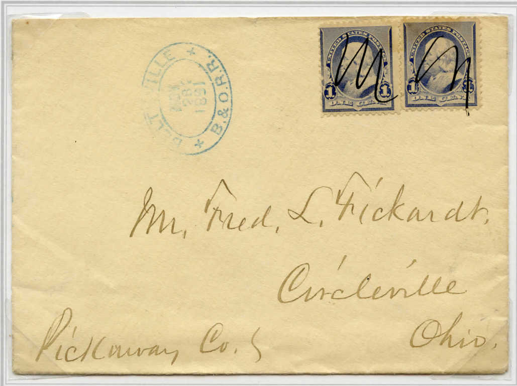
BELTSVILLE B. & O. R.R. MAY / 28 / 1891

Envelope franked at 6 cents for double weight put onto Muirkirk Station for Route 10003 to be carried 25 miles to Baltimore for transfer via Philadelphia and New York to West Point.