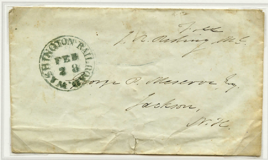
WASHINGTON RAIL ROAD / FEB / 28