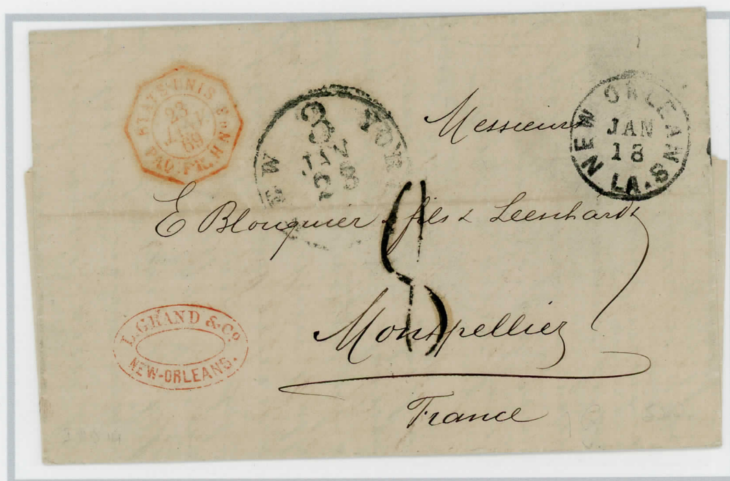
23 January 1869 New Orleans, single rate unpaid, steamer Ville de Paris to Brest (arv. 1.1)