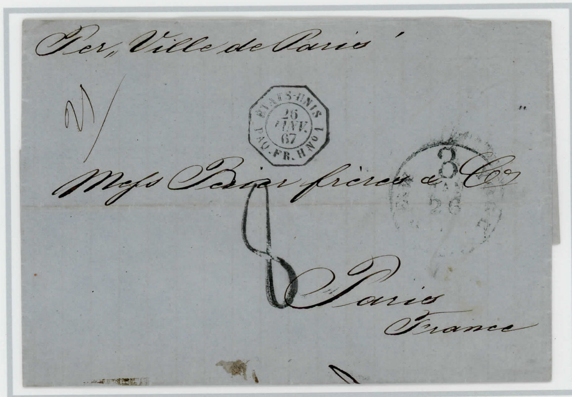
26 January 1867, single rate unpaid, steamer Ville de Paris to Brest (arv. 2.4)