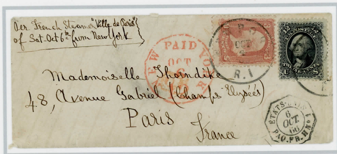
6 October 1866 New York, prepaid with 12¢ and 3¢ 1861 issue, steamer Ville de Paris to Brest (arv. 10.18)