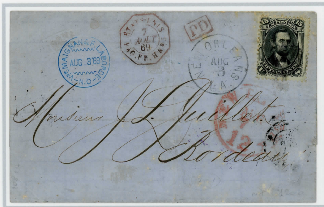
7 August 1869 New Orleans, prepaid with 15¢ Grill issue, steamer Ville de Paris to Brest (arv. 8.16)