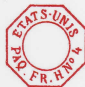
29 May 1869 New York, prepaid with 15¢ 1869 issue, type I, steamer St. Laurent to Brest (arv. 6.8)