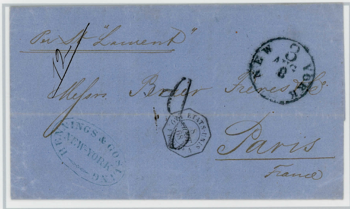
8 August 1868 New York, single rate unpaid, steamer St. Laurent to Brest (arv. 8.18)

There doesn't seem to be any rationale behind the choice of black or red ink in the marking of covers by the Line H postal agents. All markings from a particular trip are in the same color. Black and red postmarks are found almost equally.