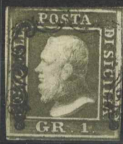
3150 N°19. 1g Dark Olive Green used. Signé 100.00 •75 / Behr-Drouot s/n 6