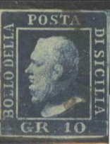
4644 Sassone 12b. 10g Indigo used. •90 / Behr-Drouot s/n 8