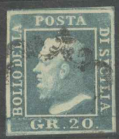
4645 Sassone 13. 20g Slate grey used. •115 / Behr-Drouot s/n 8