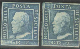
2913 N°20. 2g Bleu x 2ex. 1ex planche I et 1ex planche III. Les 2 signés Diéna. Gomme partielle. T.B. (Sassone) (Image) 150.00 •60 / F.Feldman s/n 79