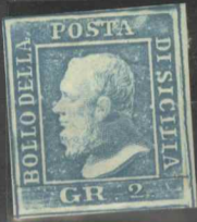
4636 Sassone 6. 2g Blue used. •27 / Behr-Drouot s/n 8