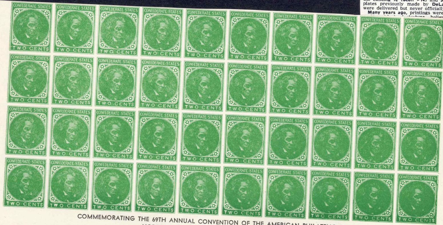
COMMEMORATING THE 69TH ANNUAL CONVENTION OF THE AMERICAN PHILATELIC SOCIETY NORFOLK, VIRGINIA, SEPTEMBER 21, 22, 23, & 24, 1955