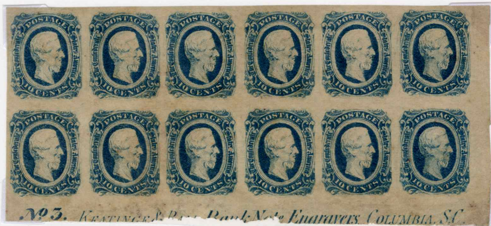
Plate No. 3

Imprint of Keating and Ball, Columbia, South Carolina