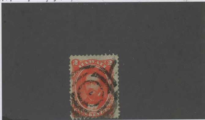
Style No. 102BK

HAWAII #31° SON GREAT COLOR POINP# 4-24 ring cancel R3 Price #14- 1870-1875