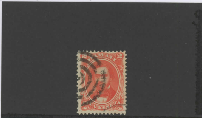
Style No. 102B

HAWAII #31° ROSE R3 #21-'19 1864 FANCY RING-4-24 Price for stamp