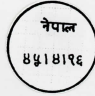
NEPAL JULY 24, 1888 BLACK