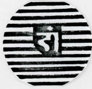
SALYAN UNDATED BLACK