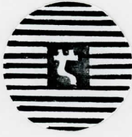
DAILEKH UNDATED BLACK