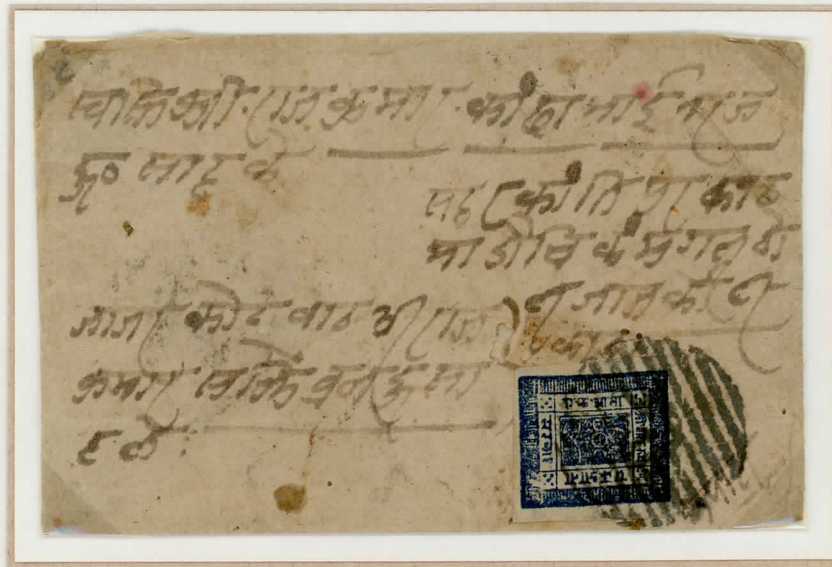
COVER WITH 1 ANNA DARK BLUE STAMP, ISSUE OF 1886-1900.

STAMP PRINTED ON THIN NATIVE PAPER, IMPERFORATE. POSTMARK AND RECEIVING MARK AND THE ROYAL SEAL OF THE LOCAL RAJA WITH POWERS OF LANDLORD ARE ON BACK OF COVER.