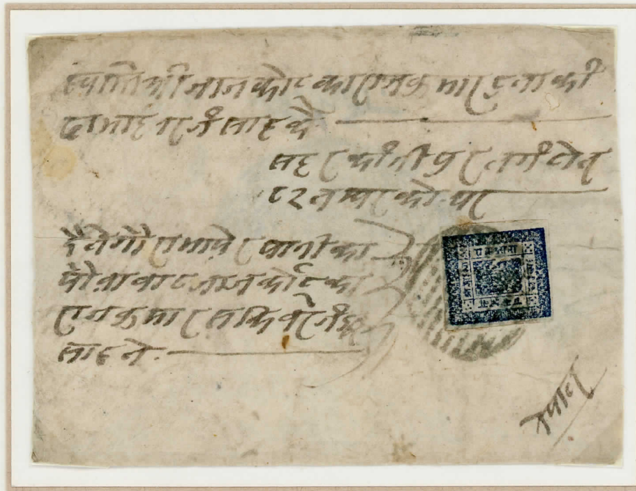
COVER WITH 1 ANNA DARK BLUE STAMP, ISSUE OF 1886-1900.

STAMP PRINTED ON THICK NATIVE PAPER, IMPERFORATE, MOTTLED PRINTING, MOST UNUSUAL FOR THIS DATE.