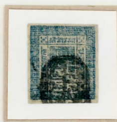
TAULIHAWA POSTAL SEAL