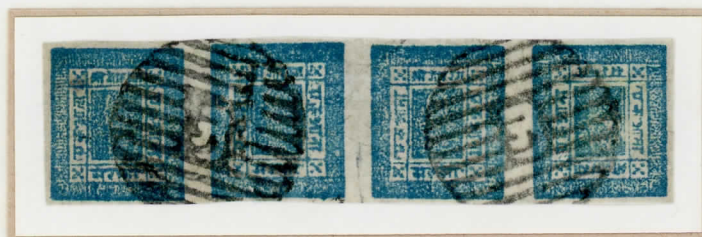
JUMLA FOURTH STAMP, INVERTED CLICHE VARIETY