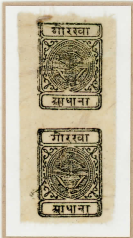
PAIR WITH TOP FRAME FLATTENED ON UPPER STAMP, CLICHE 17. PRINTED ON MEDIUM NATIVE PAPER. PARTIALLY DOUBLE PERFORATED BETWEEN THE TWO STAMPS.

SETTING 3, PIN-PERFORATED 1/2 ANNA, BLACK