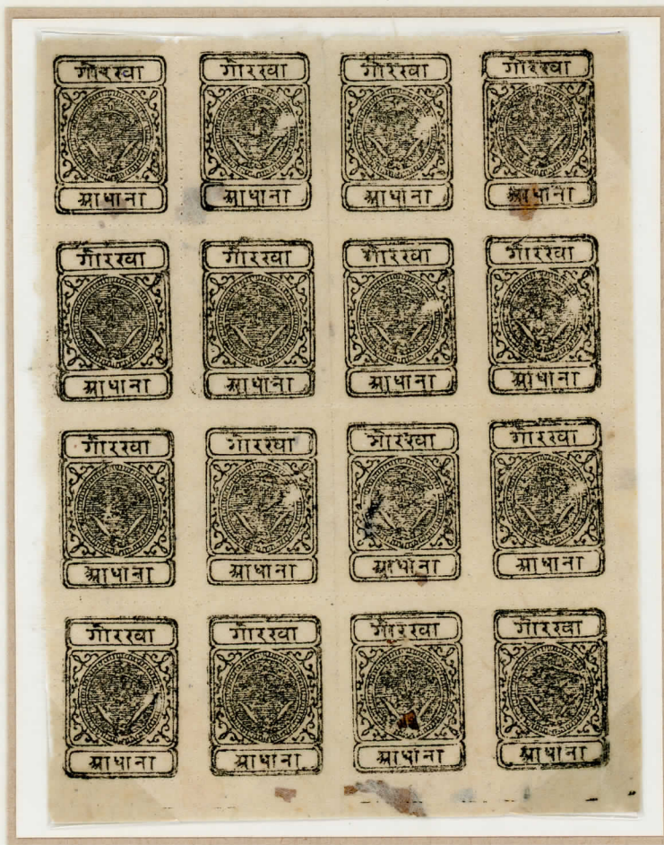
BLOCK OF 16, NO INVERTED CLICHES. PRINTED ON THICK POOR QUALITY NATIVE PAPER.