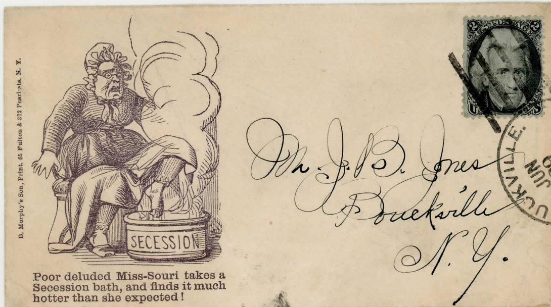
Genuine Civil War Patriotic cover and Black Jack, but used during the 20th Century.