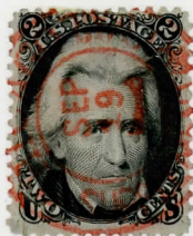
Chicago Supplementary Mail, Type B cancel is unknown in red.