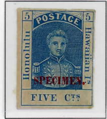
Reprints Official Imitations 1869