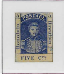
Thin Bluish Wove Paper 1861