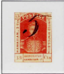
Re-Issues White Wove Paper 1868