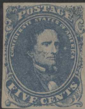
5c Dark Blue Stone 3 Pos 10 (CSA4a).