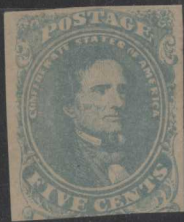
5c Light Milky Blue Stone 3 Pos 24 (CSA4b)