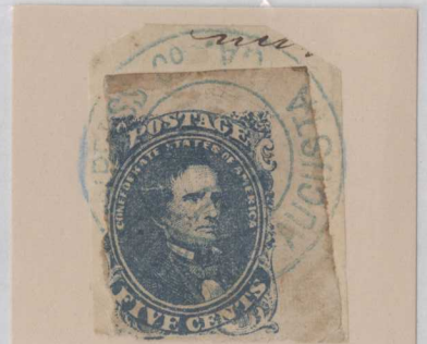
$600 Blue Augusta, GA. III