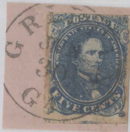
$300 Dark Blue II Jun 30 1862 Griffin, GA Last day of the 5 cent rate