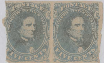
III $1000 Light Milky Blue