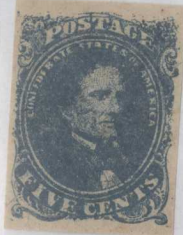
II $175 Dark Blue Curved line in shirt variety 4-2-v2