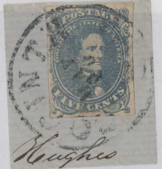
$200 Blue II May 28 1862 Corinth, MS