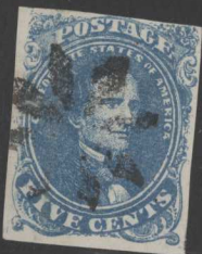
Dark Blue $200 Camden, SC II