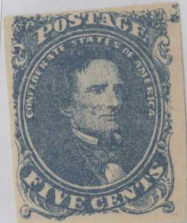
II Blue $300 Large Blob upper right variety 4-2-v8