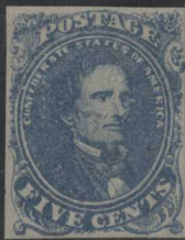
5c Dark Blue Stone 3 Pos 50 (CSA4a).