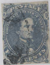
II $175 Blue w/ cut in right inner oval variety 4-2-v3