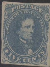
5c Dark Blue Stone 3