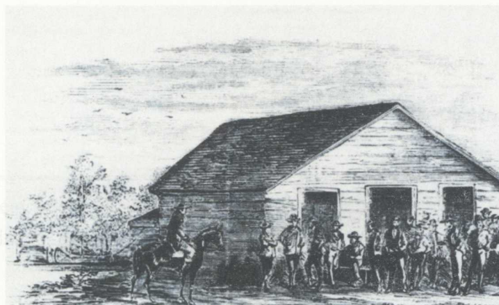
Leavenworth City & Pikes Peak Express Office ~ Denver City