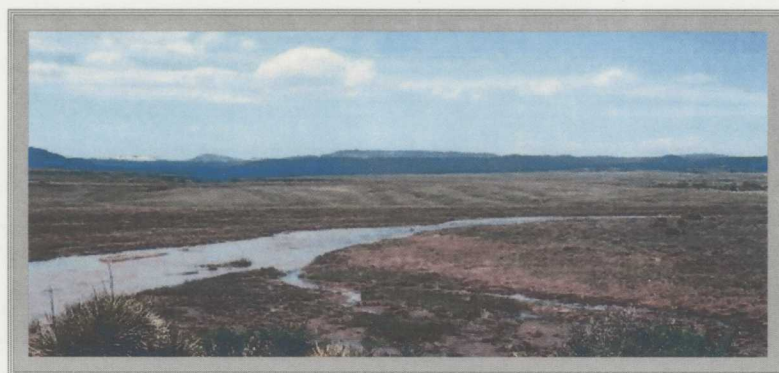
The Ocate Crossing on the Santa Fe Trail

A secondary trail went northwest from Ocate Crossing, northwest into Manueles Canyon to Black Lake and on to Taos. Ocate had a reputation as being an important exchange point for the transit of merchandise by wagons, with some goods on the Ocate Trail to Taos, other wagons going onto Las Vegas and Santa Fe.