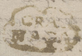
Letter dated Jan.4 1799 from Granada to Villa Nueva (San Jose, Costa Rica). "Granada" struck in a greenish black ink which was used until about 1800.