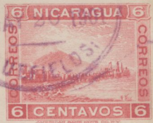
NICARAGUA 1901 : cover from Bluefields to Managua with 1900 Momotombo 2c, 3c, 4c, 5c and 6c values (total 20c). The 6c is particularly scarce on cover. An attractive 5-colour franking (NI/14352/C)