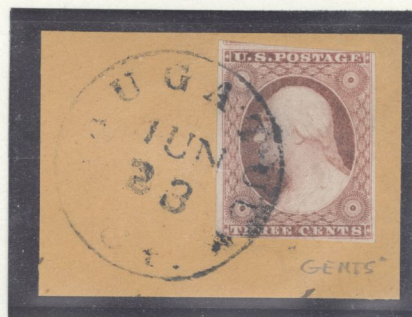
Double Transfer "GENTS" 66 R2(L)