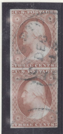
Largest of the four major cracks from Plate 5 84 - 94 L5 (L)