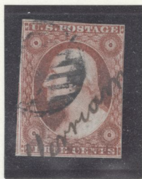
Double Transfer Line thru "THREE CENTS" Rosettes Doubled 92 L1(L)