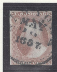
Second largest crack from Plate 5 96 L5 (L)