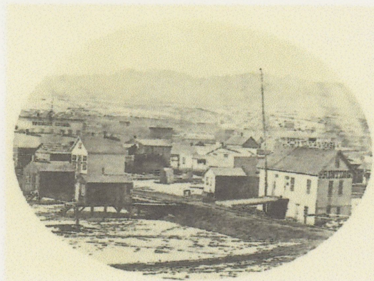
Denver City, K. T. ~ 1860's